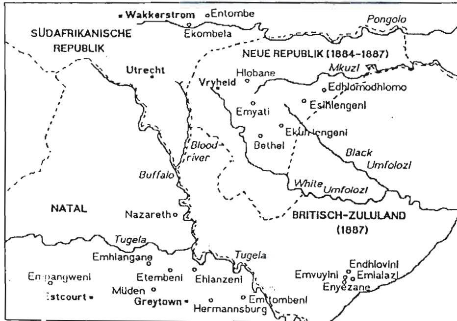
Karte 3: DAS ZULULAND UND DIE NEUE REPUBLIK

Legende: STAATEN UND KOLONIEN "weiße" Städte und Dörfer Flüsse Hermannsburg Missionstationen