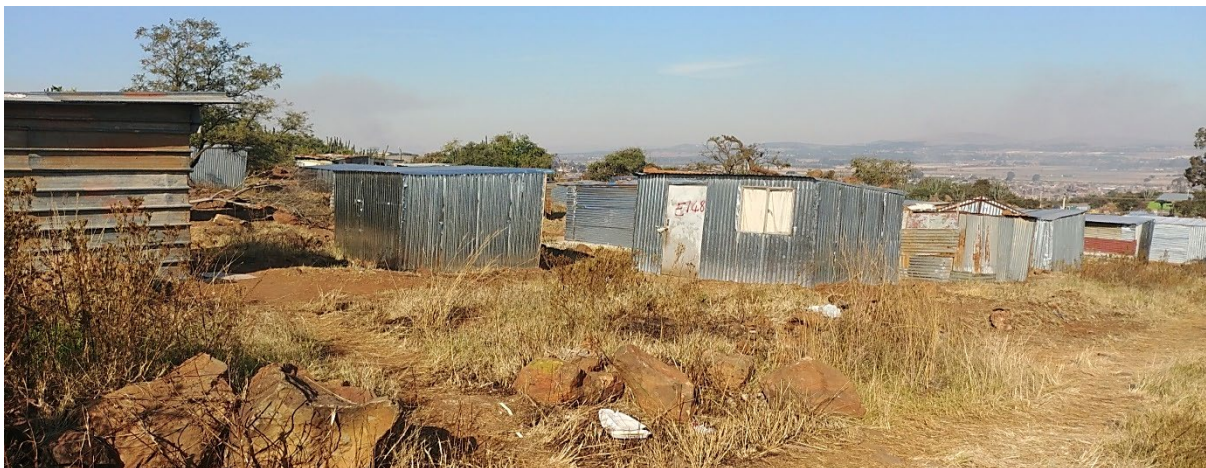
Figure 14: The enclosed 'squatter camp', Ekuhluphekeni

Ekuhluphekeni is an IsiZulu word which translates to 'a place of destitution' or 'a place of