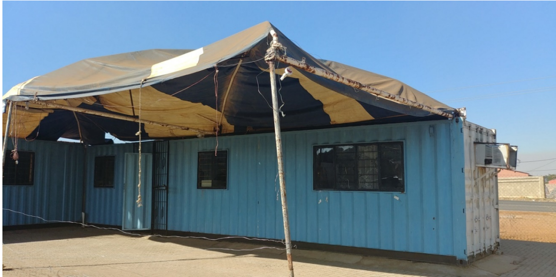
Figure 16: The CLING container