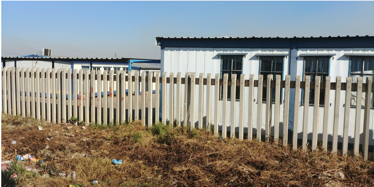
Figure 18: Prefabricated structures or containers, Freedom Park Primary

Another school we walked towards was Freedom Park Secondary School, which is also known as Brown's because of the colour of the school uniform. This school was built after Freedom Park Primary School. Before that, parents used to take their children to the schools in Soweto or Eldorado Park for their secondary education. It is an enormous school, but it is also overcrowded, as was evident in the throngs and throngs of children that came out as the school closed. I have never seen so many children in one school in one day! PK conceded that it was understandable for this school to have so many learners because it was the only secondary school in Freedom Park. It accommodates learners from the three primary schools, all of which are also very overcrowded.