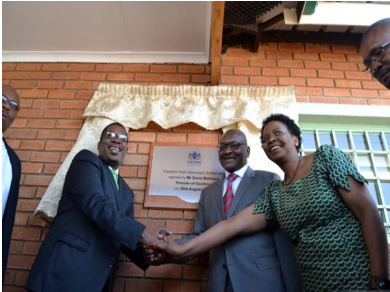
Figure 1: Freedom Park Secondary School being opened by the Gauteng Minister of Education (Macupe, 2014)

The clinic is said to be a state of the art clinic ready to take on the private clinics, boasting ‘nine consulting rooms, including a mother to child acute care, an adolescent centre and emergency room with all the equipment to stabilize a patient’ (City of Johannesburg, 2014).