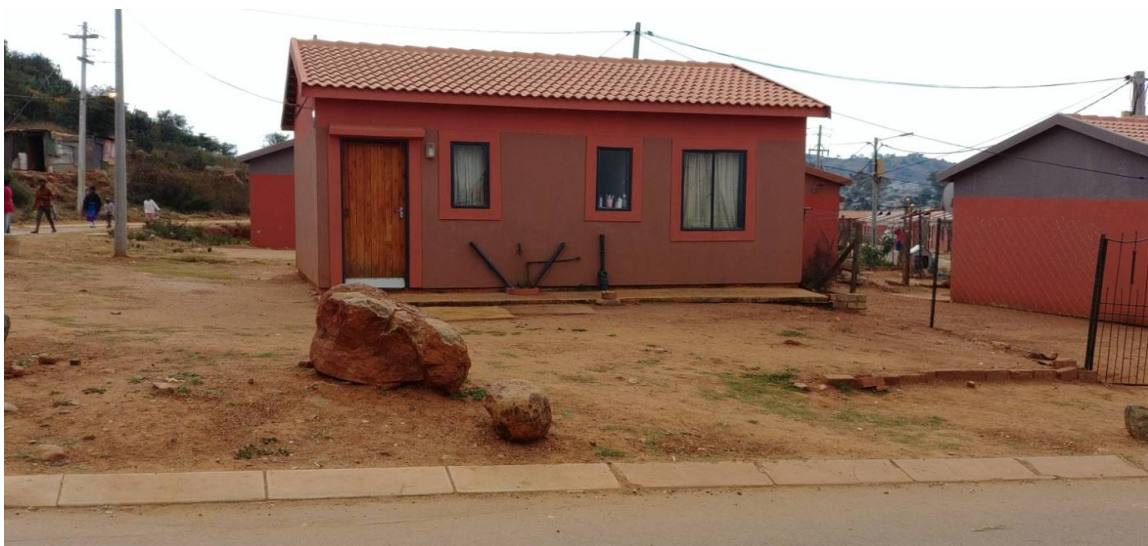
Figure 10: The latest ('modern') RDP house, with a bath and shower, in Extension 35 area

As can be seen, some RDP houses are free standing; others are semi-detached. These latter RDP houses are called omasxhawulane (known as omasxha) to denote that they are joined together such that the dwellers 'feel' they are literally shaking hands. The residents of these RDP's have to share the yard with the neighbour unless of course the neighbour has means to erect a wall or a fence. They also have geysers. The latest, 'modern', RDP houses have an inside bath and shower.