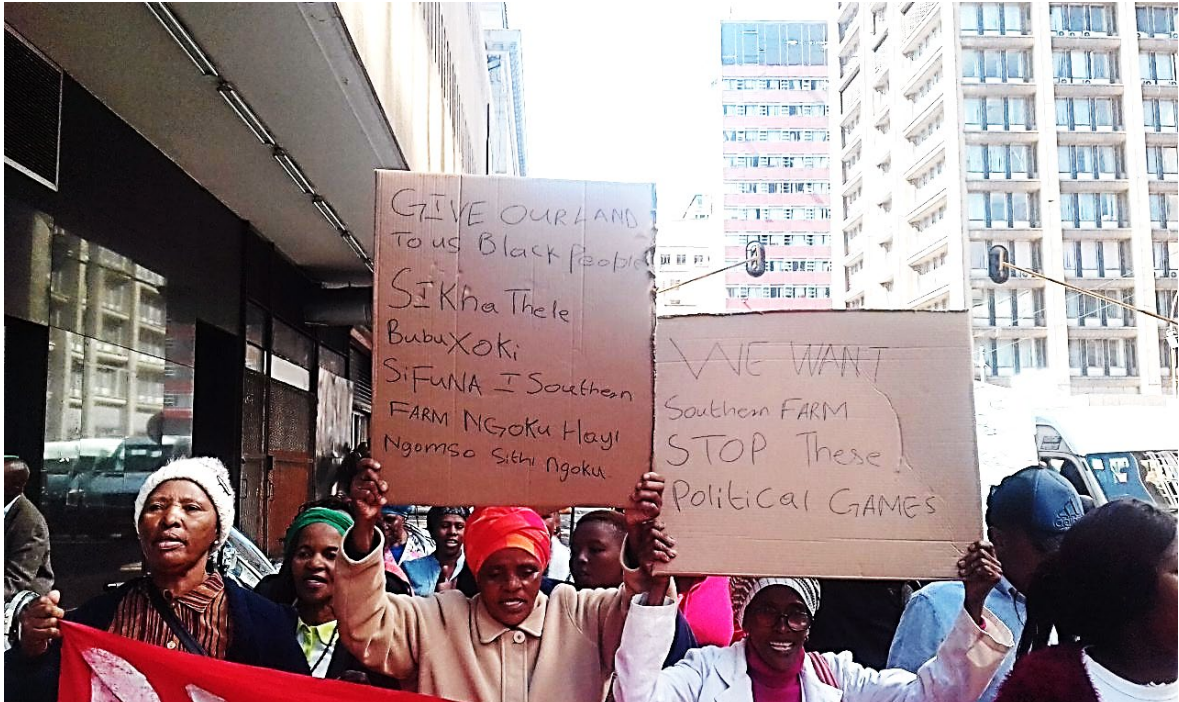
Figure 21: Abahlali protesting outside Luthuli House, October 2018