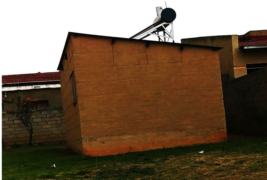
Figure 7: RDP house with inside toilets, in Extension 27 area

The area certainly has an assortment of RDP houses as shown in the pictures of the different RDP houses I collected during the transect walk: