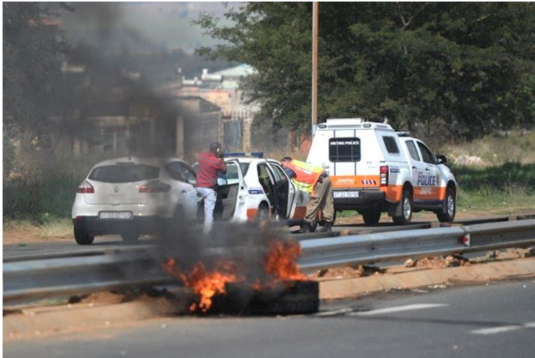
Figure 20: Golden Highway, May 2018

According to Phaks, 'many people are still living in shacks' and this is indicative of a chronic shortage of housing, necessitating land mobilisations. In recent times, the government had been, according to the Abahlali meeting I attended, 'stalling' on delivering the land (Southern Farms). This is the land that the backyard dwellers are waiting upon, as land on which to build shacks of their own. This has necessitated Abahlali continuing with the land struggle. The struggle they were waging at the time was for the Southern Farm Land which consisted of 48 000 stands and which, according to Abahlali, the government had promised to release, but was for some reasons 'playing political games' . This is the reason that on 22 October 2018 they went to picket outside Luthuli House while others remained behind and barricaded the N12. Outside Luthuli House, they were seen carrying placards with the following inscriptions 'Sikhathele ubuxoki, sifuna i-Southern Farms Ngoku hayi Ngomso' ( We are tired of your lies, we want Southern Farms Now, Not Tomorrow ). Another one read: 'We want Southern Farm. Stop these political games' .