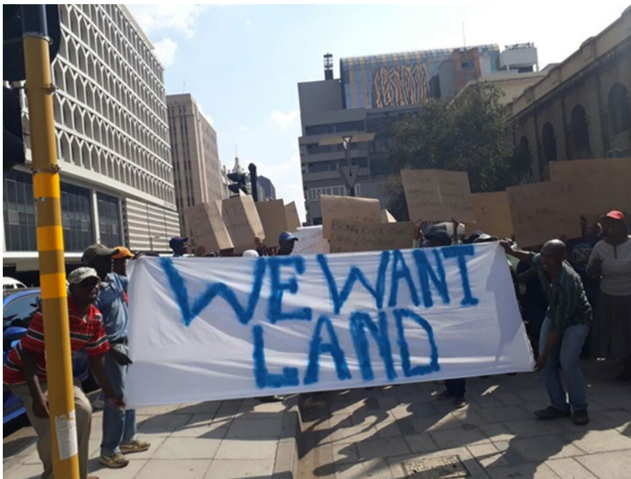
Figure 3: Abahlali outside Johannesburg High Court, April 2014

Abahlali went to court to demand a forensic investigation into the corruption in the distribution of RDP houses.