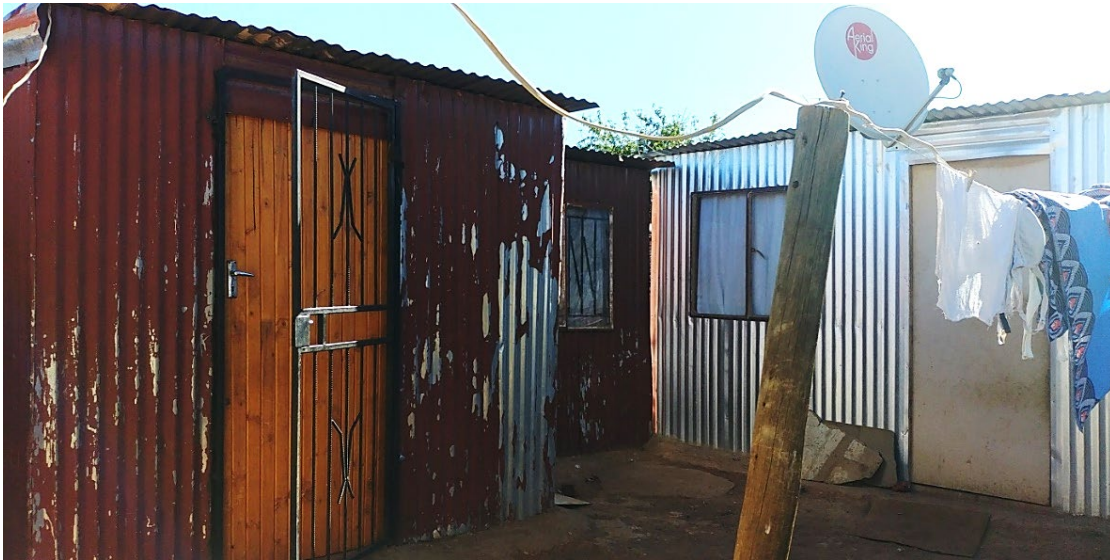
Figure 13: Backyard shacks

Whilst the residents of Freedom Park mostly stay in RDP houses, or in the informal settlements, there is a significant number of residents who are backyard dwellers. These residents are mostly renting yards from RDP house owners. Each yard may have eight to ten (or even more) households.