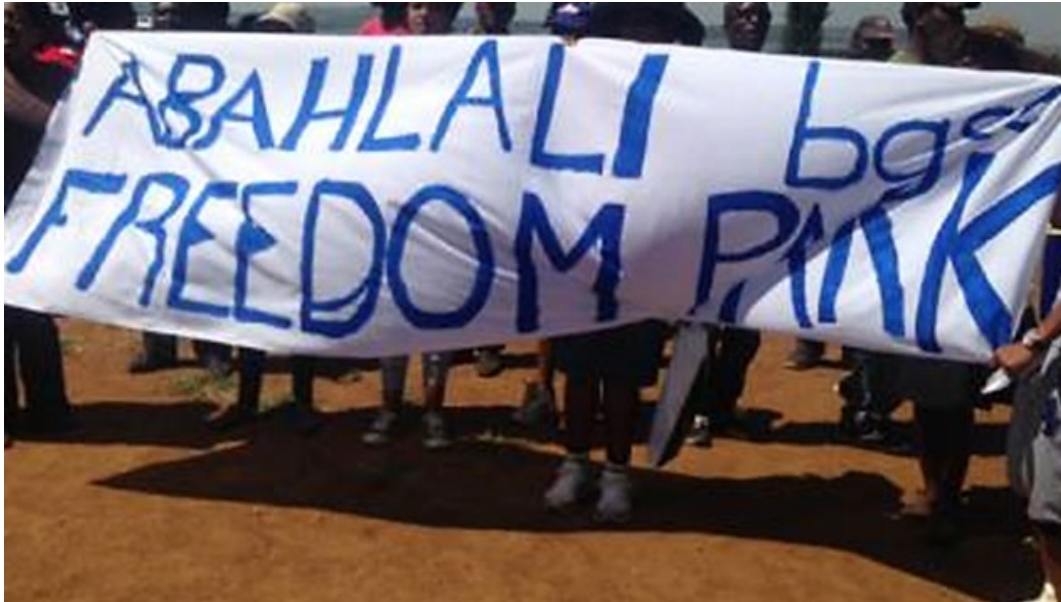
Figure 5: Abahlali pre-gathering before marching to Eldorado Park in August 2017

I participated in the march. During the march I interacted with the community members. This had a profound effect on my planned study for two reasons. Firstly, I was told that the Project was no longer running, but members of the Abahlali who had been involved with the CLING Project seemed to be driving an informal learning process, which they called ‘political classes’. This meant that although I could not study an actually existing Freirean-inspired non-formal education project, I could now look not only at the past project, but also its potential link to on-going informal learning. It was as a result of this that I constructed the third research question used in my study.