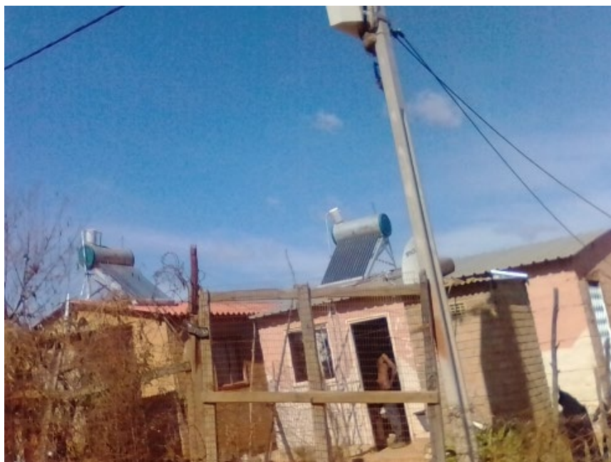
Figure 8: RDP house with outside toilets and 'asbestos' roofing, in Siyaya area