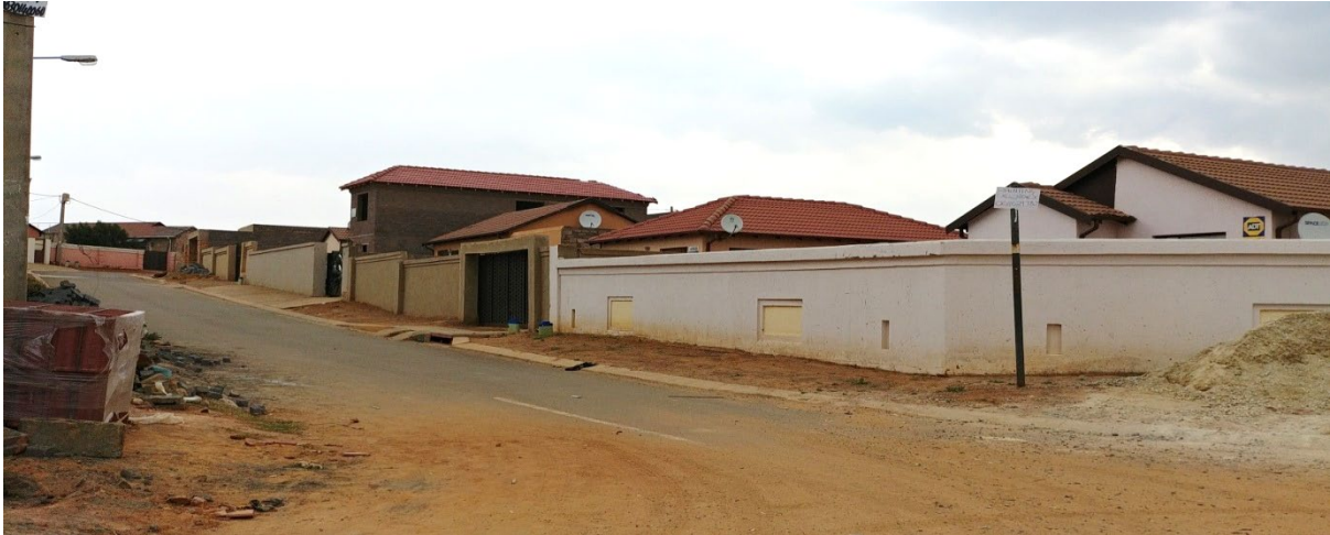
Figure 11: The bonded section, in Matlapeng area

Freedom Park is currently a combination of these RDP houses as shown above: ‘bonded’ houses (bonds have been taken out to improve them), flats, shacks and what the participants call ‘squatter camps’.