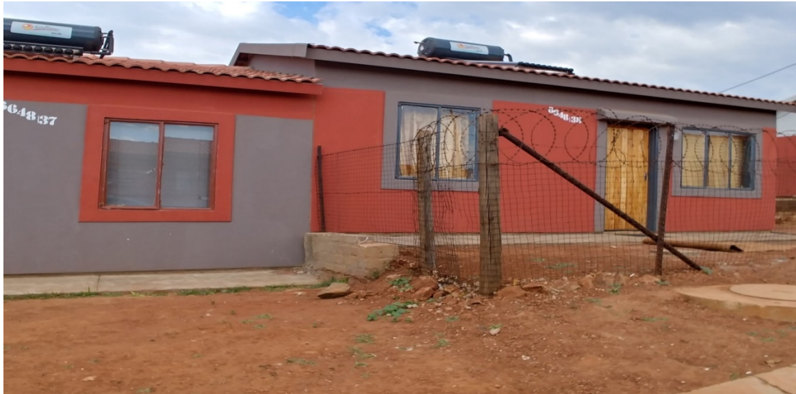
Figure 9: Omasxhawulane ('shaking hands') with a shared wall and yard, in Lindelani area

As can be seen, some RDP houses are free standing; others are semi-detached. These latter RDP houses are called omasxhawulane (known as omasxha) to denote that they are joined together such that the dwellers 'feel' they are literally shaking hands. The residents of these RDP's have to share the yard with the neighbour unless of course the neighbour has means to erect a wall or a fence. They also have geysers. The latest, 'modern', RDP houses have an inside bath and shower.