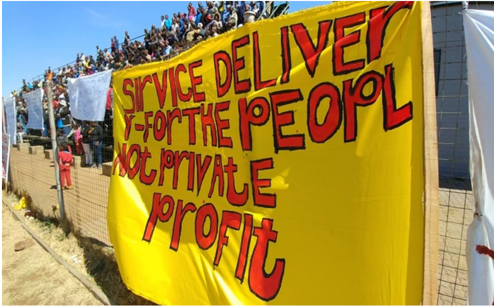
Figure 4: Abahlali baseFreedom Park, together with various other Gauteng communities, converged on Eldorado Park Stadium, August 2017