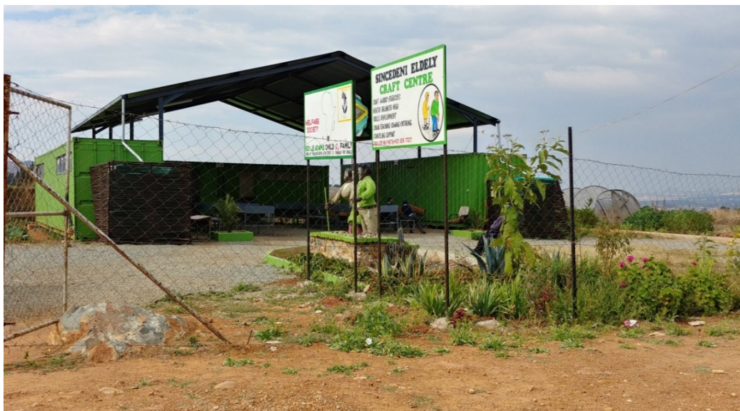
Figure 19: Sincedeni Centre, where the CLING adult education classes were run

During the transect walk we walked past the Sincedeni old age centre. This was where, according to PK, some of the CLING facilitators (Jabu and Nana) used to come and teach. It was a day-care centre that took care of the elderly during the day in cases where the caregiver has to be out for the day. It offered them skills such as knitting, sewing and, for those interested, reading and writing.