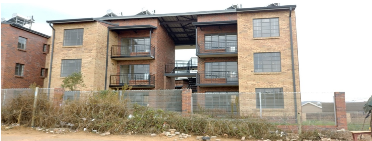
Figure 12: One of the four blocks of flats built by Joshkor, Mountain View area

Within the locality, there are four blocks of flats built by Joshkor a Johannesburg-based contractor. PK, one of the adult learners in the CLING Project, and one of the transect walk guides, said that they were for low-income groups; they are on a rent-to-buy basis. All four blocks were, however, empty, it is not clear why. PK thought it was because it is difficult for ‘squatter camp’ folks to move into areas where they have to pay for services, because they are not used to paying for services.