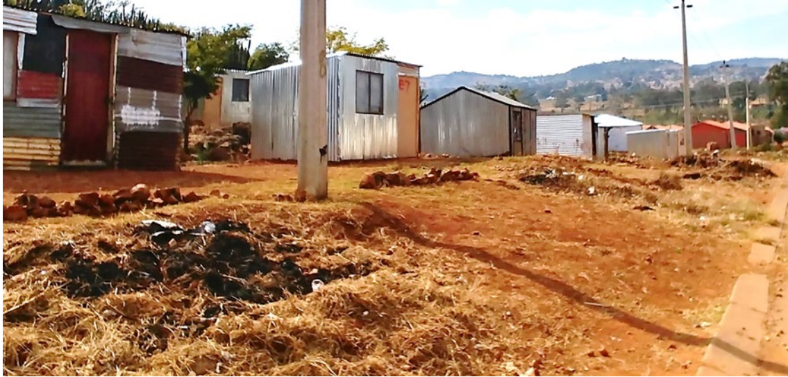
Figure 15: Lindela/Lindelani

I asked one of the residents what the area was called because I still could not believe Ekuhluphekeni could be the legitimate name. He responded in isiZulu and said that if I looked around long enough I would be able to give it a name. I asked why he said that. He said ‘Sisi, siyahlupheka la, nawe uyazibonela’ (My sister, you can see for yourself that we are struggling / we are destitute / we are poor here...). One of my guides confirmed that they knew the place as Lindela or Lindelani or the extension thereof because the folks living in the area are supposed to be waiting for their RDP houses and would be moved once these had been built and he had never been in the area and was seeing it for the first time. We confirmed that the area had no electricity, no water taps, no toilets, no roads other than paths created by cars or usage. It was evident in the conversation with one of the inhabitants of Ekuhluphekeni that there were shack lords who demanded a fine of R23 from the inhabitants for allegedly missing meetings.