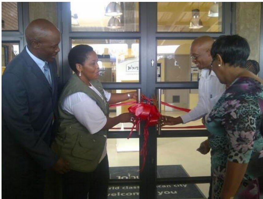
Figure 2: Freedom Park Clinic being opened by Parks Tau, the then mayor of the City of Johannesburg

The clinic is said to be a state of the art clinic ready to take on the private clinics, boasting ‘nine consulting rooms, including a mother to child acute care, an adolescent centre and emergency room with all the equipment to stabilize a patient’ (City of Johannesburg, 2014).