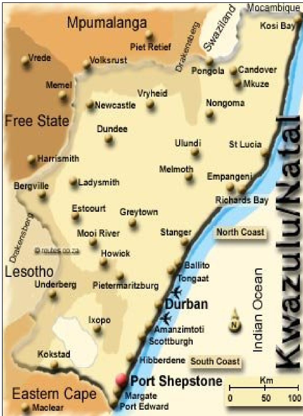
Figure 3.1: Map of Port Shepstone