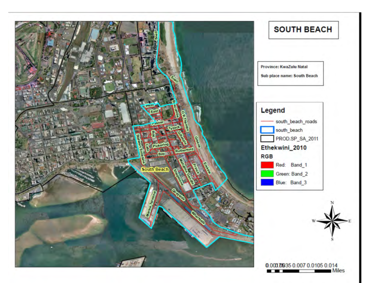
Figure 3.1: Map Showing Durban South Beach and Surrounding Area