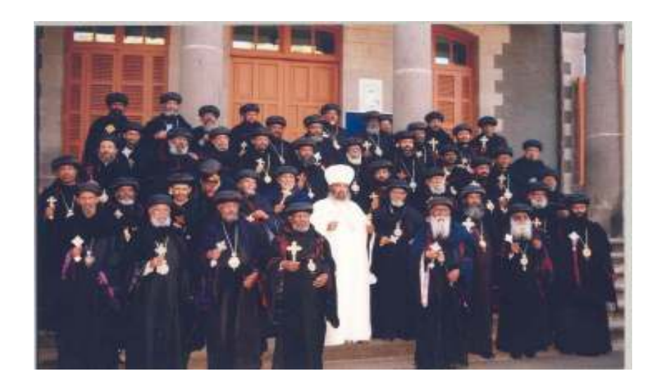
Figure 2: EOTC Bishops (all male), who are decision makers at Holy Synod.

The position of women within the EOTC and whatever role women or men are allowed or not allowed to play depends on the prerogative of men (male bishops) who are the only decision-makers in the Holy Synod.