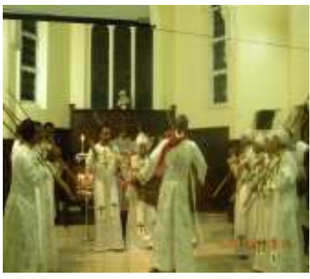
Figure 1: Women and men as part of the youth group perform the traditional religious dance called "woreb" at Durban St. Mary's EOTC parish day, 15 May, 2011 in the presence of the diocesan bishop Abuna Yacob.

As noted above, the EOTC has done much in terms of providing educational opportunities, but these have been delivered for a large number of men and for very few women. According to Dejene et al, "Ethiopia has a long history of traditional education,