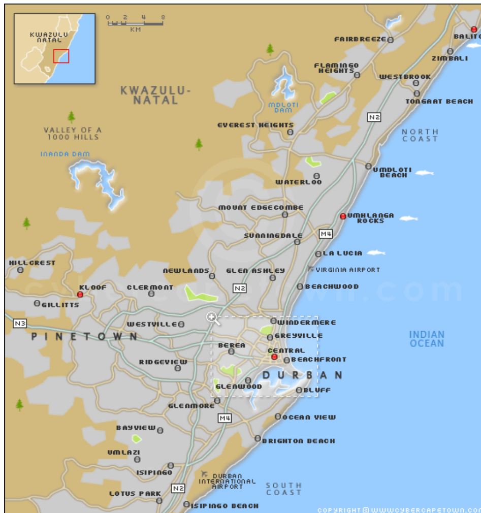
Figure 1. Map of Durban showing study location – South Central Durban