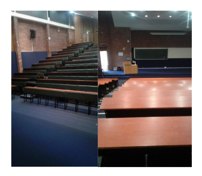
Figure 5.2.3. Picture showing the front and back view of the commerce lecture venue, specifically C12.