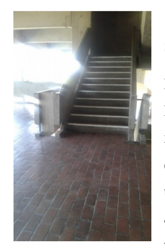
Figure 5.2.2. Picture showing an alternate entrance students with disabilities have to use if the lift is not working.

The New Arts Building, is also a building with a lot of staircases which lead to lecture halls, tutorial halls and administration or lecturers' offices. It must also be noted that it is a triple storey building. Students with disabilities therefore rely on the elevators as their aid to reaching these locations. Thus, a problem arises for students with disabilities when elevators are not working. An example of the stair cases that students have to use is depicted by figure 5.2.2.