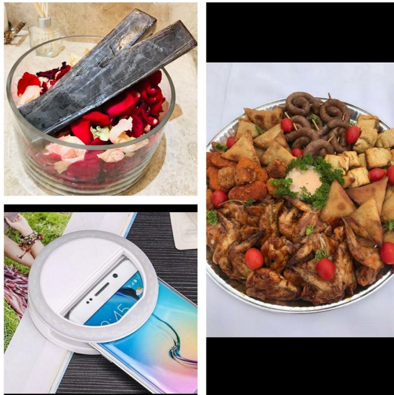
Figure 1: Black Soap, Ring Lights and Catering business of participant 5

The above pictures indicate the different business that participant 5 has. It shows that this participant can successfully manage different businesses.