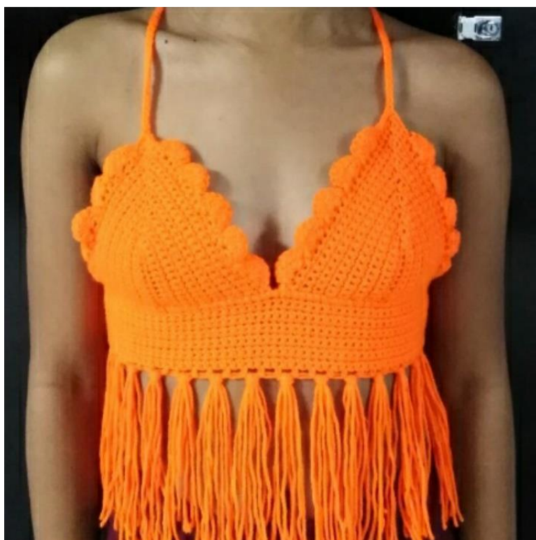
Figure 5: The Tailor business of participant 1

The picture above indicates the owner of a tailor business wearing a top which she made with wool.