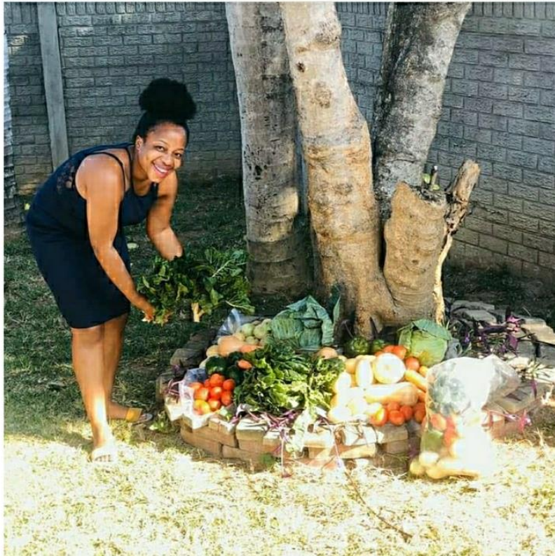
Figure 4: Fruits and Vegetables business of participant 3 – Siyamthanda Green Groceries.

The picture above indicates the owner of Siyamthanda Green Groceries who has a fruits and vegetables business. She is currently operating her business online since she has a challenge of not having a space to operate her business.