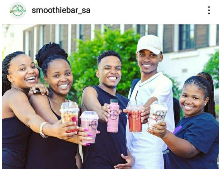
Figure 3: Picture indicating the Masseuse business of participant