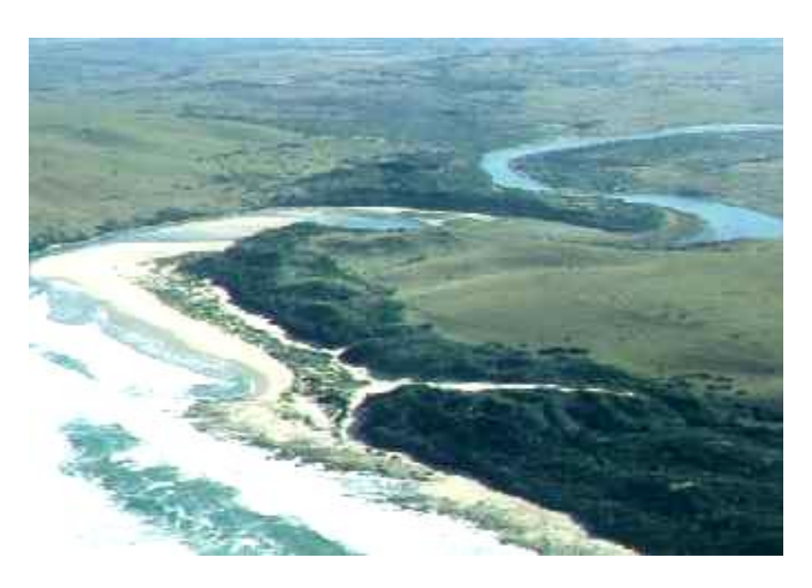
Figure 1: Picture of the Tyolomnqa Estuary in East London: Eastern Cape

The Eastern Cape of South Africa has several estuaries. Among these estuaries are the Fish, Kowie, Mngazana, Keiskamma Kasuka and Tyolomnqa estuary. While there are many estuaries, the Tyolomnqa Estuary was chosen as a case study. The Tyolomnqa Estuary is situated approximately 45 kilometers west of the East London near the coastal resort of the Kaisers Beach, which is illustrated in Figure 1 and 2. Historically the Tyolomnqa formed the eastern boundary of the Ciskei. A potion of the East bank of the estuary is utilized as an exclusive, low-density residential development and is called Chalumna Estates.