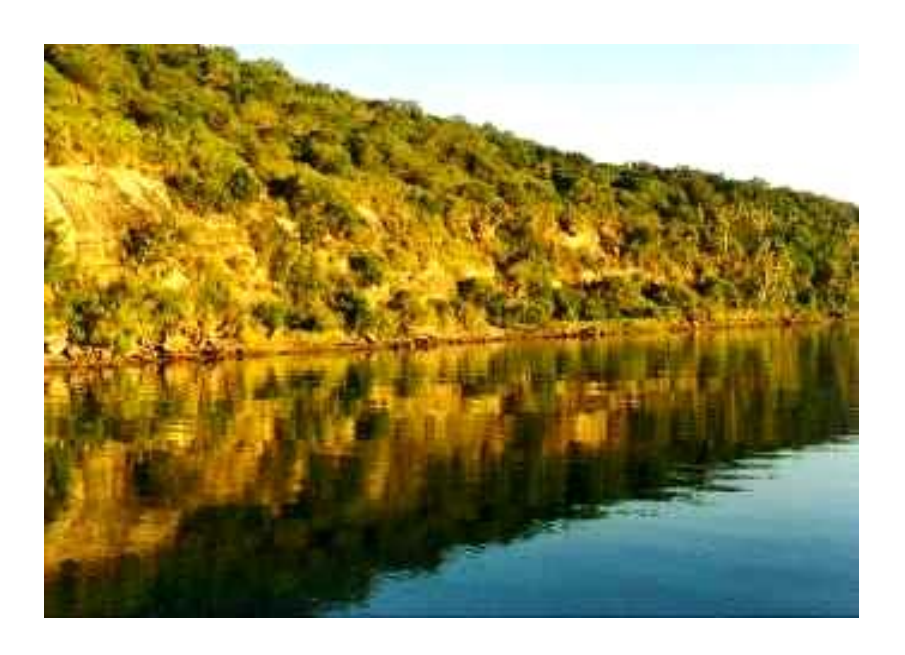
Figure 2: Picture of the Tyolomnqa Estuary in East London