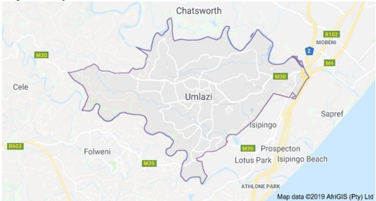
Figure 3.1 Map of Umlazi