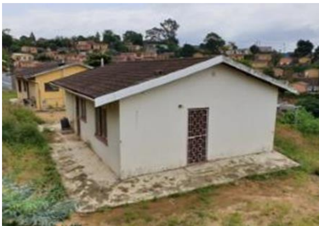
Figure 3.2: Houses in the area of Umlazi

Figure 3.2 shows the houses in Umlazi area. Most people reside in these types of houses with their families.