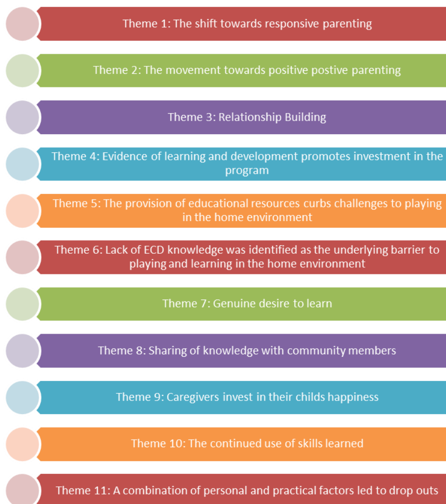
Figure 4.1: List of themes developed

The following table represents the criteria that was used for the development of the themes. It highlights the key terms, words and phrases that fall under each theme.