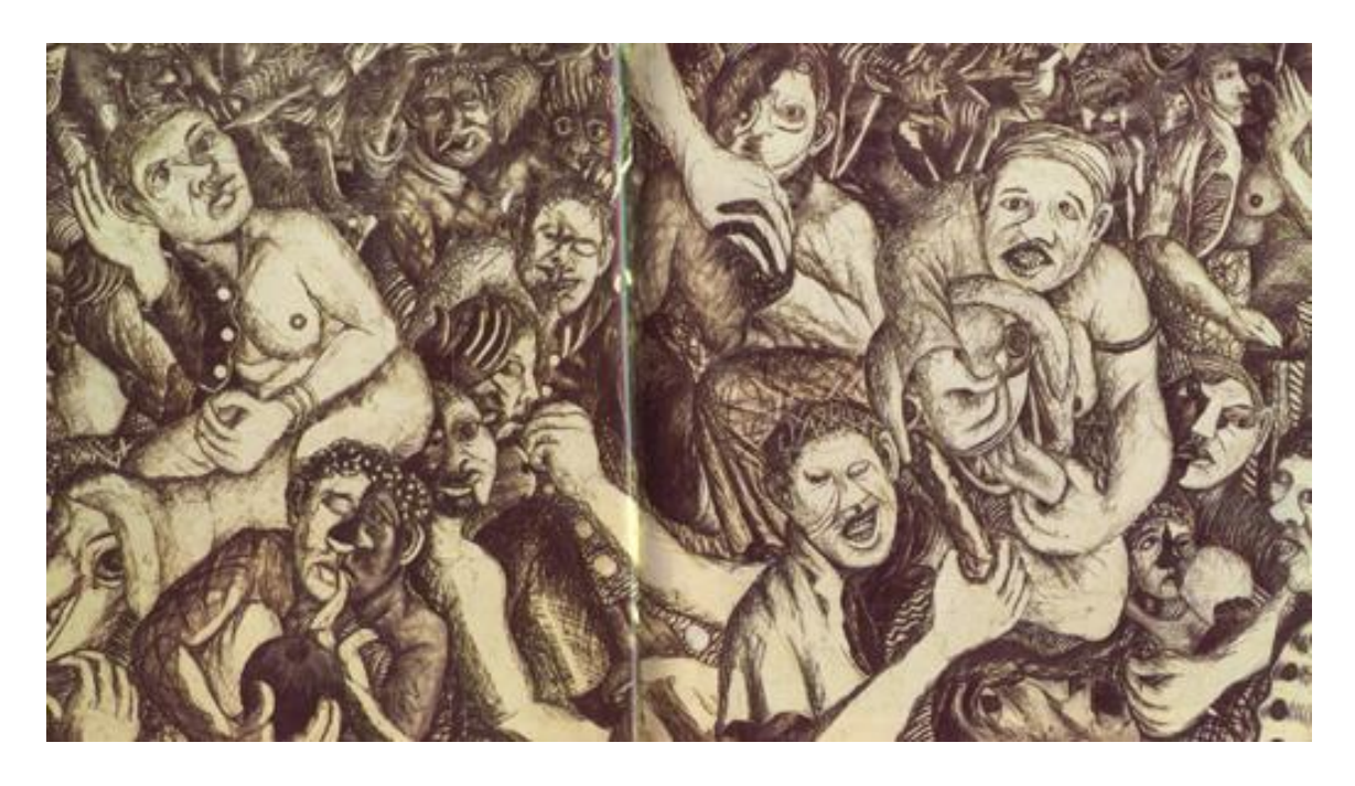
Fig 3.4.2 Tears of Africa (1988)<sup>2</sup>