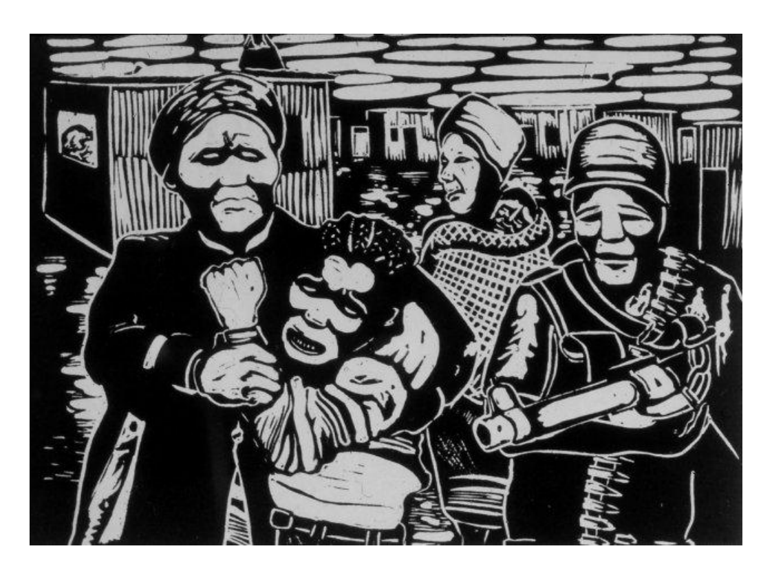
Fig 3.4.1 No Life (1987)<sup>1</sup>