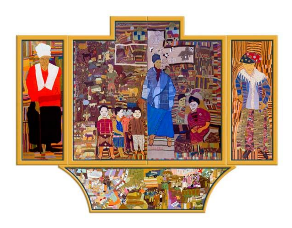
Fig. 5.5.4 Keiskamma Altarpiece (2005, The Closed Altarpiece.)<sup>45</sup>