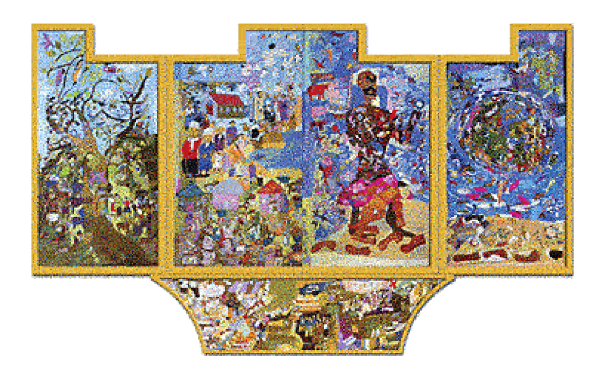
Fig. 5.5.5 Keiskamma Altarpiece (2005, Detail of the first opening of the altarpiece.)<sup>46</sup>