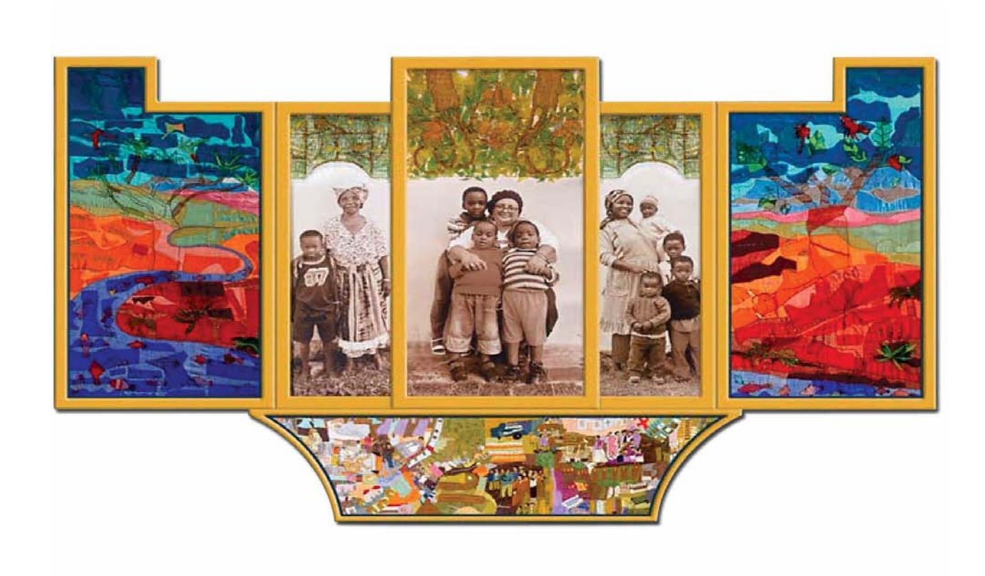
Fig. 5.5.6 Keiskamma Altarpiece (2005, Detail of the second opening of the altarpiece.)<sup>47</sup>