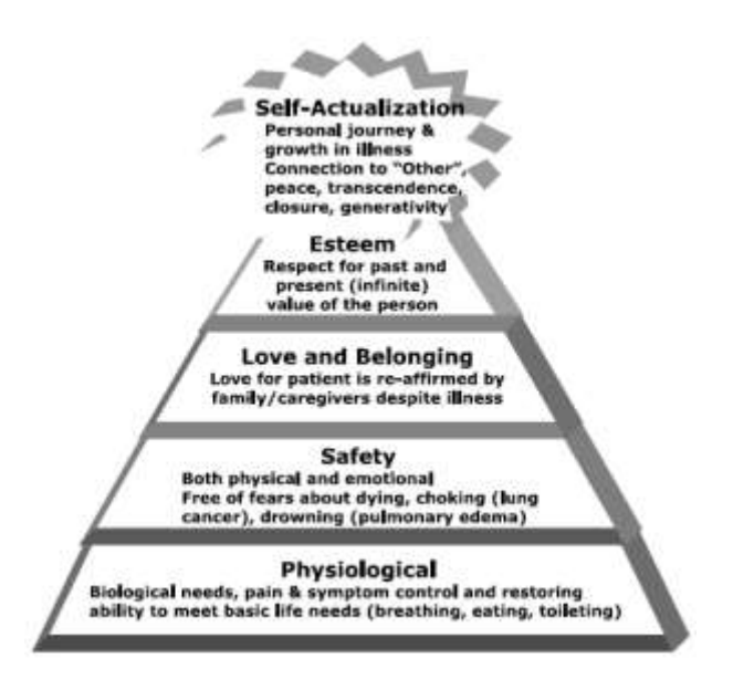
Figure. 1. Maslow's hierarchy adapted to hospice and palliative care (Zalenski & Raspa, 2012, p. 1124).

Zalenski and Raspa's (2012) adaptation of Maslow's hierarchy of needs for understanding care is described in the diagram below (Fig. 1.). They further suggest that satisfying the need for symptom control, safety, belongingness, and esteem is valuable in itself, as well as to inspire a patient and/or family to experience self-actualisation and transcendence (Zalenski & Raspa, 2012).