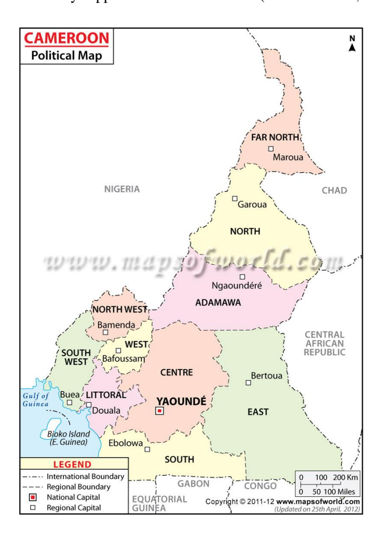
Figure 1: Map of Cameroon

and most of them live with chronic illnesses and/or disabilities (Essomba et al., 2020). In addition, most older adults have no medical insurance and are financially vulnerable. They go to health facilities that are not age-friendly environments, and most rely mainly on family solidarity support to afford healthcare (Essomba et al., 2021).