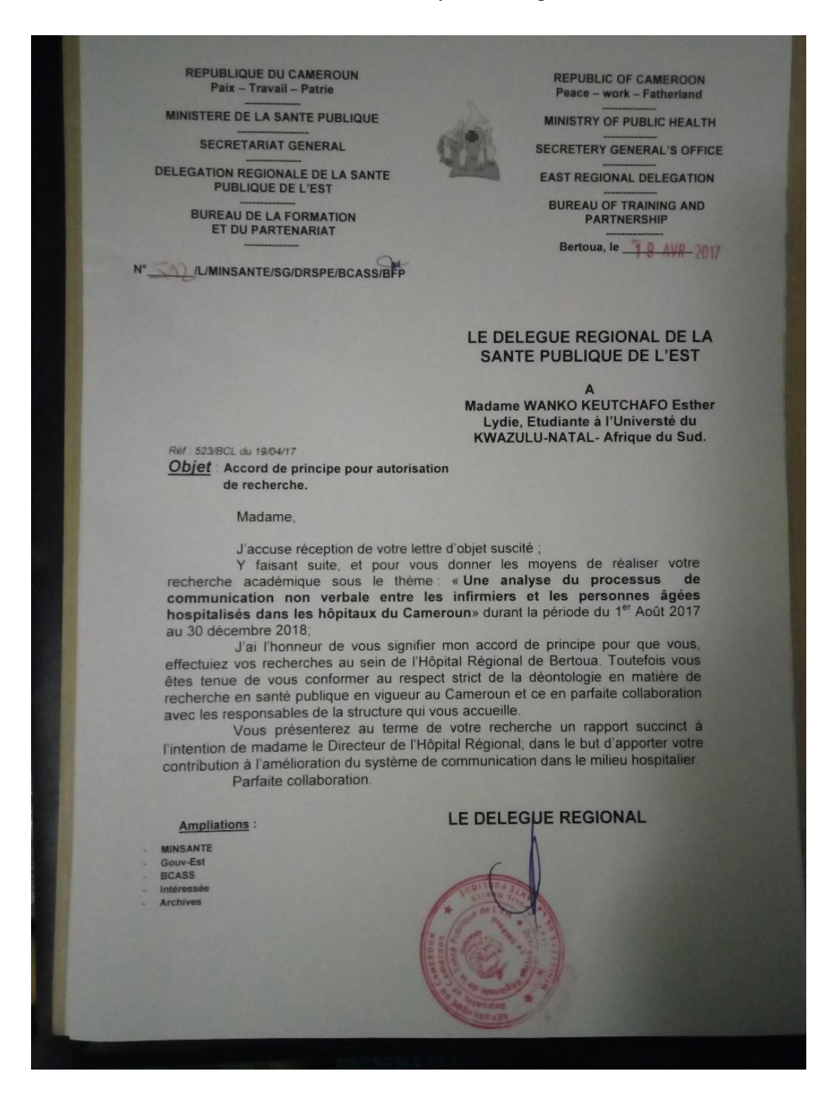
Annexure 12: Permission to Conduct the Study from Hospital 2