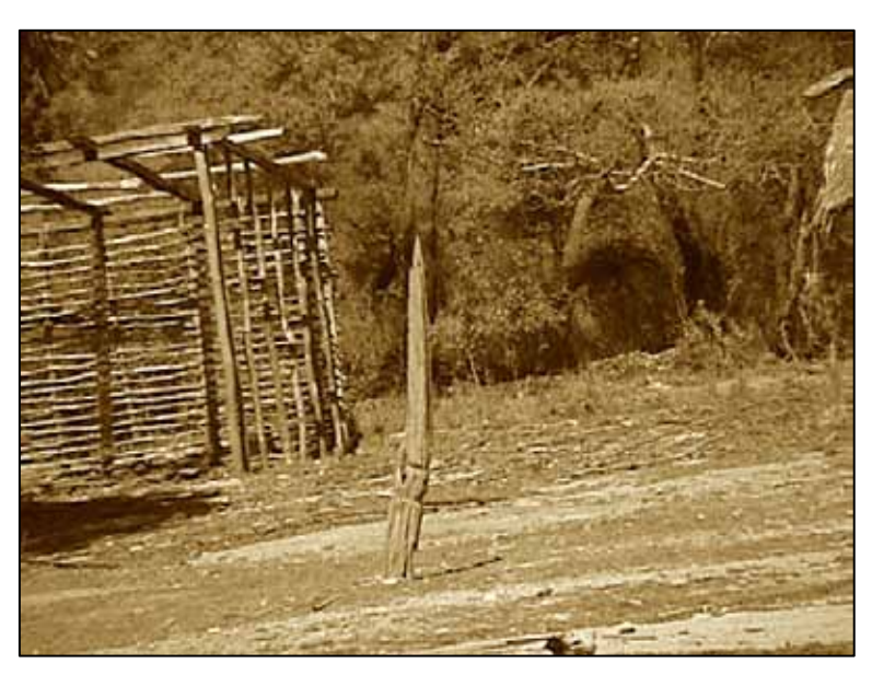
Figure 5: Hazomanga in Tongobory, Tulear Province

process of preparing the post for its sacrificial duties. Moreover, many of the ody ("talismans" or "medicines") of traditional religious practice are pieces of wood from various sacred trees infused with hasina ("holiness, sacred power") by the ombiasa ("traditional healers"). The interpretation of the elders of Ampitaneke seems to be just.