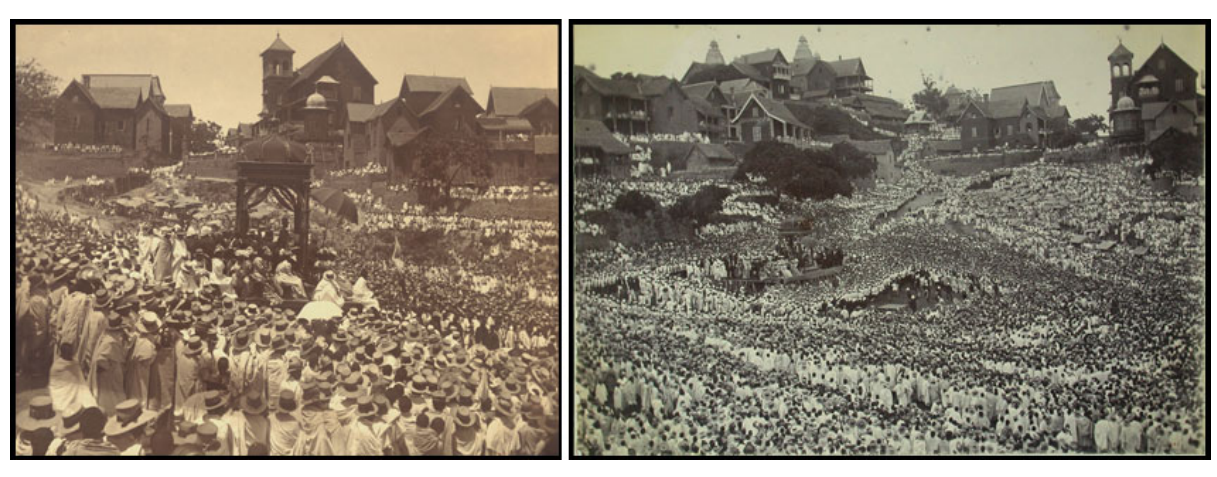
Figures 7 and 8: Queen Ranavalona III's last kabary at Andohalo, Antananarivo, 1895.

royal lineage as a counter to what she saw as the European royal lineages set up in the Bible.<sup>61</sup> As there would have been no written standard for validating the memories of these orators, it is more likely that the method of oral composition was similar to that described in Chapter 1. This method has survived in the current forms of kabary practiced in Imerina and Betsileo.