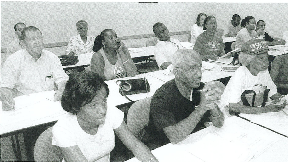
Figure 4.1: Traditional sitting method

The purpose of this section is to give the picture of the sitting arrangement in the class during observation. What was noted was that, although the students were seated in a traditional way where everybody faces the chalkboard, races were mixed in each desk. This sitting arrangement on its own confirmed that there was a healthy human relationship in this class. The students, just like in Figure 4.1 (example of a sitting arrangement), were sitting attentively listening and paying attention to the lesson.