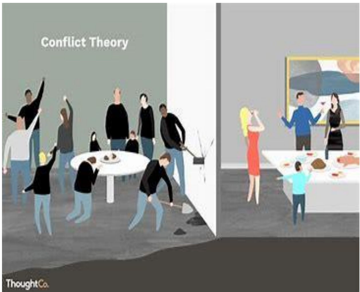
Figure 0.1 Representation of conflict theory in society (illustration by Hugo Lin)

Many individuals work extremely hard to make a living and break the chain of poverty. In this representation, the proletariat tries their best to ensure they survive on a daily basis (on the left) whereas the bourgeoisie (on the right) is able to live a lavish lifestyle. According to Karl Marx this system is called capitalism.