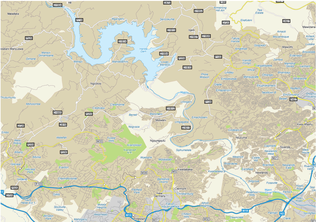
Figure 1:Map of Molweni Area.

It was necessary to have first-hand information pertaining to the sites of research. The researcher chose four schools from the area. These sites were chosen through purposive sampling since she wanted to explore how teachers were engaged in the pedagogical functions of reading while exploring the experiences in Foundation Phase and rural teaching. The map below is showing Molweni Area where the study was conducted. The school population consist of black learners who speak IsiZulu as their home language.