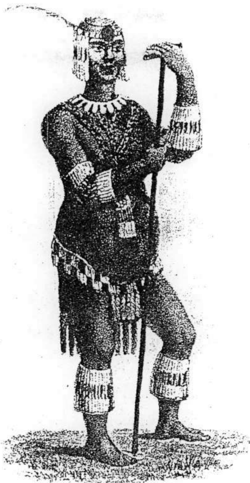
Dingane kaSenzangakhona 1788-1840