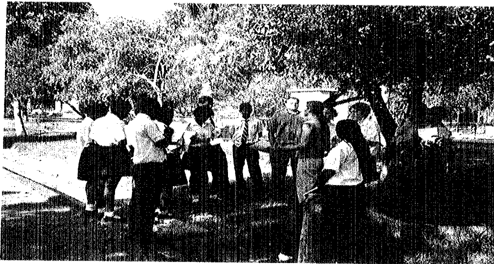
Figure 4.1: Photograph of out-of-school activity to CROW

Intellectual navigation as supported by the quality advance organizer provided by the field guide and the worksheet tool, had an effect on the EC members' learning from their visit at CROW. At CROW the EC members were presented with a short demonstration and explanation about raptors. Figure 4.1 shows a photograph of how the physical context influences the interactive participation that unfolded with the field guide and the EC members.