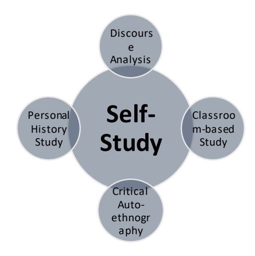
Diagram 4.1: Data generation methods in the self-study