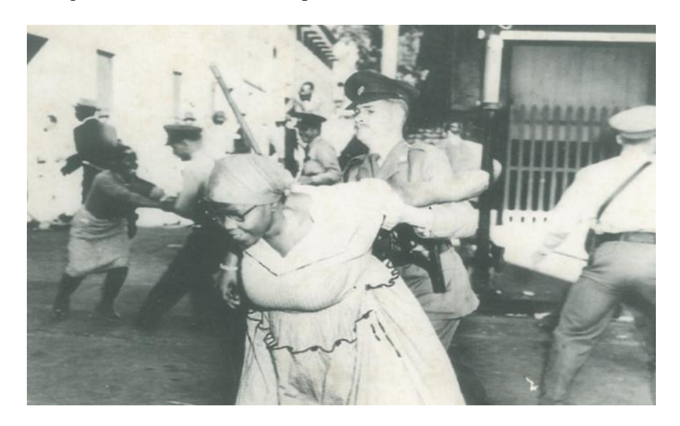
Image 3.1: Removal of women demonstrators from Victoria Street beerhall (18 June, 1959)

The picture that I chose as my artefact is a photograph, printed onto a postcard, depicting the police removing a group of Black women demonstrators from the Victoria Street beerhall, in Durban (South Africa), on 18 June, 1959. When researching the events of that day, I came across the dissertations of Paul la Hausse (1994) and Radhie Pillay (1998), who both analyse the significance of the beerhall protests.