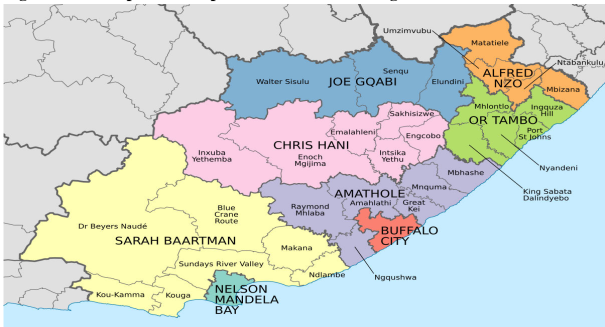
Figure 3.2.2: Map of municipalities of the Umtata region