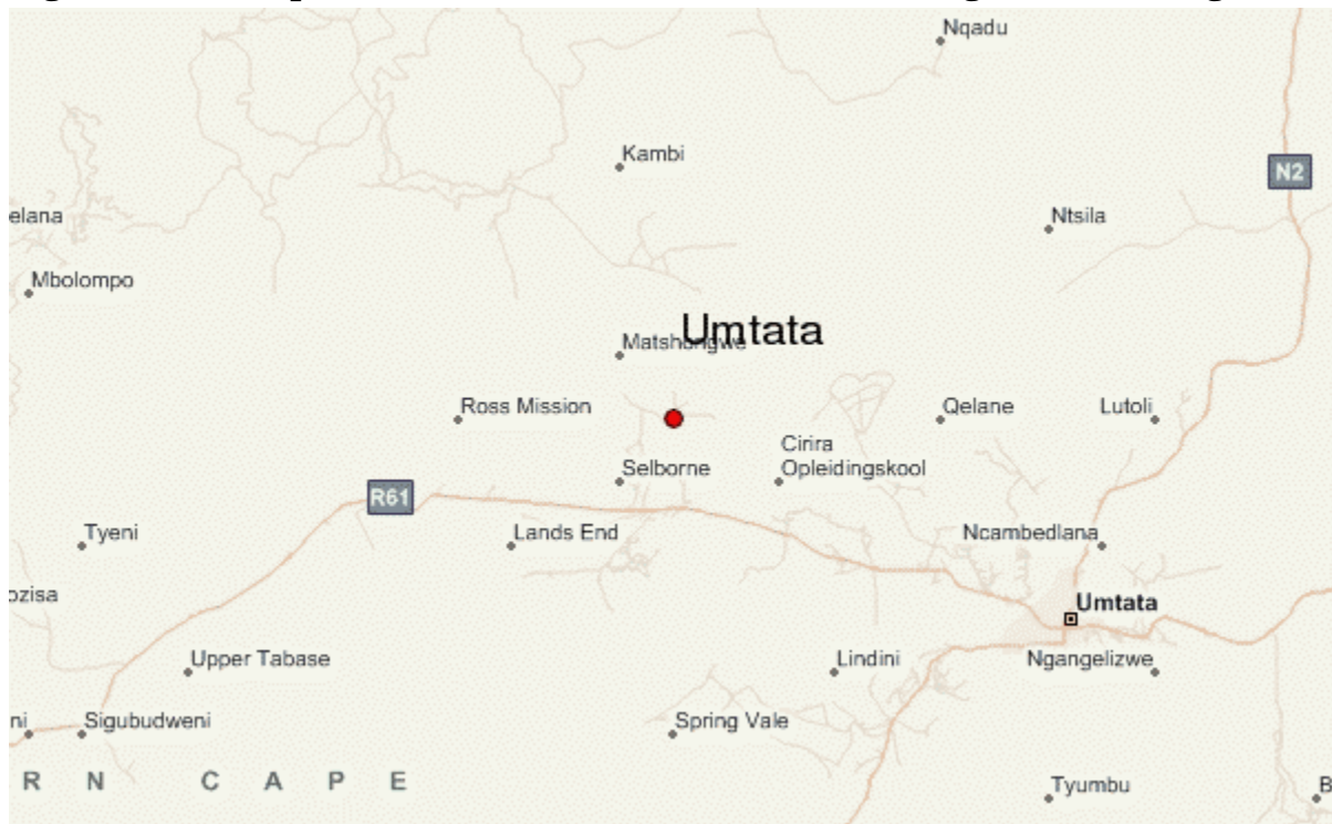
Figure 3.2.3: Simple sketch of Umtata rural areas including Khambi village