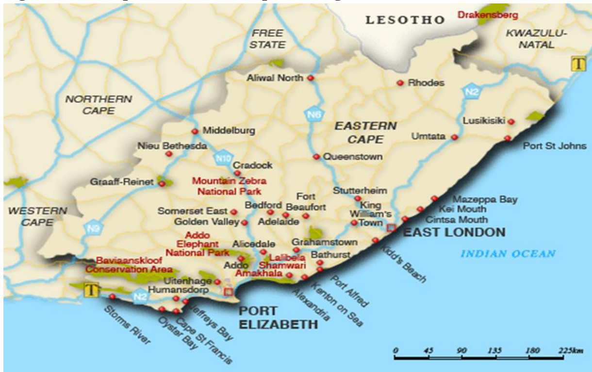
Figure 3.2.1: Map of the Eastern Cape showing Umtata