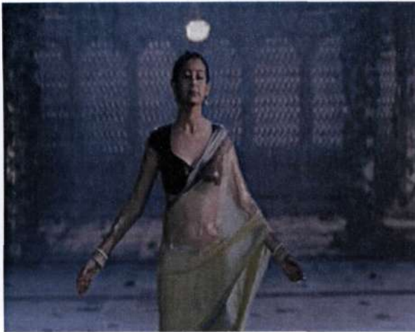
Fig. 29 Kiran's figure is exposed under a thin and wet sari.

The rain dance is sometimes a figment of the male character's imagination. The sexuality that is exuded in the song relates his desires to the audience. "These dream sequences provide the freedom to indulge in the exploration of forbidden pleasures which include the display of the female body as well as the expression of sexual desire" (Gokulsing & Dissanayake, 1988:79). More often than not, there is no link between the narrative or plot and the rain dance. It is merely a voyeuristic tool that sexualises the woman in question. "It is there, simply as an ingredient to make a film appear better to the distributors, to make the film more saleable to them, and hopefully to contribute to its eventual box office success" (Pendakur, 2003:161). It invites the stares of the male audience as well as the female audience who admire her expression of sexuality, her beautiful outfits and to some extent want to be her in that moment. Her body drenched in water exudes sexuality and heightens the experience of forbidden sexuality in the audience. She surrenders to the elements and to her lover.