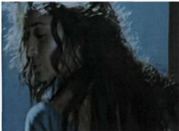
Fig. 34 Source: Aaja Nachle (2007) Dhiya dancing for the West in New York

In the case of Aaja Nachle , Dhiya is presented through the opening credits as being a dancing instructor in New York. She and her dance troupe perform an entire sequence in Dhiya's dance studio and this shows Dhiya instructing them but being the one the camera focuses on, rather than the dancers. She is a few steps in front of her troupe and every now and then, singled out by the camera. Here, we are allowed to view her talent and beauty. The fact that the dance is a western one is not entirely inconsequential – it denotes a change from the Dhiya the audience will meet when the scene changes to one of India and Dhiya's past. In this case, the western dance signifies, not a bad character, but a character that has divorced herself from India for reasons yet to be explained.