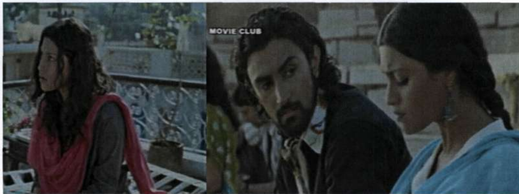
Fig.40 Source: Aaja Nachle (2007) Anokhi transforms from playful tomboy to refined woman.