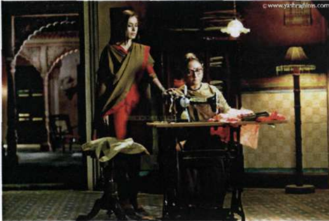
Fig. 15 Source: Laga Chunari Mein Daag (2007) Sabitri: Working to keep her family Afloat and sticking to tradition.

shown by her sticking to Hindu values, rather than helping her daughter and understanding why Vaibhavari had to turn to being a call girl.