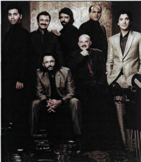
Fig. 6 Filmfare Magazine (October 2007) Cover picture: The 'Big 6' of India – An all male selection made by the industry and the public.

Theories of ideology can be used to explain aspects of life that we take for granted as being accepted as 'normal' or things that have, by some means or the other become 'normalised' (cf. Althusser, 1971). Ideology is a term that is used to describe a worldview that is held and followed by people. People can have different ideologies. For example, a scholar or Marx would have a Marxist ideology of the world, which entails action and thought that would be deemed appropriate for a Marxist. By the same token, one that has a patriarchal ideology of the world will carry out his life in that manner. Cinema, as I have discovered through reading and experience, falls under a patriarchal ideology. "The ideas of the ruling class are in every epoch the ruling ideas, since those who controlled economic production and distribution could also regulate the production and distribution of ideas" (Marx in: McLellan, 1995:12) and in the case of Bollywood, the 'ruling class' are the men who own the industry, as seen in fig. 6 (pg. 27). This is evident in the number of acclaimed male directors and producers as opposed to female ones, as well as the box office success of films by males compared to females.