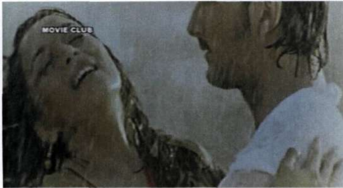
Fig. 30 She is the object of desire and in the rain she surrenders to him.

is a perfect example of how this scene constructed for the male gaze and how women are made to envy Kiran.