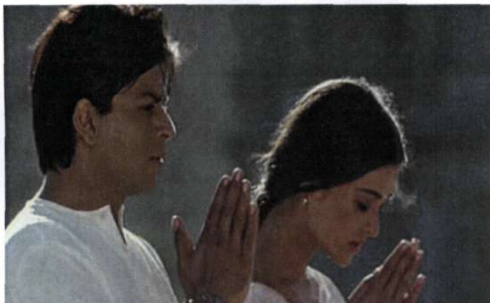
Fig. 10 Source: Mohabbatein (2000) Megha, the self-sacrificing daughter.

The fact that she is a ghost in the film shows that she is merely a vehicle for the action to take place. Her father is only changed at the end as a result of Megha's boyfriend who, guided by her ghost, is able to make Narayan Shankar see what Megha was trying to convince him of. She is depicted as virtuous, virginal and ethereal.