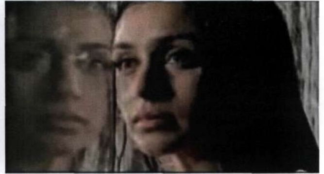
Fig. 26 Source: Laga Chunari Mein Daag (2007) She washes off her sin

The subject of widows in India is one that is generally tiptoed around and in film; the widow is generally not a young woman, but an old grandmother or mother who has children to live for. In Yash Raj Films, she is generally the woman who has lost her husband and is in need of rescuing from another male who will take her under his wing.