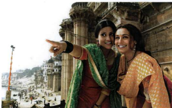
Fig. 11 Vaibhavari: The dutiful daughter.

The fact that she is a ghost in the film shows that she is merely a vehicle for the action to take place. Her father is only changed at the end as a result of Megha's boyfriend who, guided by her ghost, is able to make Narayan Shankar see what Megha was trying to convince him of. She is depicted as virtuous, virginal and ethereal.