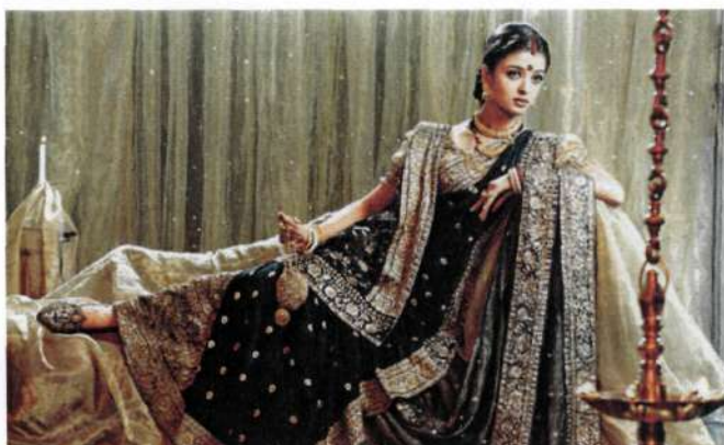
Fig. 2 Devdas (2002) Statuesque in lavish clothing: The ideal Indian woman poses.

language of a film) is what links the viewer to the screen. "Film's stylistic agency comes from its narrative strategies which claim individuals as subjects" (Humm, 1997:24). Woman in the narrative, according to Mulvey, tends to be the subject which is on display for consumption.