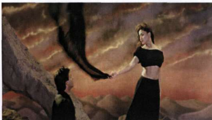
Fig. 27 Source: Dil To Pagal Hai (1997) The protagonists act out their love through a dance in their imaginations.

Imagined dances form a large part of Bollywood's dance sequence repertoire. These are spaces where the characters of the films are allowed to indulge in private fantasies which are 'not permitted' outside of the imagination. The song and dance that goes with this is generally the male protagonist's fantasy. "Songs were used to express sentiments which could not be spoken, and when dramatised in film, the body language, covered by the veil of a song, suggested a display of affection which was forbidden in public" (Skillman, 1986:138).