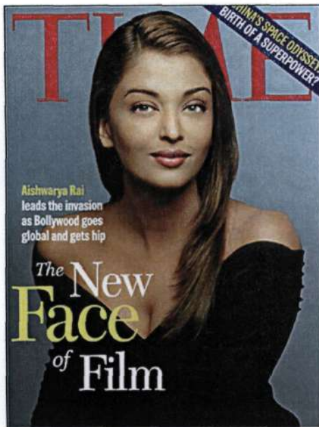
Fig. 4 Time Magazine (1998) Aishwarya Rai as a newcomer actress: Former Miss World making her breakthrough into Bollywood cinema as the new face of film

Kuhn and Mulvey's influences on the western mode of thinking about film are pivotal. However, their theories alone will not be sufficient in order to fully examine Bollywood, because their analyses are largely from a western and Hollywood perspective alone. This is why I have reviewed the following Indian writers who have examined feminism and Bollywood cinema.