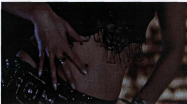
Fig. 20 Source: Mere Yaar Ki Shaadi Hai (2002) The modern day courtesan.

The modern day courtesan is far less developed and is shown for sheer visual enjoyment. This is apparent in Mere Yaar Ki Shaadi Hai , in which an unknown woman is hired to dance at a bachelor party. She is visually, and in character, vastly different from the olden day courtesan. Here, she has no name, is hired to come to a house instead of men going to her place of work, dresses in western garb and does not sing or read to her clients as the former did. She is placed on screen for the male gaze. Camera angles and close ups of her body give the male viewer as much enjoyment as possible. Her song ( Sharara meaning 'spark') tells of a woman who is so hot, that men cannot touch her without getting burned.