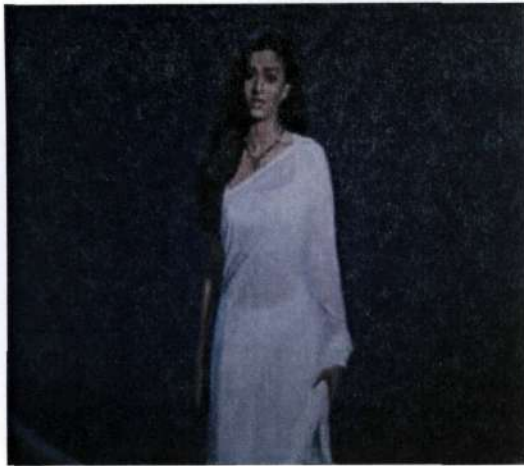
Fig. 36 Megha's figure is fully visible