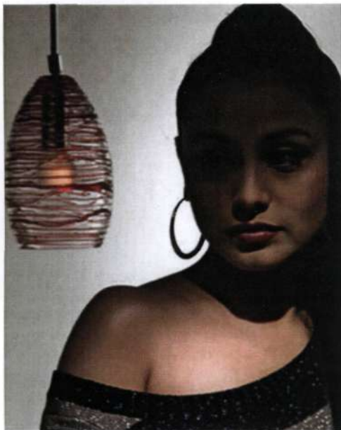
Fig. 21 Vaibhavari to Natasha: The courtesan of modern-day India.

role is more of an exclusive prostitute than courtesan, as she provides sexual pleasure to men for a fee as well as being an escort. She changes her name from Vaibhavari (a traditional Indian name) to Natasha (an Indo-Westernised name), and from a traditional village girl in traditional dress to figure-hugging black dresses and vamp-ish makeup, suggesting impurity.