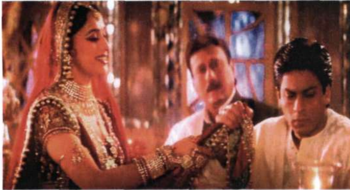
Fig. 19 Source: Devdas (2002) Chandramukhi: A classic depiction of the courtesan.

The modern day courtesan is far less developed and is shown for sheer visual enjoyment. This is apparent in Mere Yaar Ki Shaadi Hai , in which an unknown woman is hired to dance at a bachelor party. She is visually, and in character, vastly different from the olden day courtesan. Here, she has no name, is hired to come to a house instead of men going to her place of work, dresses in western garb and does not sing or read to her clients as the former did. She is placed on screen for the male gaze. Camera angles and close ups of her body give the male viewer as much enjoyment as possible. Her song ( Sharara meaning 'spark') tells of a woman who is so hot, that men cannot touch her without getting burned.