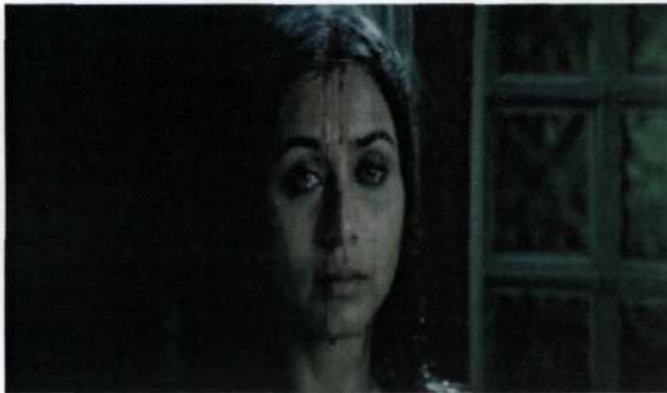
Fig. 25 Source: Baabul (2006) She washes out her sindoor.

identity. In Laga Chunari Mein Daag , Vaibhavari steps into the shower after her first night as a call girl, washing away her sin and cleansing herself. It is also, to an extent, symbolic of her washing away her identity as Vaibhavari and assuming the identity of Natasha. I find this interesting because in both these films, the imagery is almost identical and the symbolism likens the widow to the prostitute. In the past, and even now, albeit on a smaller level than historically, younger widows became prostitutes so as to survive. They were pimped by hijras 41 who sold them to wealthy men.