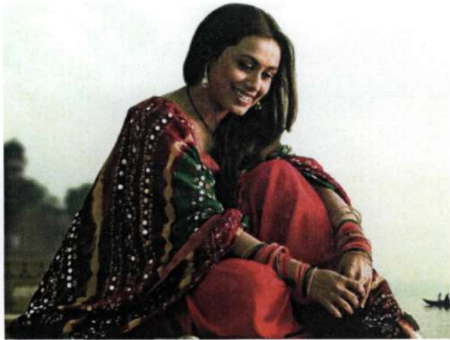
Fig. 38 Laga Chunari Mein Daag (2007) Vaibhavari is innocent and carefree here in her Indian garb.

However, in Mujhse Dosti Karoge! Tina's appearance in salwaar khameez is one that makes the viewer notice her body as well as traditionality. She meets Raj and when she gets his attention with her beauty, she changes into traditional dress to show that not only is she beautiful, she is an honourable Hindu woman as well. In this scene, as shown below, she practically models into the room and stands next to him, her almost see through salwaar khameez showing the outlines of her midriff and cleavage. The veil is placed as a scarf would be and billows behind her as she walks, accentuating her long, thick black hair, which is seen as a positive feature in Indian women.