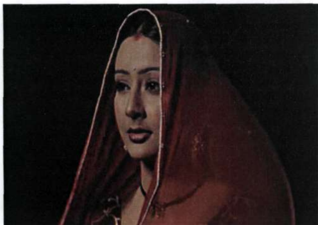
Fig. 12 Kiran as the dutiful wife, head covered and waiting for her husband's return from the army.

Dancing is seen as a lavish form of showing off the body and this is not acceptable for a married woman.