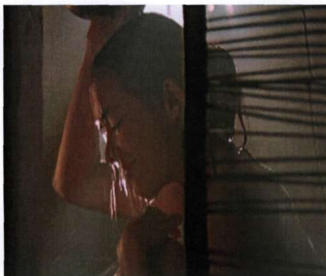
Fig. 3 The camera watching Lakshmi have a bath: The height of the male gaze.

being looked at (Berger, 1972) but men looking at women as well as women looking at women. For Mulvey, the act of looking takes the form of voyeurism and is sometimes narcissistic in that one looks at representations of the human body; women also enjoy the image by either identifying with it and, in turn, wanting to be the image (liking being looked at) or adopting a masculine subject position of voyeur and enjoying the image for objectification of the 'other'. Hence, the woman on screen is a form of spectacle for both male and female viewers. As shown in fig. 3 (below), scenes that are not always related to the narrative of the film turn the heroine into a spectacle for men via sexually charged images. This, as Kuhn (1994) argues, is true in Hollywood and can be applied to Bollywood.