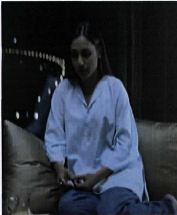
Fig. 24 Source: Hum Tum (2004) As a widow, Rhea is demure and quiet.

In Hum Tum , Rhea (Rani Mukherjee) is a widow who escapes the scourge of traditional widowhood by running away to France, where she and her mother live, cut off from all ties to India; her reasons being that she did not want to be pitied, cast aside or remarried for the sake of not being alone. She is depicted as a strong woman who has full control of her life, but incomplete and constantly crying, until Karan (Saif Ali Khan) comes into her life and fills her life with love and laughter again. She is never depicted as the traditional widow: she does not wear Indian clothing at all, in fact and this is symbolic of the overriding ideology in India – widows are either traditional, kept women, or westernised and remarry.