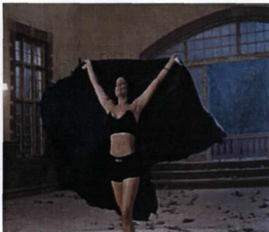
Fig. 17 Source: Mohabbatein (2000) Ishika: Dances to lure her catch.

This portrayal of her character places her in a box of being "self-centred, conniving and evil" (Ramlutchman, 2006:50). She is set in juxtaposition to the heroine. As a result of being a vamp, her love for the hero goes unrequited. "The vamp is almost always punished for her 'unacceptable behaviour'" (Gokulsing & Dissanayake, 1998:77). This kind of resolution and the portrayal of the vamp show how Bollywood continually, as Ramlutchman (2006:50) suggests, "reverts to traditional representations" of women as being one-dimensional and existing only in the binary of good/bad. Nisha is the type of vamp which existed in the 90's, which today can be seen as more of an anti-heroine than vamp, because she is far more toned down in terms of her 'vampishness'. Nowadays, vamps can be seen as being far more negative.