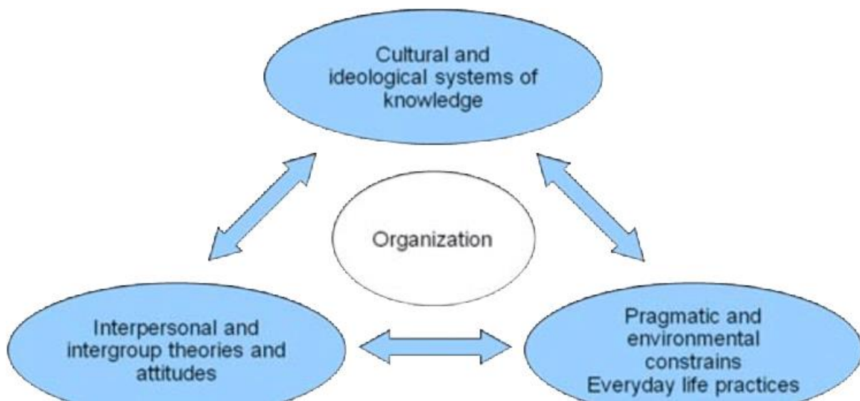
Diagram 1: The Social Construction of Reality: A schematic diagram representing Social Constructionism Theory by Berger and Luckmann.

(Source: Adapted from Berger and Luckmann, 1966)