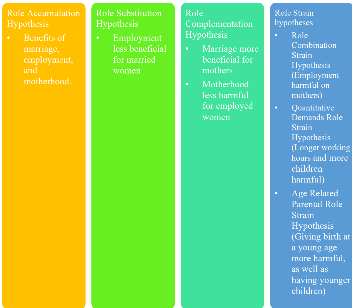
Figure 1: Role hypotheses (Waldron et al. 1998)