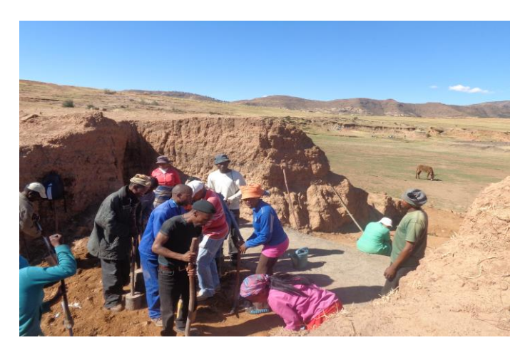
Figure 7: Some of the MSG members taking part in dam reconstruction in Roma

Another example of commitment to citizenship responsibility was shown by the LESCO group while they were in Tsikoane, Leribe, where they joined villagers who were working on a road construction. This group also felt they were 'giving back' to the community and adhering to the African philosophy of co-existence, which Cobbah (1987:320) sums up as: "I am because we are, and because we are therefore I am." A similar example was seen whereby four MSG group members worked with casual labourers who were working towards reviving an irrigation dam.