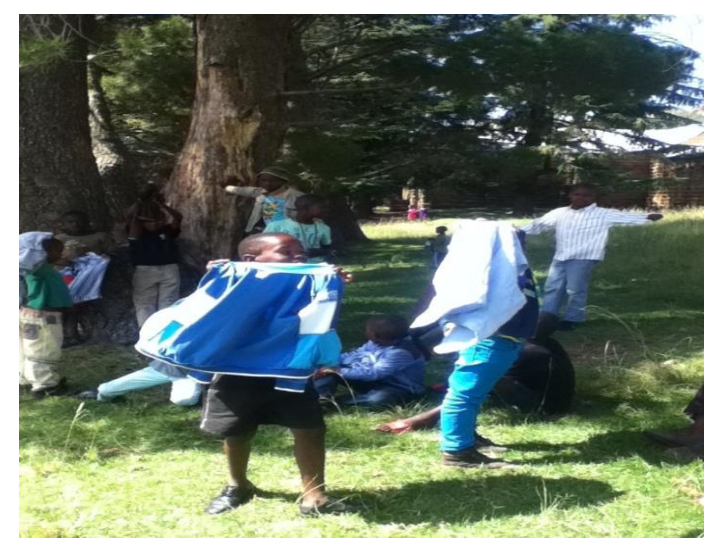
Figure 6: Excited children fitting and showing off the clothes they received

Here our beloved friends were already fitting themselves \dots they were so happy \dots they were even proudly showing each other what they have received. (1F)