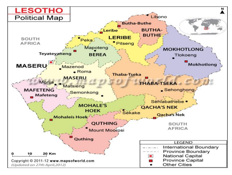
Figure 1: Political map of Lesotho

Lesotho is a small mountainous country of 30,350 km<sup>2</sup>, which is landlocked by the Republic of South Africa. Its population is estimated at 2.06 million people, of which 75% live in the rural areas and are poor (World Population Review 2016). It is a constitutional monarchy with a parliamentary democracy which has held elections since 1998. It has ten districts, namely Berea, Butha-Buthe, Leribe, Mafeteng, Maseru, Mohale's Hoek, Mokhotlong, Qacha's Nek, Quthing and Thaba-Tseka.