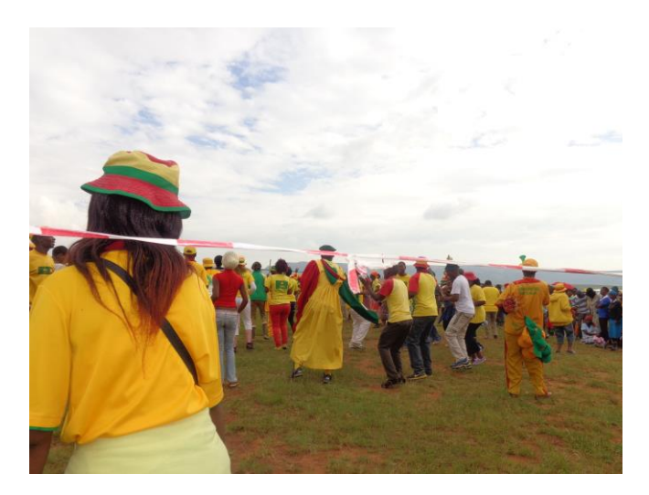
Figure 9: ABC youth at a political rally

It is true that we enjoy ourselves through party songs, but as young people in the party, our leader also motivated us that we should be change agents in our communities by ensuring that there is development amongst us as young people.