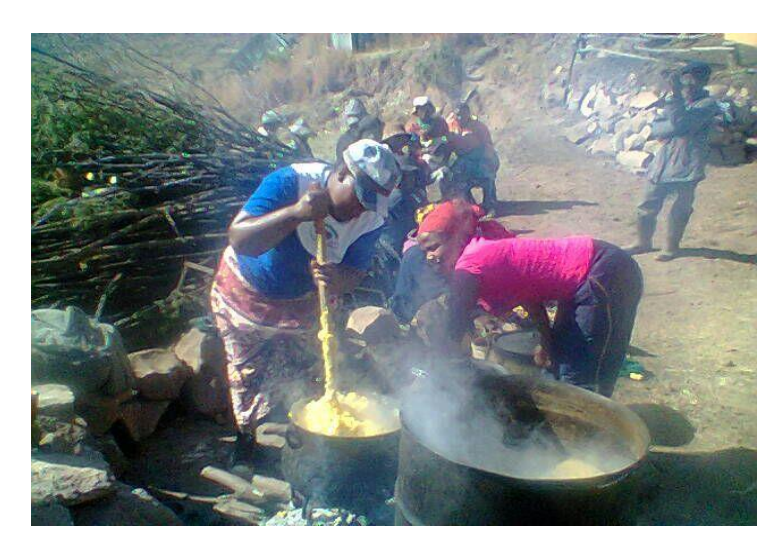
Figure 3: LCYM members at a family funeral of one of their members

A colleague in the same group, Nkau, explained that they also helped with cutting wood that would be used during the funeral.