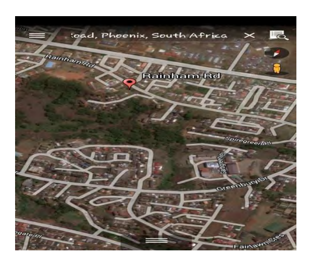
Figure 2: Location of Charville Primary School

The research site is located in Phoenix township north-west of Durban in KwaZulu-Natal, South Africa. The late Mahatma Ghandi established the Phoenix Settlement in 1904 as a communal experimental farm to promote his principles of Satyagraha (passive resistance). The township was established by the apartheid regime in 1976and houses mainly middle-class Indians. Its population currently stands at 176,989. As Indian people make up the majority of the population, English is the first language in the area and within all schools (see chapter 3 for a detailed description of the research site).