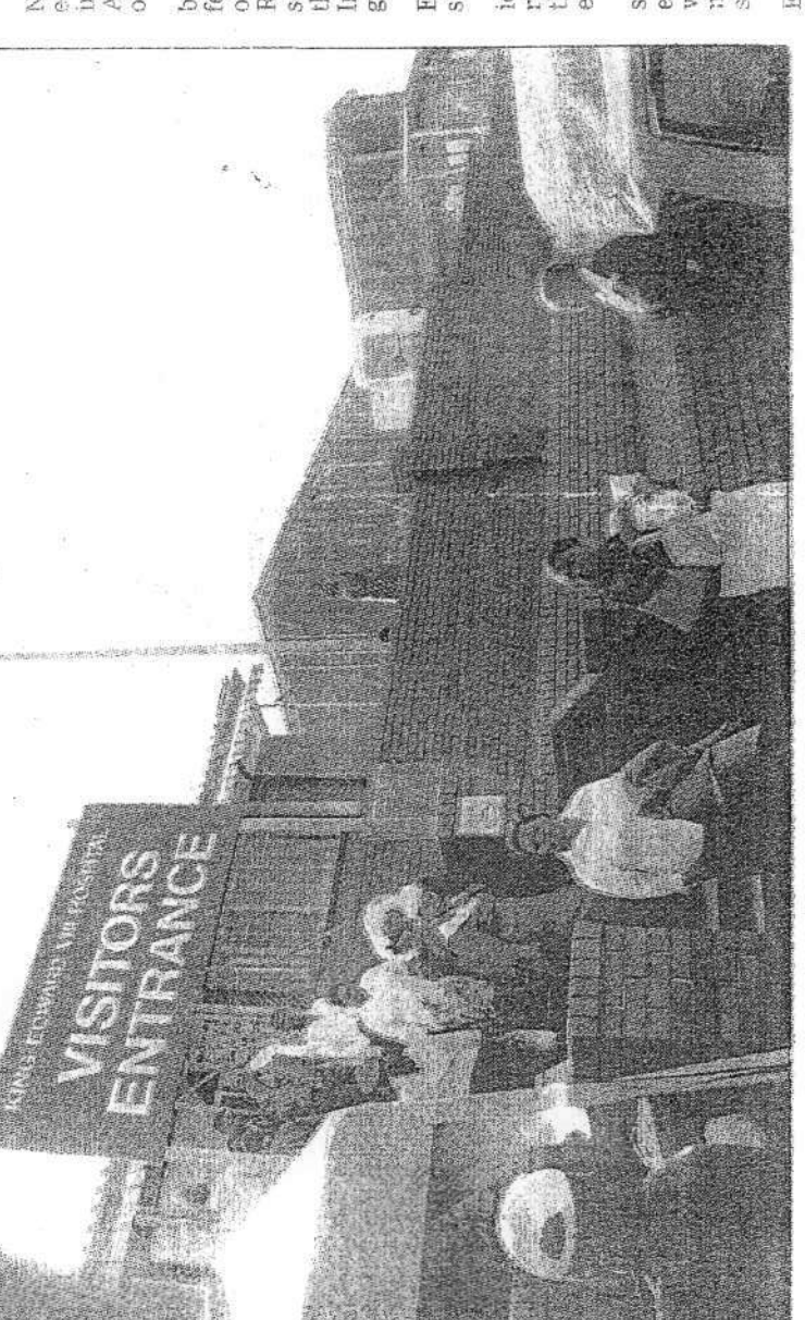
EPIDEMIC... Outpatients and visitors leave King Edward VIII hospital in Durban. A leading HIV/AIDS expert this week said 90 percent of people attended to at the hospital are HIV-positive PIDEMIC

it was featured recently on it the distribution of anti-retrovir drugs and assisting those infecti AIDS infections, has preved to BBC website for its successes an immense success. with the disease