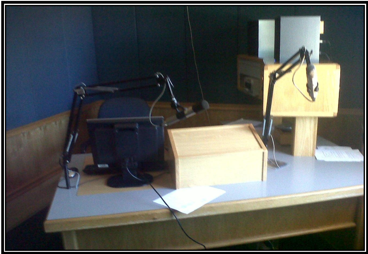
Figure 4: Studio 2 of X-K FM. This studio is mainly used by the radio producers to edit and sometimes translate content for broadcasting

2003 to its current location. It is now housed in a building provided by the SABC that accommodates both the studio and offices of the station (Sokutu, 2000; Hart, 2006).