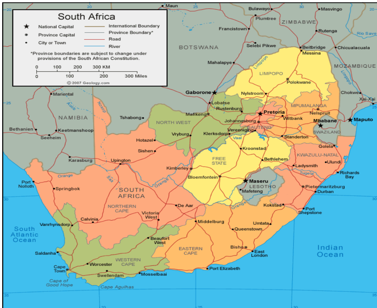
Figure 1 Map of South Africa indicating different geographic areas including Kimberley (the nearest town to Platfontein)

The maps presented in this page depict the macro as well as micro positions of the study location. Platfontein is located in the Northern Cape Province of the Republic of South Africa.