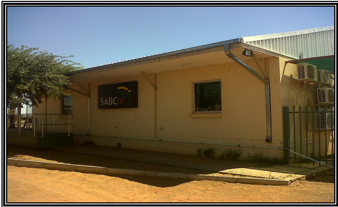
Figure 3: the side view of the building housing X-K FM in Platfontein

most developed area of the settlement. In the centre of the township there is a School (that is both a Primary and a High School), a Community Clinic, a Community Centre (that has a social worker office and electricity purchasing outlet), a Beer Hall and the South African San Institute (SASI) offices. Most importantly in this township square; situated right at the centre of Platfontein, stands the subject matter of this study; X-K FM: