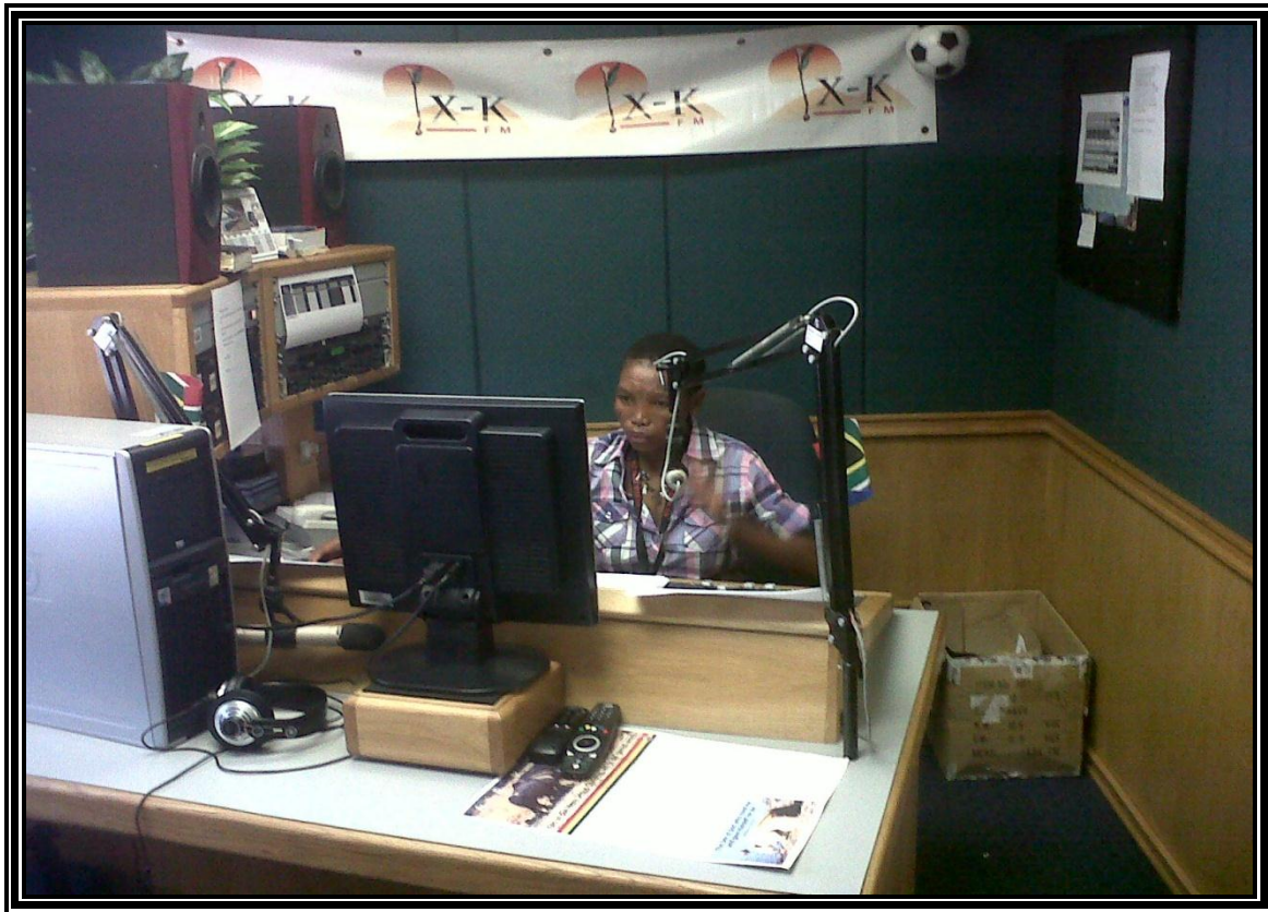
Figure 5: An X-K FM radio presenter monitoring a pre-recorded programme during transmission

The programming schedule of X-K FM indicates an existence of health communication (See Appendix D). For this study, the practice of beneficiary community participation in HIV/AIDS at Platfontein has been assessed in connection with these programmes as well as communities' views on the station's role in HIV/AIDS communication. According to Open Africa (2012) "X-K FM is more than just a radio station; it serves as a medium of basic communication in Platfontein. This fact is prevalent when one hears the announcer addressing individuals who are late for doctor's appointments or Community Property Association meetings." 6 The role of beneficiary community participation in HIV/AIDS communication at this station is discussed in Chapter 6.