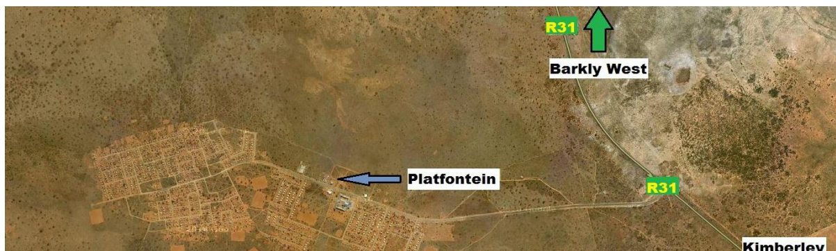
Figure 2: A map indicating the location of Platfontein.