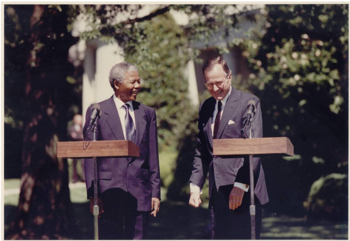
Image 3: Nelson Mandela and President George Bush (Snr.) on the White House Lawns during Mandela's 1990 visit. 69

shake hands.” 68 Perhaps an interview with Mr. Mandela today, 18 years after that meeting, might not yield a similar response.