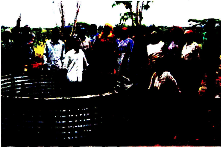
Building a Water tank through Harambee.