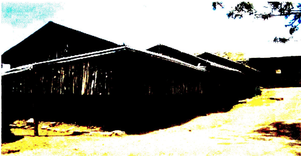
Water harvesting project initiated through Harambee by women of the Anglican Diocese of Kirinyaga.

SSIWH programme has been providing advice and assistance to groups and individuals wishing to embark on small-scale irrigation, water management and its conservation to groups seeking water for domestic use as we can see in the pictures. The water for agricultural and livestock development has improved the lifestyles of some poor families and due to the availability of water in schools, cattle dips, and in the farms the employment opportunities are also created thus empowering the poor.