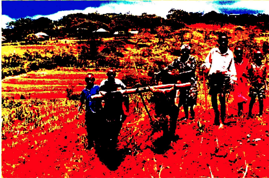
The Family Harambee: the woman with her children cultivates their sorghum farm in Gacharu, Ndia Division, Kirinyaga District, Central Province, Kenya.

Interesting, these communities see land as not only an economic aspect but also as one which carries socio-religious value. Mbiti (1971:92) observes that every community has a myth which explains how God gave the land to their ancestors to own and till. For instance, in my community land is seen as a unifying factor among the descendants, the family, the clans and the communities. This agrees with the Israelites understanding of Yahweh as one who had given them the land as it was promised to Abraham and their stay in the land depends on their relationship with him. However, in my community to be human is understood as having land. For a man to get a wife, he is required to have a piece of land and some cows for dowry. It is believed that for a wife to feed her family she would require a piece of land and the milk from a cow. In the same way the cows would need land to feed on grass. Therefore land, man, woman and cow are interrelated for it is perceived as impossible to have a livelihood without land and cows. The picture above shows this. In fact the cattle, land and human beings are interrelated in Harambee .