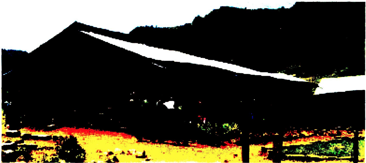
The first school building constructed through community Harambee .

The school pictured below was the poorest school in my home district. The school was started by the local community through local Harambee and the mud classrooms were built within a month. After some years these classrooms were rapidly collapsing. Again the light which came through the windows was not enough thus making the reading extremely difficult. However, through Harambee the Anglican Church was able to mobilise the community and this school was completely rebuilt. In addition to that the church was able to put up a new stone water tank for water so as to harvest the roof water which is clean and used for drinking.