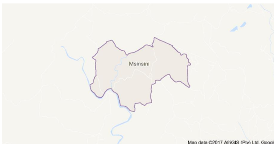
Figure 2: Location of Msinsini Policing area

Umbilo is one of the areas where the study took place. Umbilo police station is situated where it forms part of Ward 33 with areas such as Glenwood and Congela. Umbilo is more mixed in terms of ethnic groups than Glenwood but most people in this area are whites.