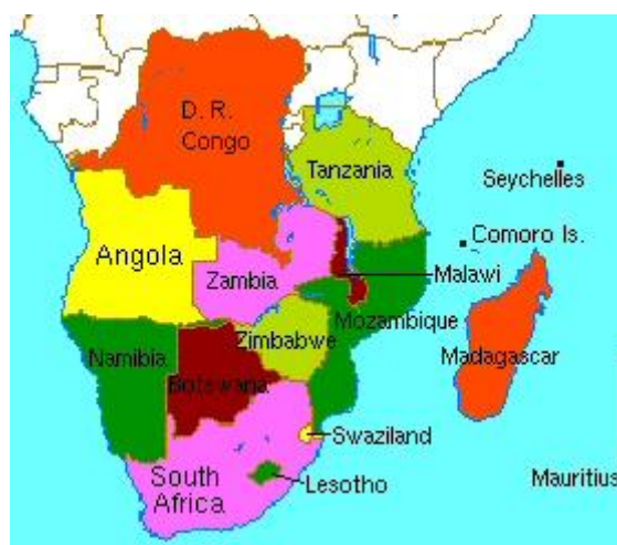
Fig 4.1 Map of SADC Member States