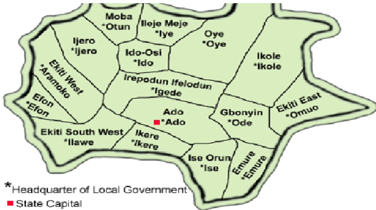
Figure 4.2: Showing the Map of Ekiti State