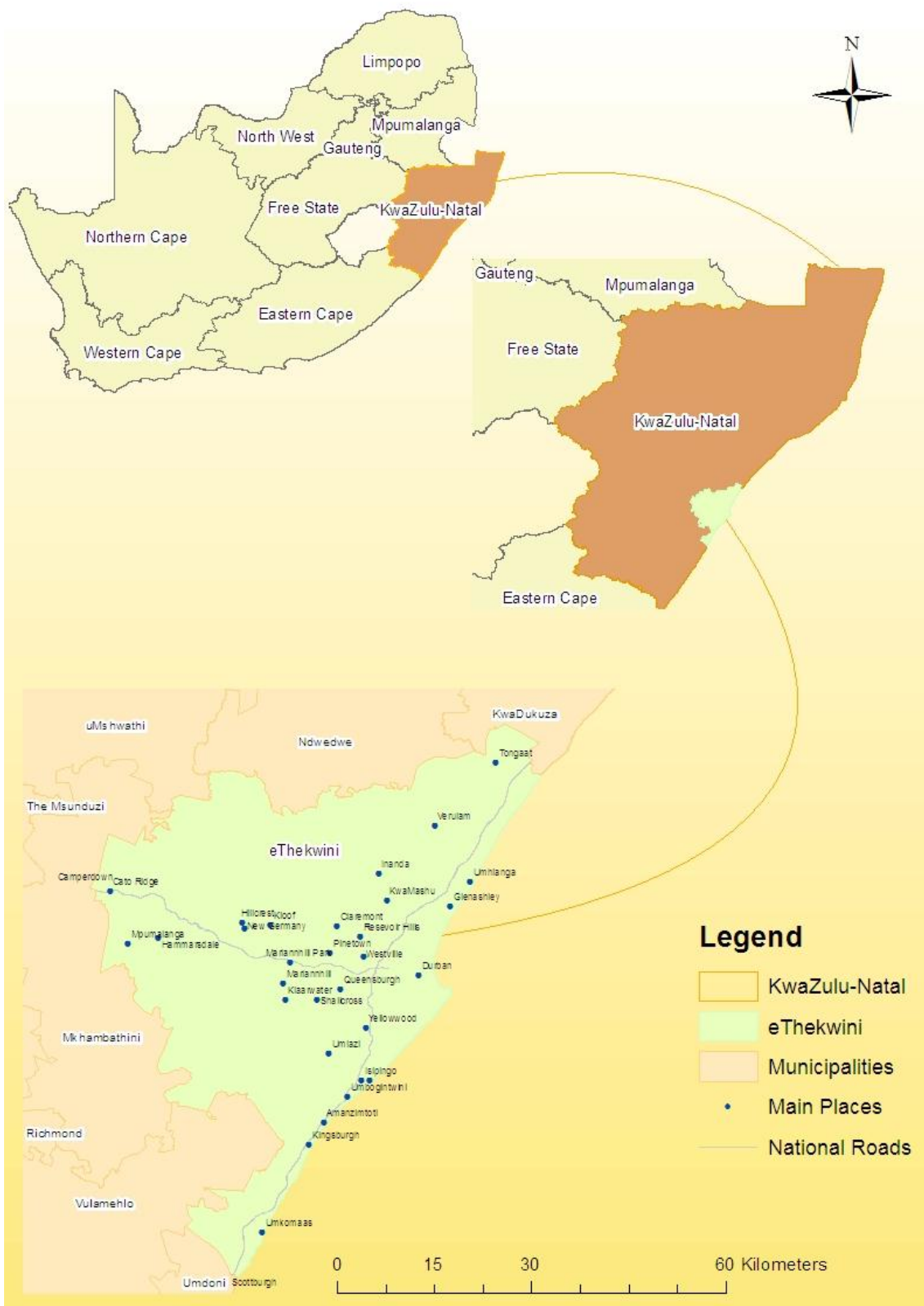
Figure 1. 1: The eThekweni Municipality