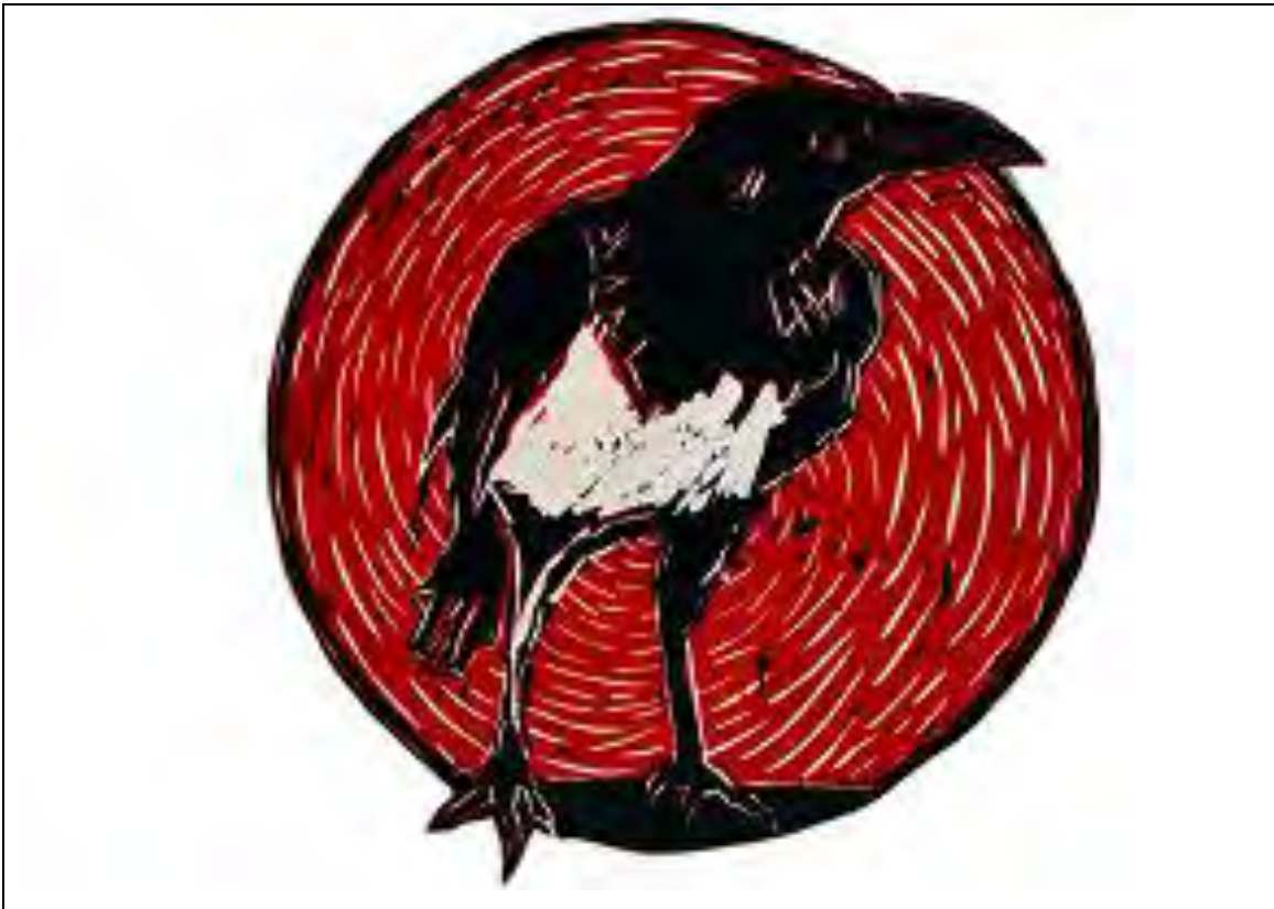
Plate 15. Faye Spencer. Untitled . 2016. Ozric image from novella illustration. Approx. diameter 10 cm.

Another figure that differs in the book and in the exhibited prints is that of the crow, the first illustration in the story (Plate 15). The crow is depicted on the cover of the book, and is also the first image in it. The standing crow appears in the same pose but as a less complexly wrought two-layer relief print in the exhibited prints (see Plates 16 and 17 over the page).