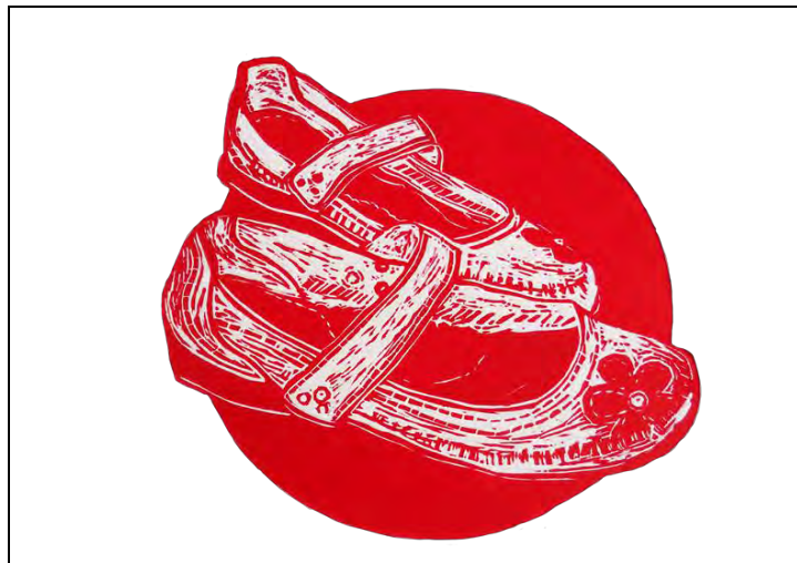
Plate 10. Faye Spencer. Untitled . 2016. Shoe detail as printed in novella. Approx. diameter 11 cm