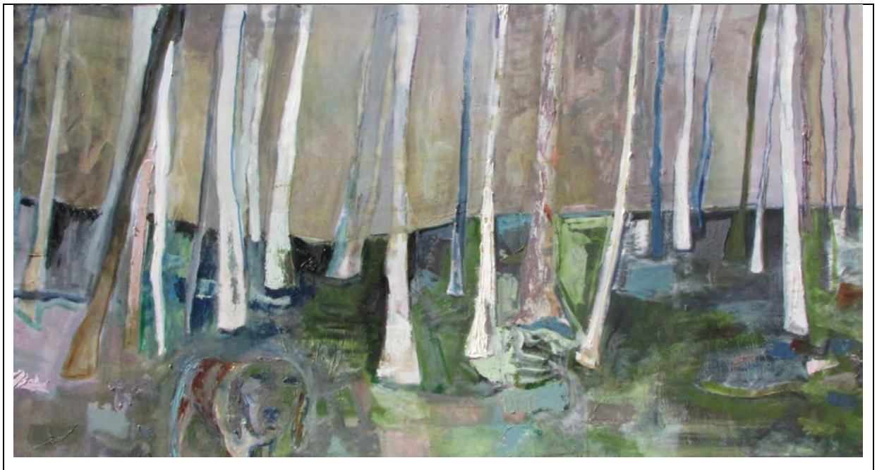
Plate 1. Faye Spencer. Lost: No Guidebook . 2012. Mixed media on board. 100 x 200 cm.

The dislocation between each fragment of sky and the fracturing of the ground plane by the tree trunks create a physical environment akin to the bewildering chaos of a liquid state. Aside from referring to liquid modernity, the fractured space talks simultaneously of personal anxieties, dislocation and the feeling of isolation that inevitably accompanies changes in departmental size and leadership structures. Yet, it is not in this specificity that the value of the work lies but in the way that it makes use of metaphor and, in turn, in the way that metaphor speaks of much broader prevalent concerns of current experience.