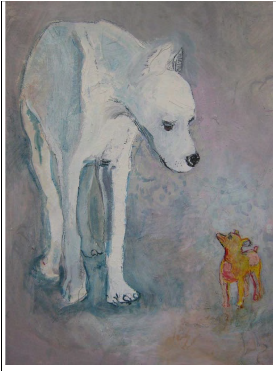
Plate 2. Faye Spencer. Ability Confronts Duty . 2012. Mixed media on canvas. 120 x 100 cm.

The bewildering array of possibilities and pitfalls afforded by the collapse of certainty leads to a state of inertia. This, in my experience, is a state akin to muteness or a loss of language. It is like having a mechanism (voice) without the opportunity or ability to speak. This loss of power disarms and frustrates. The pervasiveness of this state compels me to try and speak about it through my creative practice and, thus, it features with