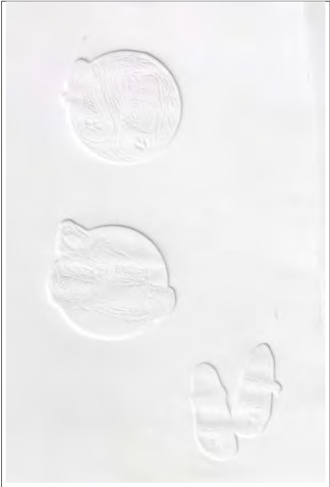
Plate 11. Faye Spencer. And then there were None . 2013. Embossing on Fabriano. 80 x 60 cm.