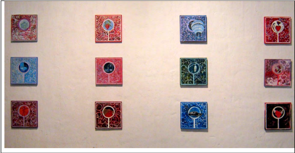
Plate 20. Faye Spencer. Smaller Wish List Series . 2009. Gallery view at ArtSPACE Durban. oil on board. Panels 25 x 25cm.

In each of the Smaller Wish List Series the circular window through which the images are observed is surrounded by a decorative painted frame. As noted at the time of their first public display “the frame is repeated with slight – and occasionally dramatic – adjustments”. At times the frame is decorated with “abundant lush forests of jewel-like leaves, at other times the painted frame disintegrates into a violent swathe of brush-marks” (Artist’s Statement, Spencer 2009). The painted frame was inspired originally by a filigreed, intricate, metal frame housing a wedding photograph, and also alludes to trompe l’oeil frames often found in 17 th century Flemish memento mori painting, thereby reiterating the idea that the painted object is an illusion (thus elusive, not real, but desired) and emphasising “our mortality and death’s relationship to life” (Conterio 2016). The memento mori thematic (originating in antiquity) speaks to the idea that life is transitory, and is a reminder of the inevitability of death and the fleeting nature of experience. As my artist’s statement noted, “the portal and its enclosing frame point to the idea that the vision contained therein is both special (reverential/symbolic) and extracted from a private realm of experience” (2009).