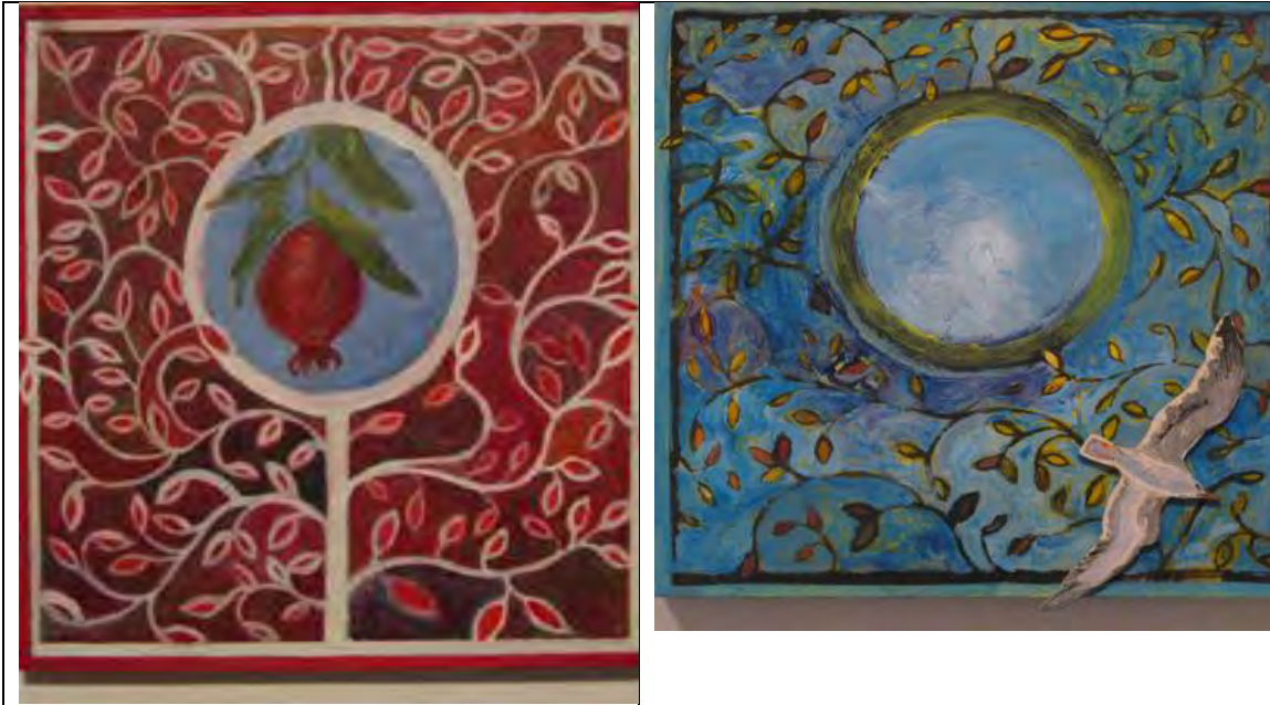
Plate 18. Faye Spencer. Progeny . 2009. Oil on board. 25 x 25 cm. Plate 19. Faye Spencer. Flight . 2009. Oil on board. 25 x 25 cm.

unsatisfied and embarrassed. I persevered with the series after rejecting many of the early images. I was somewhat more satisfied with the imagery in the smaller panels, where I used metaphor to speak of the loss I was trying to describe, an example of this work being Progeny (2009/10), comprising an immature pomegranate, pictured below. A further example, also pictured, is Flight (2009/10). After some months I had produced the 18 small panels and five larger ones which comprised the initial series.