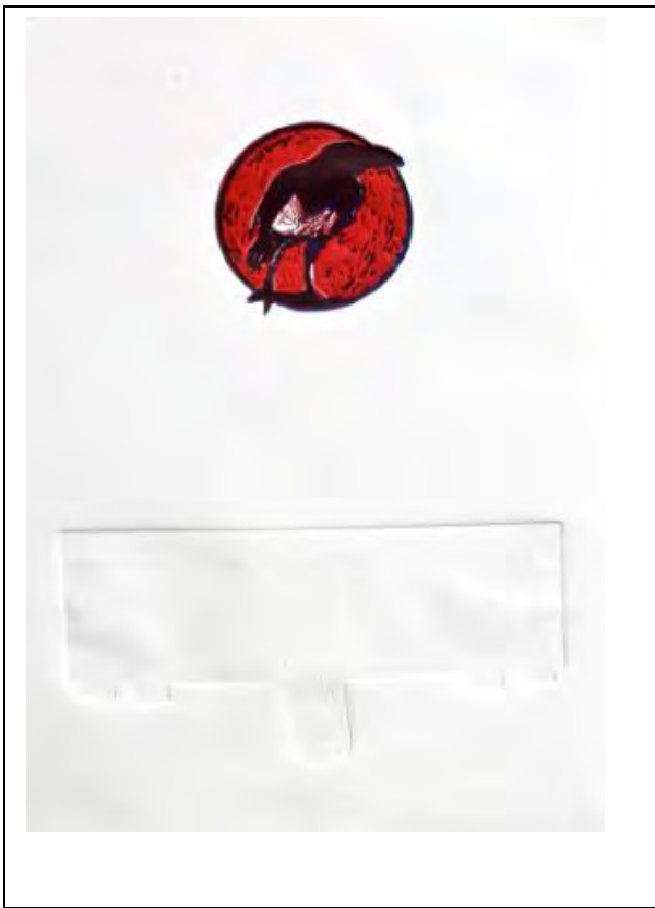
Plate 16. Faye Spencer. Ozric's Tale . 2013. Linocut, embossing on Fabriano. 80 x 60 cm.