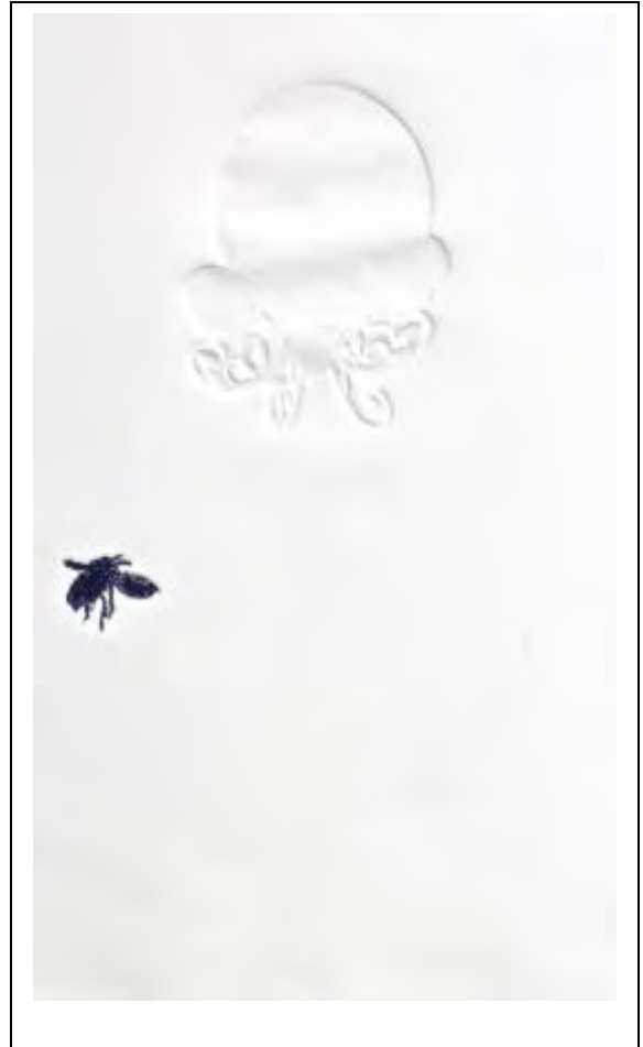
Plate 14. Faye Spencer. Light . 2013. Linocut and embossing on Fabriano. 80 x 60 cm.

Alternately the bee could itself be facing death by flying into the light as insects are prone to do. I think that playing with these rather literal images derived from the story to speak in a more open way about themes of death, danger and loss is an important way for me to extend the dialogue about grief. It can also be read as a punning, rather silly take, on the euphemistic idea of dying as entering the light .