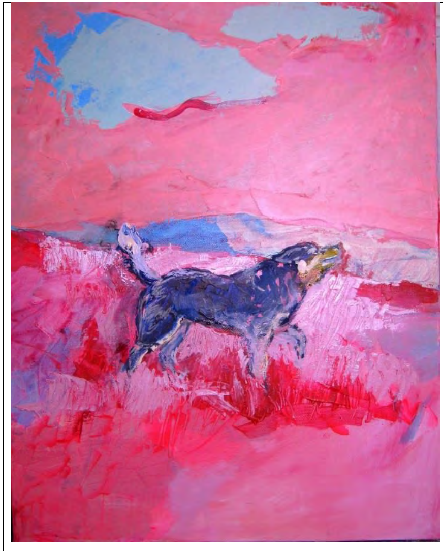
Plate 6. Faye Spencer. Early Retirement . 2012. Mixed media on canvas. 51 x 41 cm.

Thus, while works in the series point to serious and often distressing conundrums faced under postmodernity (powerlessness, imbalance, inertia), the series also, through its call to levity and through the use of metaphor and of the imagination, points to something else, much less dark: to the possibility of feeling differently, to the possibility of upliftment. For, as Critchley summarises, humour can function to “produce new perceptions of the surrounding world, as well as of oneself” (9-11). Humour “renders the ordinary extraordinary”, it “defamiliarises the familiar”, creating a “distance to the immediacy of things (including oneself)” and allows us to consider an environment or situation in which alternate possibilities, other possible relationships, can exist (9-11).