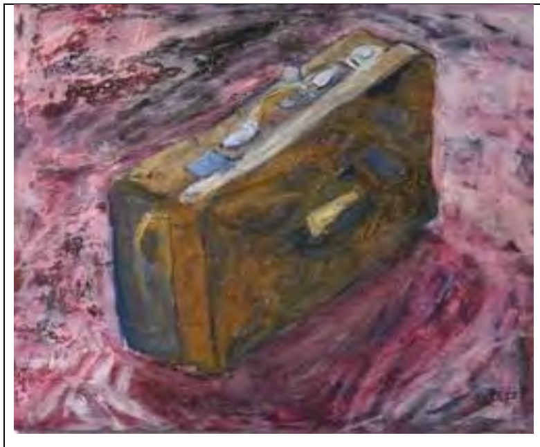
Plate 21. Faye Spencer. Safe Passage . 2009/10. Oil, mixed media on board. 60 x 60 cm.

symbols and as actual objects of personal value. In my writing about the work at the time for the very first exhibition of these works I emphasised that “the suitcase, for example, in Safe Passage II references both literal travel as well as trespass into otherworldly domains”; this makes it both “an object travelling from the past (belonging to relatives long deceased) and a reference to the present (a signal of change/flux) and portent of the future wherein a body moves from this realm into the next” (2009). I go on to observe it is a container – “a vessel that hides or protects something”, something that “has multiple references, and can be seen to speak both positively (of being transported, of travel or elevation) and negatively (of loss and dislocation), referencing relationships severed by mortality and/or physical distance” (2009).