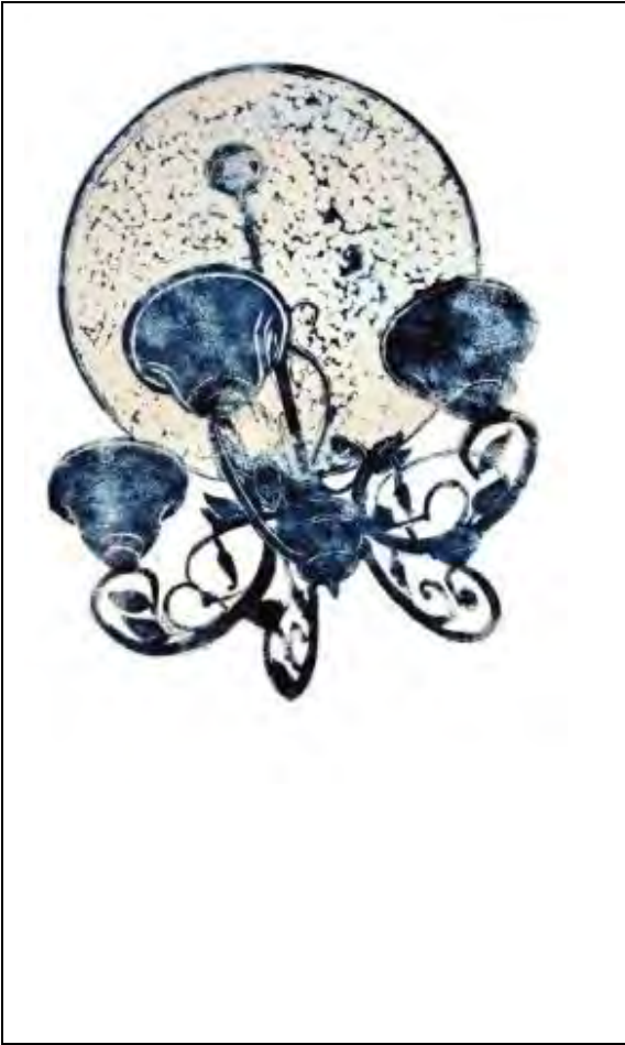
Plate 13. Faye Spencer. Untitled . 2016. Novella illustration. 15 x 14 cm.