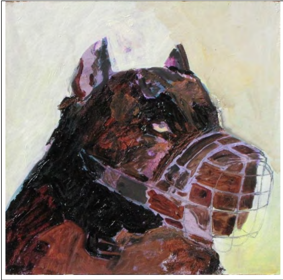
Plate 3. Faye Spencer. 2012. His Tiny Eye . Oil, charcoal on board. 61 x 61 cm (detail).

frequency, in particular in the Office Politics Series , serving, for example, as the starting point for His Tiny Eye (2012), Plate 3, pictured below.