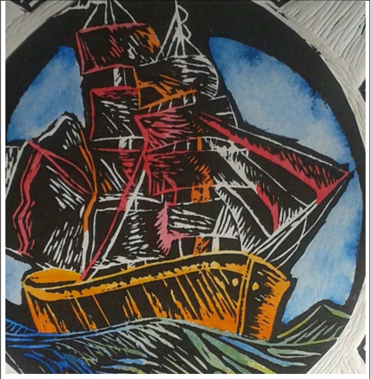
Plate 26. Jade Taylor. Untitled. Wish List Project. 2015. Linocut, hand-colouring on Fabriano. Diameter inset 15 cm.

Likewise, the turtle imaged in the print pictured on the following page, Plate 27, can refer to any one of the following ideas: the tranquillity of swimming in the ocean, a wish for people to conserve an endangered species, a wish for a safe haven (alluded to by the shell).