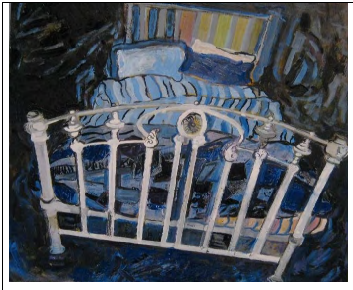
Plate 22. Faye Spencer. Rest . 2009/10. Oil, mixed media on board. 60 x 60 cm.

Like Safe Passage , the majority of works in the larger series allowed an open reading through the use of symbol – images which could be read in a number of ways. The telephone in the painting Ring-Ring (2009/10), not pictured here, could refer positively to communication or speak to its opposite, alluding to a loss of dialogue and to distance and absence. The desire for communication (and the difficulty of achieving it) features widely as a theme in these larger works. The urgency with which this loss is felt is emphasised by the rough brushwork in these works, and by the crude, heavy impasto and patches of ragged sgraffito exemplified by Plate 21, Rest (2009/10), which was the final work, in the larger series of paintings out of which the print project subsequently arose.