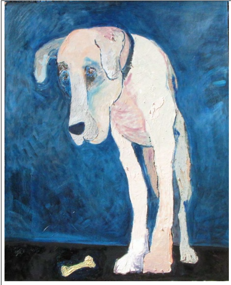
Plate 4. Faye Spencer. Incentive Reward? 2012-14. Mixed media on board. 100 x 80 cm.

something that surely serves to provoke or tease the recipient, rather than serving as a reward