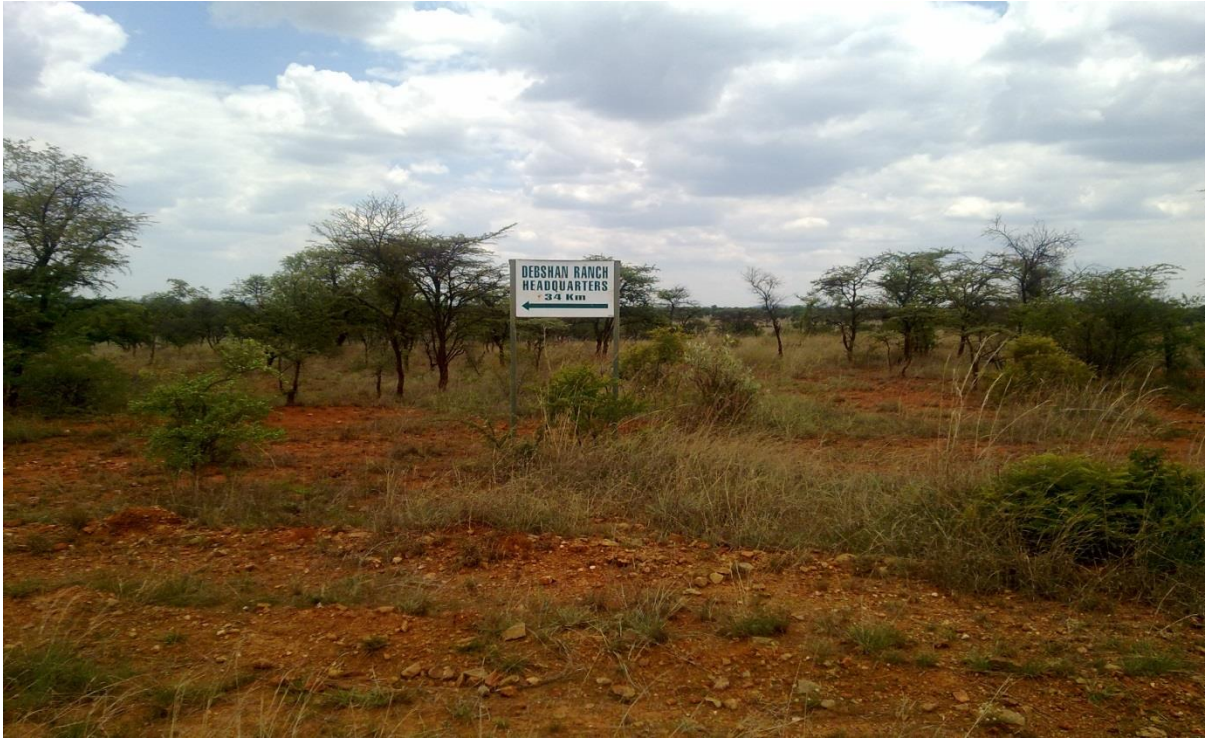
Figures 4.1 and 4.2 Shangani ranch in picture