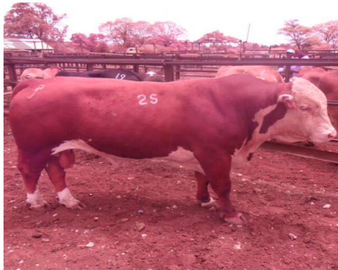
Figure 4.3 A crossbred bull owned by De Beers

The farming practices and land use remained the same even though new strategies were implemented so as to maintain the agricultural productivity rates. Cattle ranching was improved by bringing in new breeds which were cross-bred so as to produce strong and resistant breeds, which paid well at the markets. Breeds like the Simentawa, Brahman etc. were introduced and some breeds were imported from various parts of the world. Genetic breeding of cattle was introduced and was done by the most qualified veterinary experts. Genetic breeding is a good strategy as it managed to create and breed even much stronger breeds that are resistant to any form of local infection or disease. By mixing breeds, De Beers and his neighbour Mr J R Goddard are arguably the best breeders of cattle in the region. These two white farmers continue to supply both local and international markets with quality cattle for beef and milk (Interview, 15/12/13).