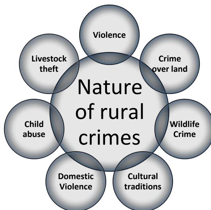
Figure 2.2 Crimes common in rural areas

Figure 2.2 shows the nature of crimes observed in rural areas. These are discussed individually below.