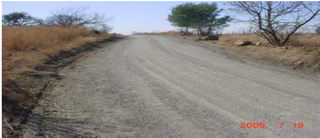
Photo 10 Upgrading and maintenance of Rocky Drift main road.

of District Road D 586 at Rocky Drift. Photo 10 shows the improved main road at Rocky Drift.