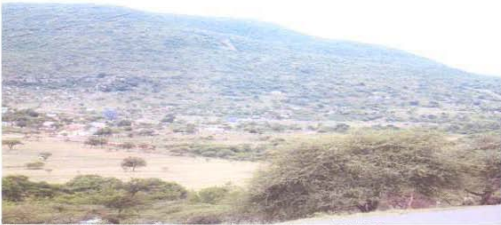
Photo 1 Rocky Drift settlements