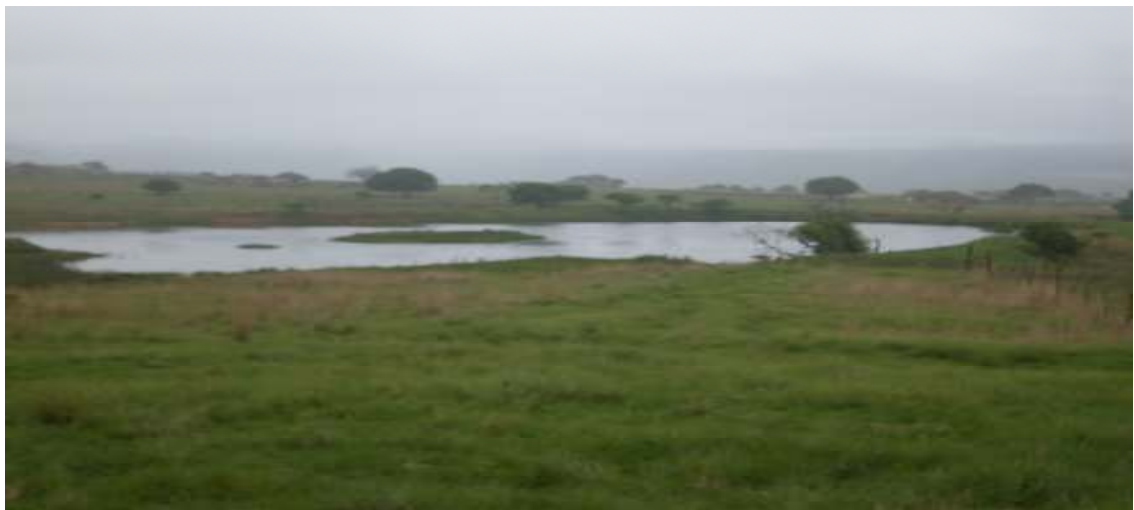
Photo 5 Dam as a source of water.

One can then safely conclude that the lives of the beneficiaries have been slightly improved in terms of the provision of water. This service can only be improved through proper communication with the community leaders, which appears to be missing because the Senior Headman denied that there was any water project in the area. However, it appeared during the interview with the UDM officials and the Rocky Drift Councilors that water project is progress at Rocky Drift.