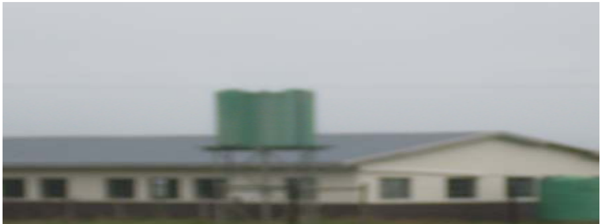
Photo 9 Eyethu Primary school funded by private sector in partnership with the local residents.

It was apparent that the residents had high hopes, trust and faith in the new government and hence expected drastic changes in their lives. Unfortunately some of their high expectations have not been met and they were therefore not clear about the intention of this research, despite this being clearly explained to them in the researcher's introduction, which was also supported by a declaration form and consent letter from the University.