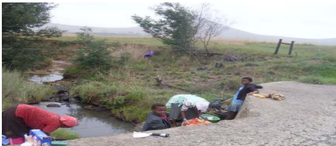
Photo 6 Rocky Drift residents washing in the river.