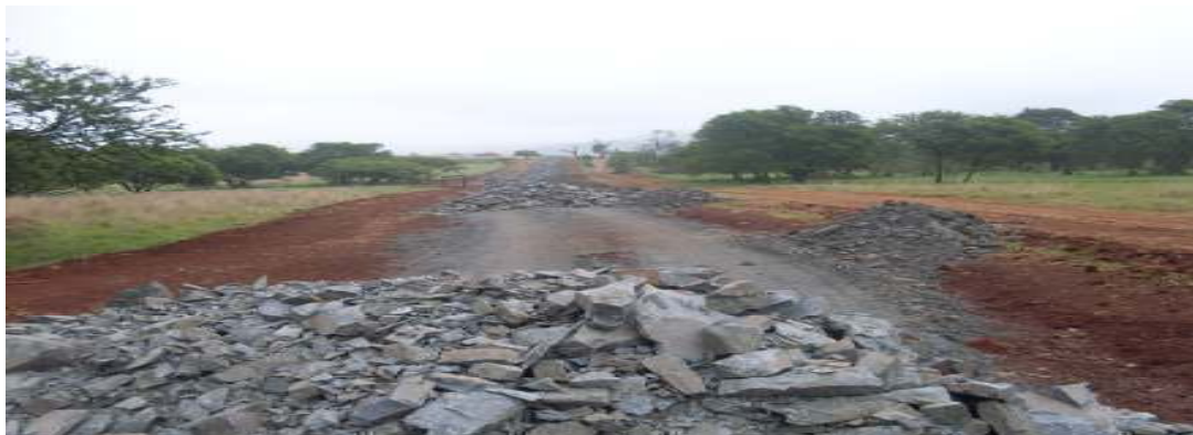
Photo 12 Construction of new road.