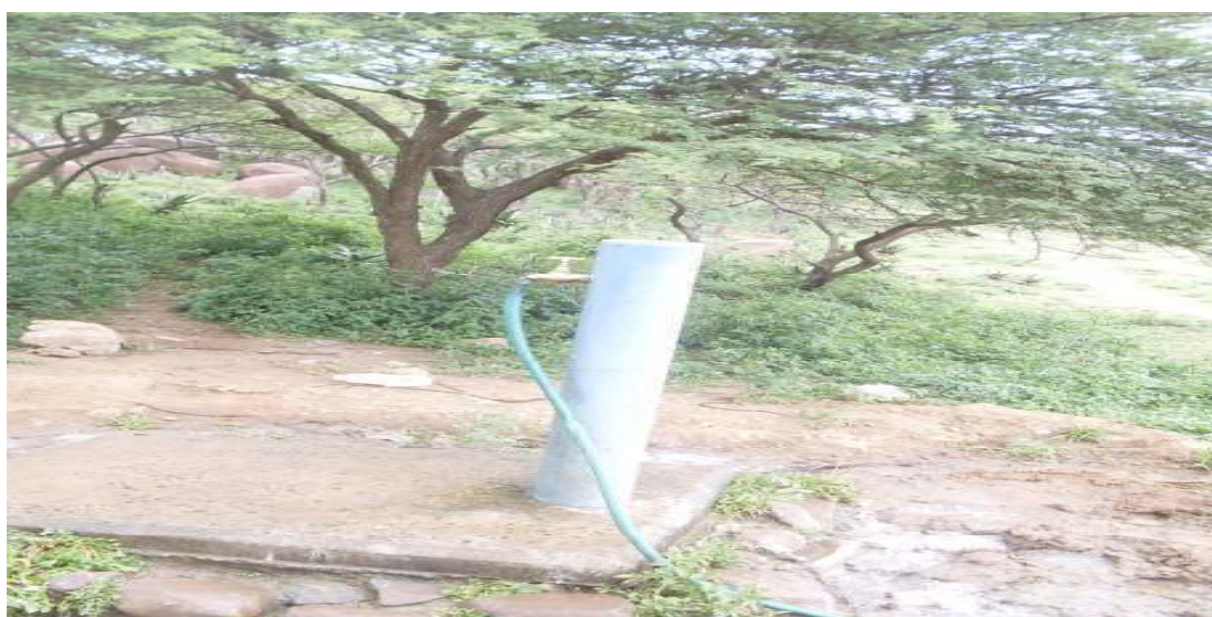
Photo 7 Communal tap for Rocky Drift residents.