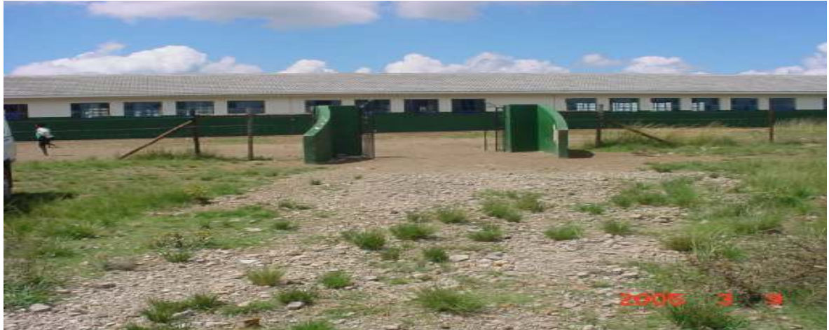
Photo 8 The upgraded secondary school funded by the UDM.