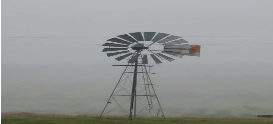
Photo 4 Windmill supply water to the tanks for residents.