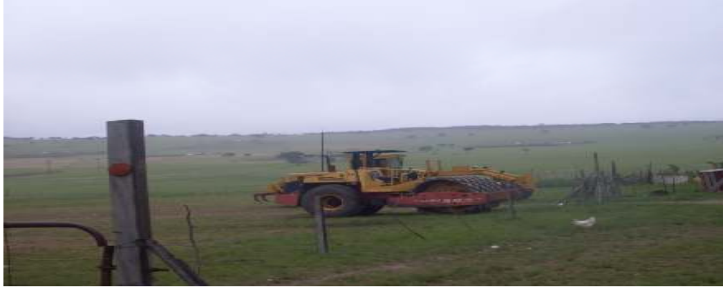
Photo 13 Bulldozer on site for construction of the new road.

The above photos demonstrate great improvement of the road infrastructure to Rocky Drift, which confirms developmental progress in the area. It is also widely agreed by the respondents that even the smaller vehicles are now able to go through to the farm, which was not the case in the past.