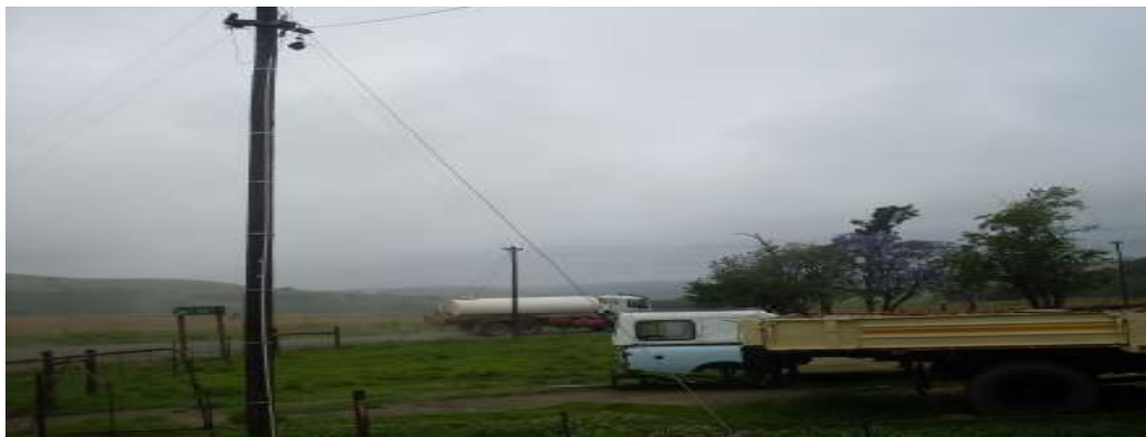
Photo 3 The truck providing water for RD residents.