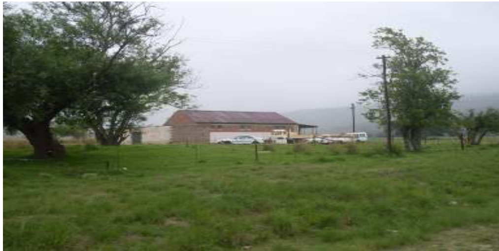
Photo 2: The old store at Rocky Drift prior to 1997.

However, it was revealed by one respondent that there was in fact one general dealer owned by the white farmer. This 'shop' was built to cater for labour tenants prior to 1997. Photo 2 below shows an old trading store.