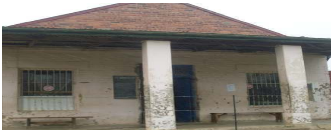
Photo 14 Rocky Drift trading store.

photo 14 showing an old Rocky Drift trading store situated at Middelrus area within the study area.