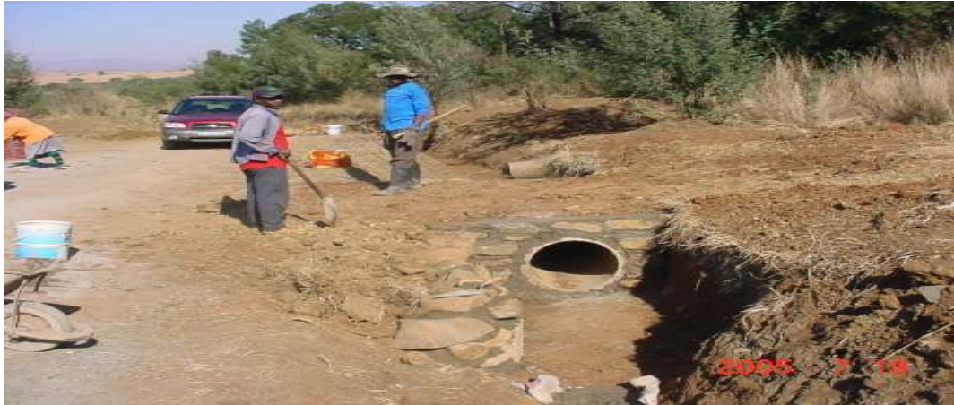
Photo 11 Rocky Drift resident's involvement in upgrading the road.