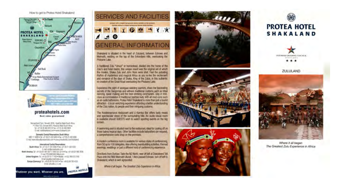
Fig. 6: Over sheet 2