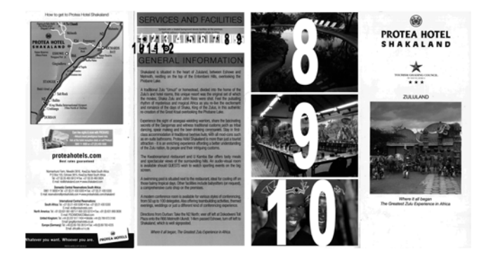
Fig. 7: Annotated Over sheet 2