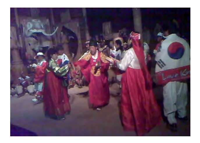
Fig. 9: A new set of performers

At the end of the routine, the performance area suddenly became inundated with the Korean members of the audience, who proceeded to demonstrate their own dancing and music routines (Fig. 9). This was a brightly coloured, multi-generational bunch, dressed in some of their own 'traditional' garments. The content was markedly different from what was offered by the Zulus: musically, the tempo had reduced by about forty beats-per-minute, and the time signature had become six-over-eight. There wasn't such an emphasis on crotchets like there were in the Zulu performance, but on establishing a patterned, more elaborate, beat. The sound was more delicate, with metallic objects being favoured over large, confrontational bass-drums. The body movements were also markedly different, with the exuberance and explosiveness of the Zulu dancing being replaced by a more gentle swaying of the knees and hips, as each followed another in a slow, train-like, snaking line around the stage.