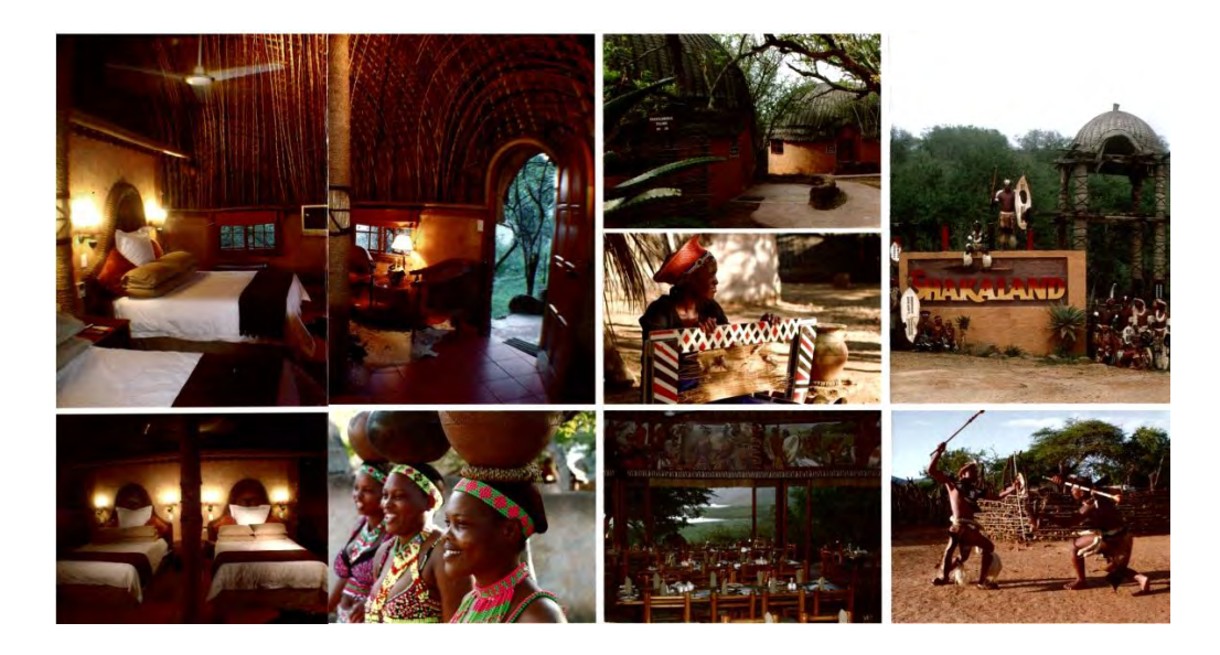
Fig. 4: Over sheet 1