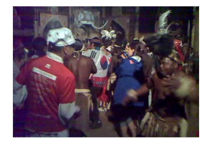
Fig. 10: Cohesion

The amalgamation of cultural signifiers from contexts separated by vast differences in both time and place, were here interacting in one cohesive semiotic whole; in one textual, postmodern pastiche – "a field of stylistic and discursive heterogeneity without a norm" (Jameson, 1991: 6) (Fig. 10). The Zulu performers danced to the tune of the South Korean tourists, shifting their own dancing moves to suit the tones of the Korean beats. Yet there was also a greater, symbolic element to what was happening here. Throughout the tour, the South Koreans did not speak English, save one who acted as the group's interpreter for the entirety of the tour. Because the cultural tour is conducted in English, language was a barrier between the tour-guide and the tourists. Yet during this coalesced performance, language was no longer a problem and the tourists were able to interact with the toured. Additionally, the tourists had come here to experience the Other, and in this process of textual subversion, they finally achieved that, more than at any other time in the village; that is, they became the Other (cf. Crawford, 1992). For these performative South Koreans, this was an authentic moment in Africa. Here, was not a concern for the authenticity of originals, nor even of constructed signs, but for the allures of 'textual' play – of seeking entertainment in the experience. This was a moment of post-tourism.