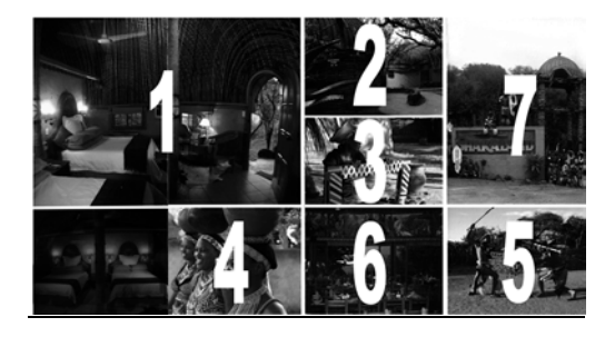
Fig. 5: Annotated Over sheet 1