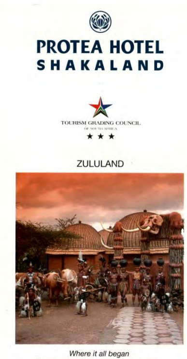
The Greatest Zulu Experience in Africa

Because semiotics grants primacy to the interpreter, the results of my analysis can't claim to be 'factual', only the result of my own cosmological orientations of Zulu representation. This is not semiotics' weakness but its strength: its ability to account for multiple interpretations. However, my analysis can be compared with the summary of the main representative codes/interpretive conventions for representing the Zulu I presented in Chapter 3.