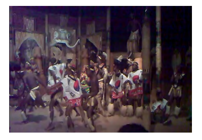
Fig. 8: "At some point they donned ponchos"

The performers performed a series of dances, culminating in a truly military-inspired performance of the Anglo-Zulu War Battle of Isandlwana. Although I argued that the mythical signs of Zulu dancing shift when they enter a capitalist framework, there are still some degree of iconic and indexical modalities retained. For instance, in the Isandlwana dance, the young warrior dancers produce indexical signs that stand for the English soldiers firing and reloading their Martini Henrys. I enquired as to the origin/context of the dances being performed at Shakaland. These dances, according to Sibusiso (personal correspondence, April 2011), are imported from the different communities from which the performers come from. This seems to imply that dancing is still employed in Zulu communities in KwaZulu-Natal, outside of capital frameworks. Because the performers at Shakaland are not related (save a few of the children who belong to the workers), the members, and thus the dances, all come from different communities. Once a dance has been brought in, it is adapted and choreographed as necessary (Sibusiso, personal correspondence, April 2011). These dances thus have organic roots, emanating from Zulu communities, while being adapted to an easily consumable touristic product, employing the cast of the cultural performers.