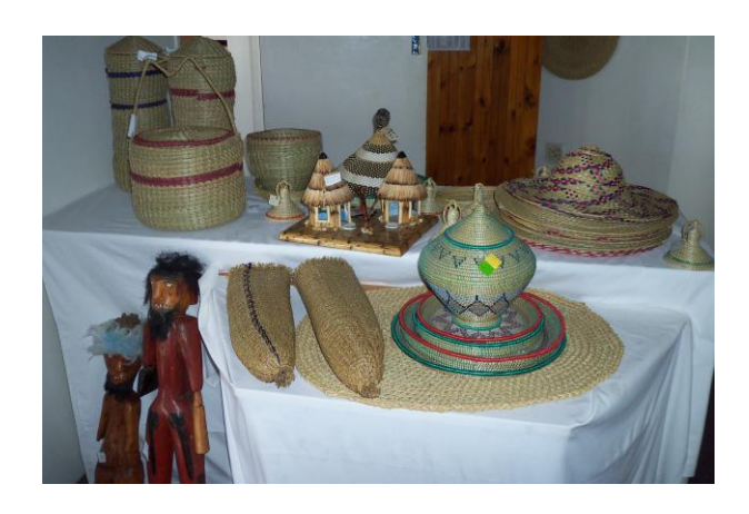
Photo of crafts sold to tourists at the lodge. Source: Varona Sathiyah. 6 December 2011.

Photo of the Batlokoa motif rugs and cushions in the lounge of the lodge. Source: Varona Sathiyah. 6 December 2011.