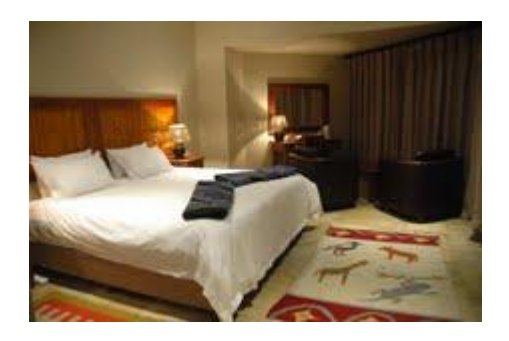
Photo of Interior of refurbished Chalet- October 2013.