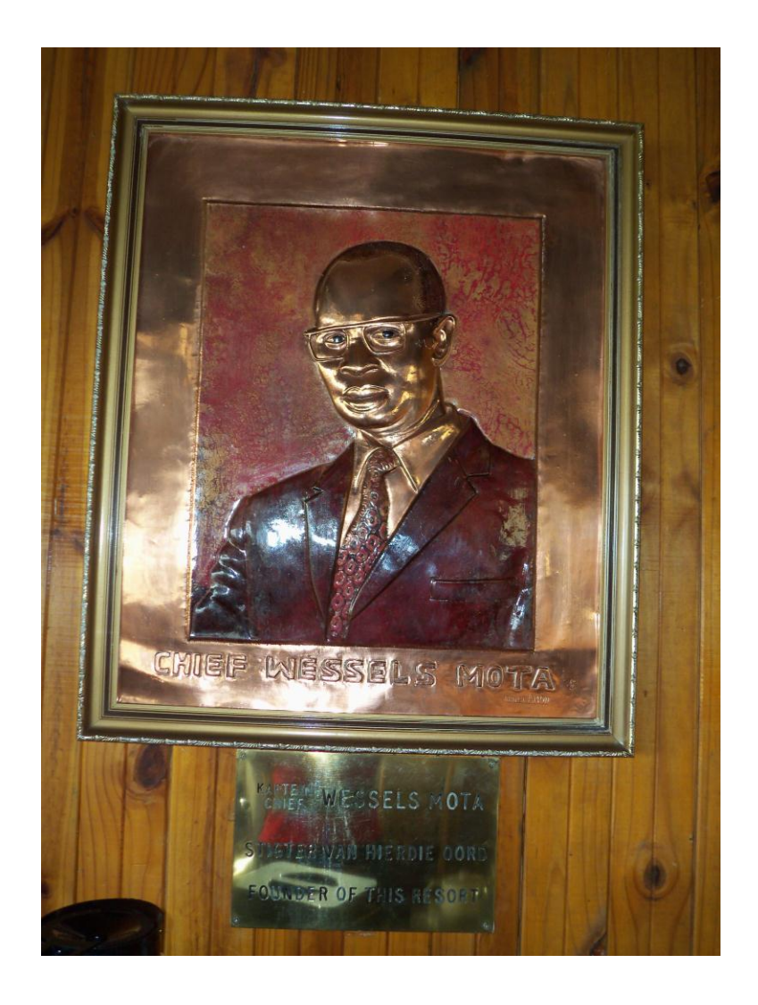
Photo of Copper etching of Chief Mota that is at the reception area of the lodge.

Source: Varona Sathiyah, 6 December 2011.