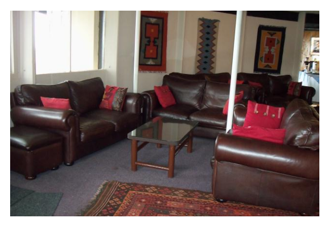
Photo of the Batlokoa motif rugs and cushions in the lounge of the lodge. 6 December 2011.