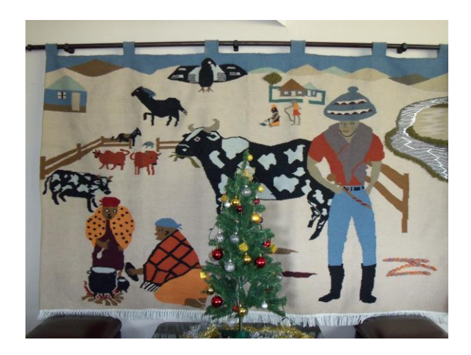
Photo of the wall tapestry in the lounge of the lodge, depicting traditional Batlokoa lifestyle. Source: Varona Sathiyah. 6 December 2011.

Photo of crafts sold to tourists at the lodge. Source: Varona Sathiyah. 6 December 2011.