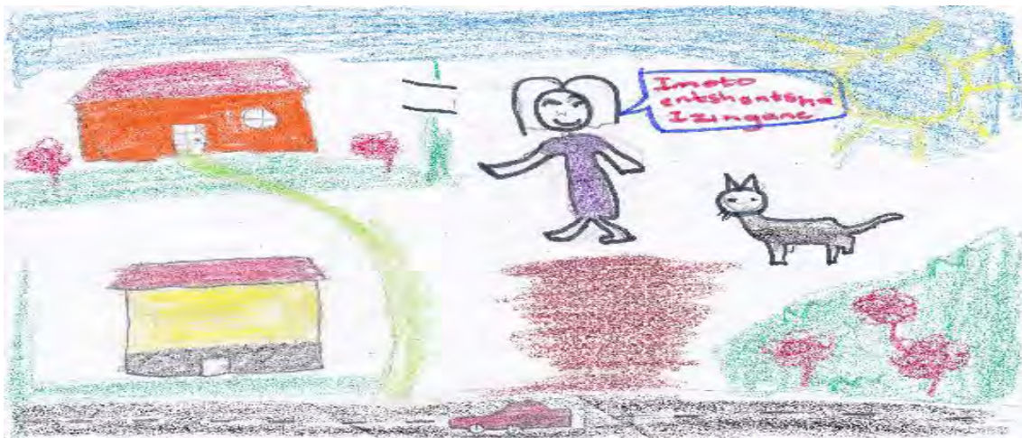
FIGURE 12: MY DREAM (LEARNER 2)

Presented below is a selection of dreams and learners' descriptions they had shared with me. In my study, the majority reflected secret fears and anxieties. The dream of Learner 2 reflected the spiritual traits of caring, compassion, and concern for the welfare of children. The fear of child kidnapping emerged in the dream, and reflect the secret hope for a safe environment, which also emerged in the drawings of love.