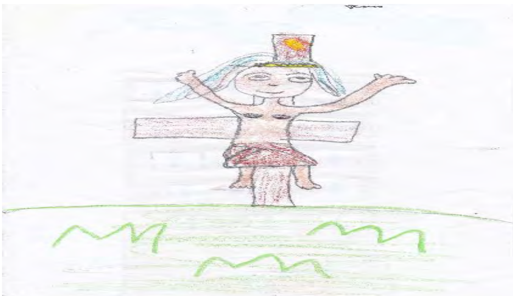
FIGURE 2: DRAWING OF GOD BY LEARNER 7

God was also seen by learners as a ‘Saviour’ of people, and that he lived and died for the sins of people. Again, Jesus is referred to as a God. Learner 7 drew this picture of Jesus/God below and explained it as In this picture, God is dying for our sins.