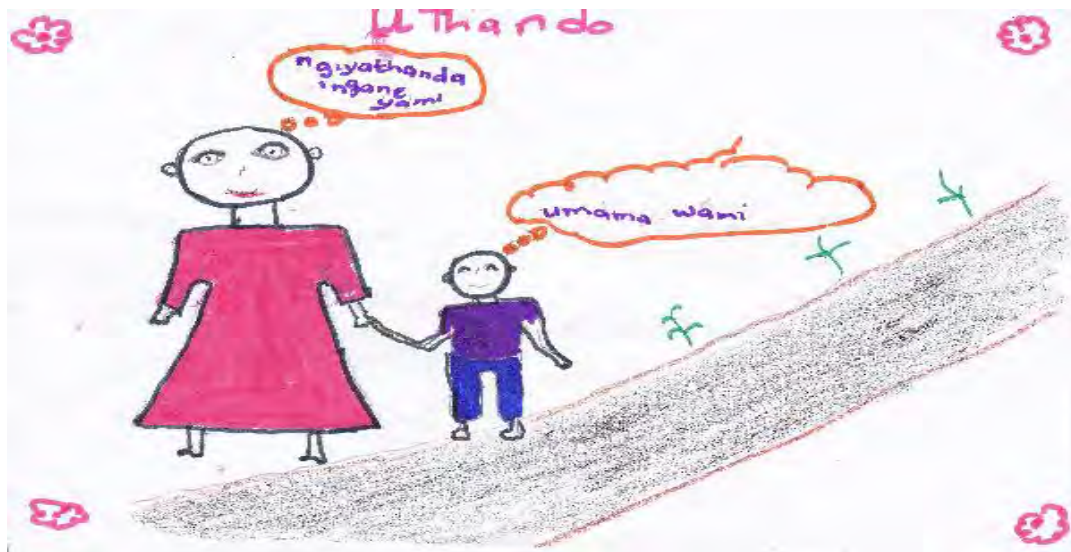
FIGURE 6: DRAWING OF "LOVE" (LEARNER 1)

Learner 1 depicted love in the relationship between mother and child.