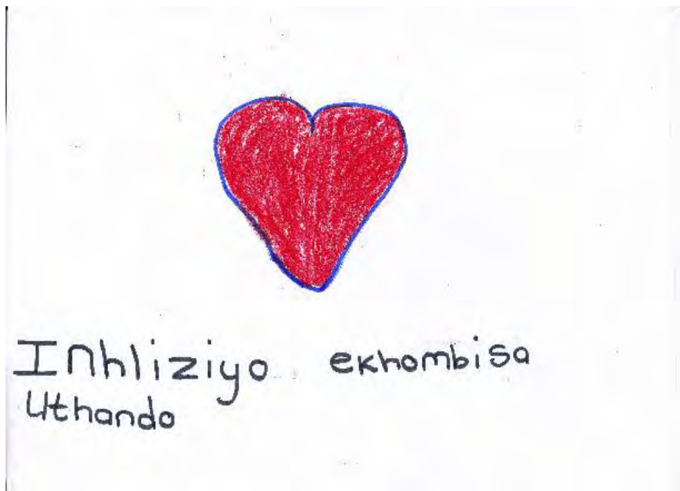
FIGURE 9: WHAT IS LOVE?

This drawing is about love. I drew a heart - this heart is full of love. I love my parents, my granny, and my little sister. I love eating and playing. Below my drawing, I wrote "Inhliziyo ekhombisa uthando" meaning "the heart that shows love". Love stays in the person's heart. A person who loves is good and kind.