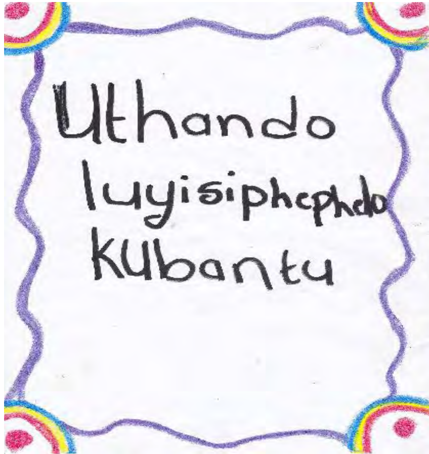
FIGURE 10: DRAWING OF LOVE