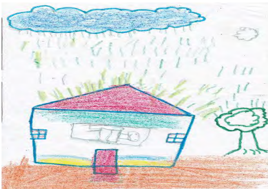
FIGURE 13: DREAM OF LEARNER 5

her rondavel. It was raining hard. Granny was telling me to wake up so that we could pray. I got up and so the dream was over. That is me on the bed.