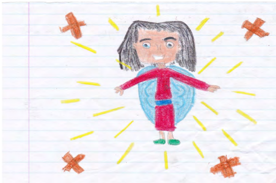
FIGURE 3: DRAWING OF GOD

In the drawing below, Learner 6 depicts God.