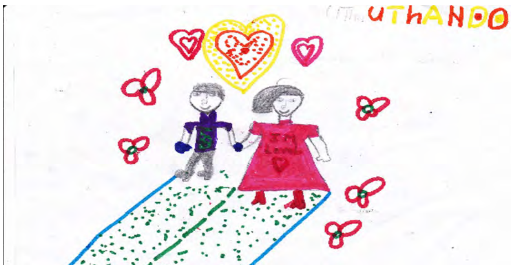
FIGURE 7: DRAWING OF "LOVE"

Learner 4 depicted the love shared between his mother and father in the context of a trip to a large shopping complex. The learner used red hearts and bright red flowers to depict love.