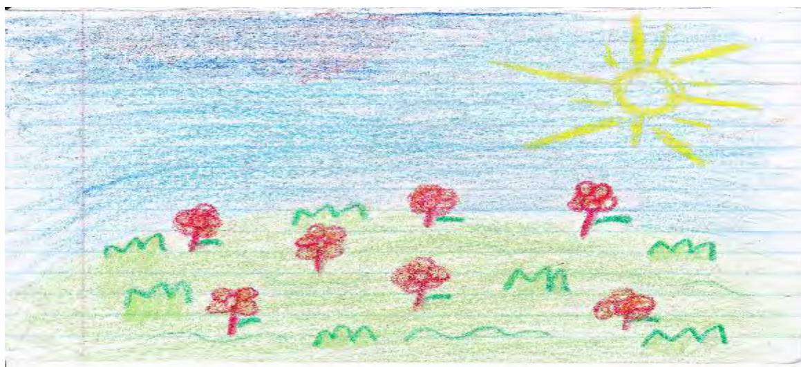
FIGURE 11: LOVE AND NATURE

also drew the blue sky because I love the sun, flowers, grass, and the sky.