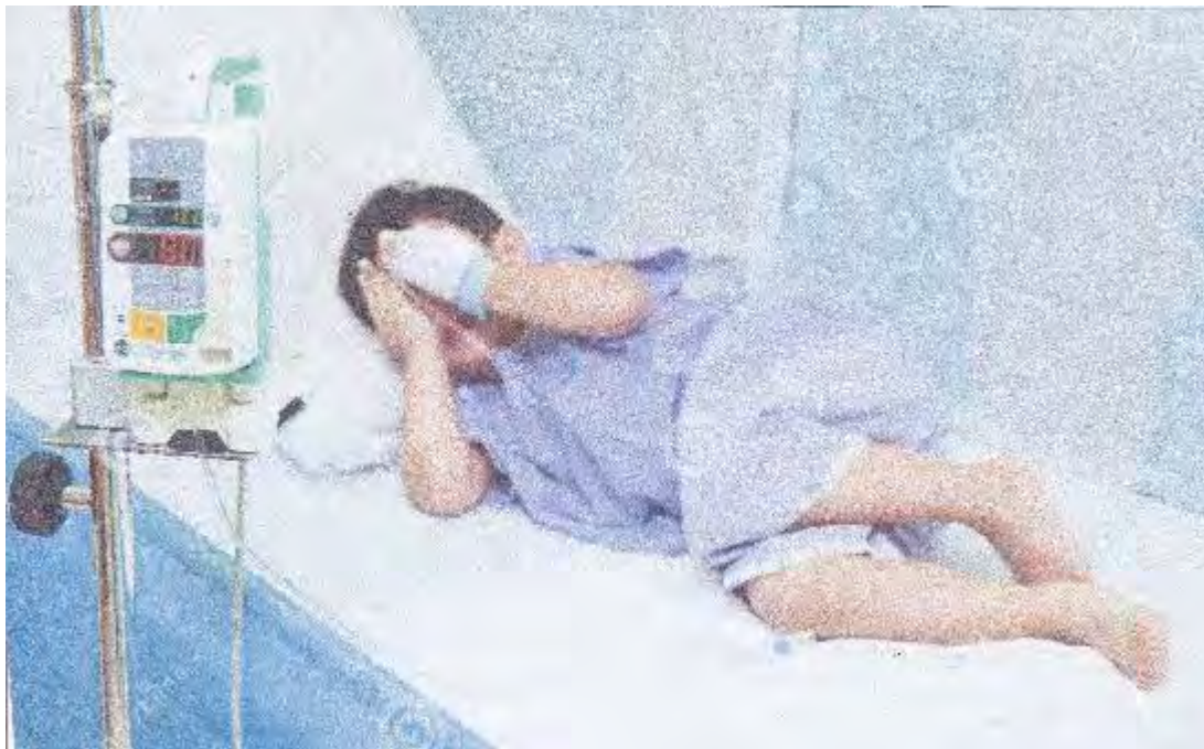
FIGURE 1: PICTURE SHOWN TO PARTICIPANT

Each learner was shown the picture below and asked to respond to questions. The picture was used to arouse the learner's interest and to provoke the learner to talk about issues on morality and spirituality.