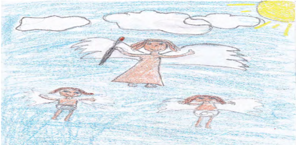
FIGURE 1: DRAWING GOD

Below is a drawing by Learner 8, depicting his conception or understanding of God.