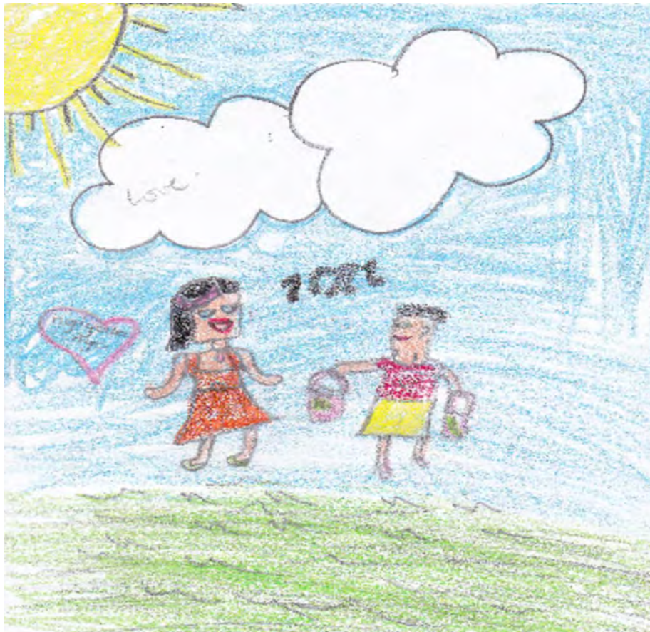
FIGURE 8: WHAT IS LOVE?

Learner 8 depicted the interaction between two mothers.