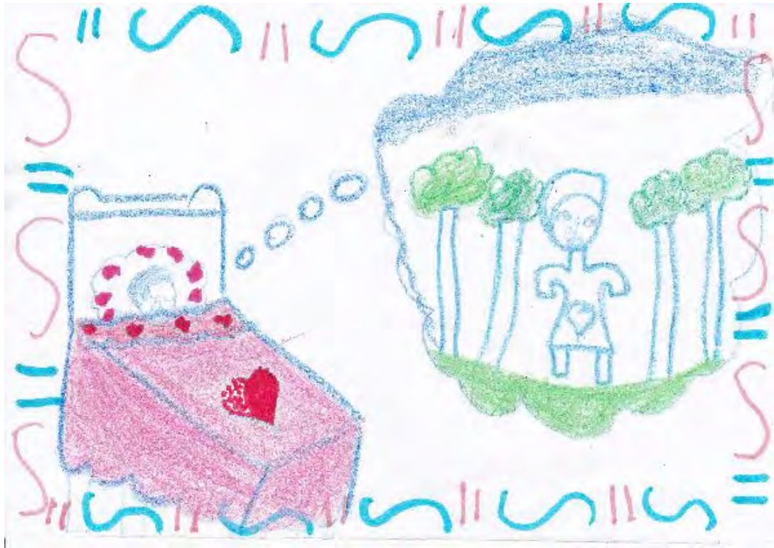
FIGURE 15: DREAM OF LEARNER 3