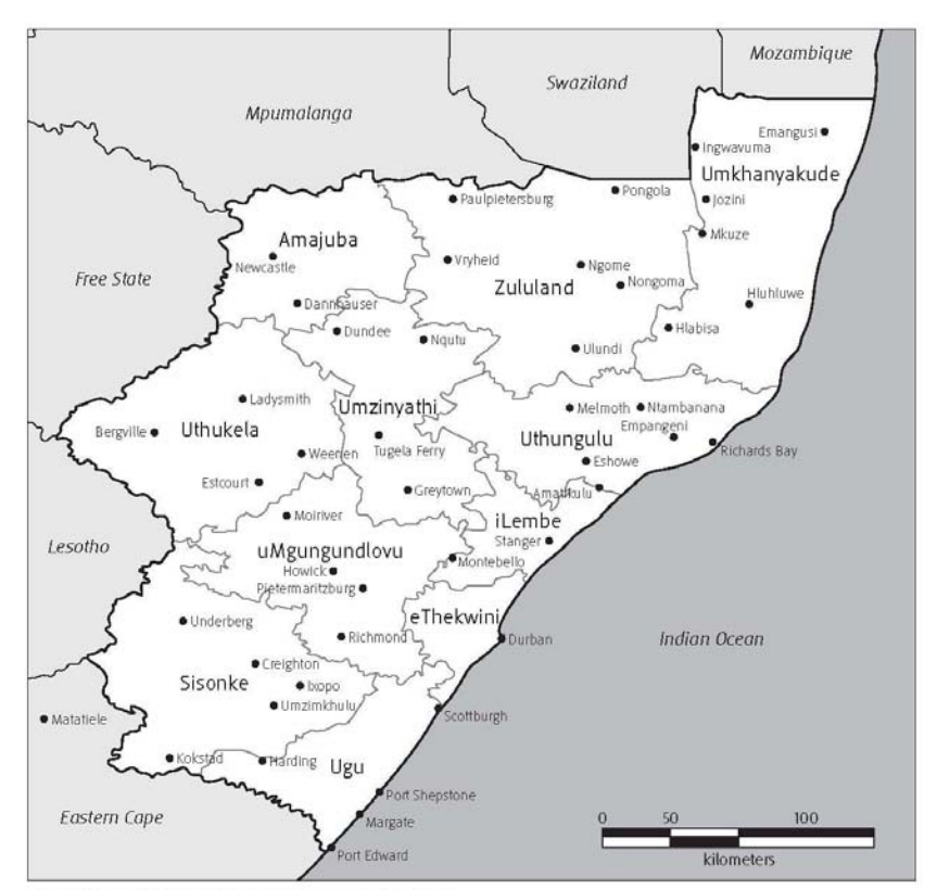
Figure 3. KwaZulu-Natal province health districts<sup>14</sup>