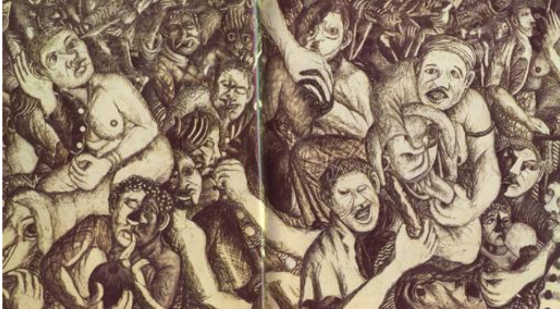
Fig 3.4.2 Tears of Africa (1988) 2