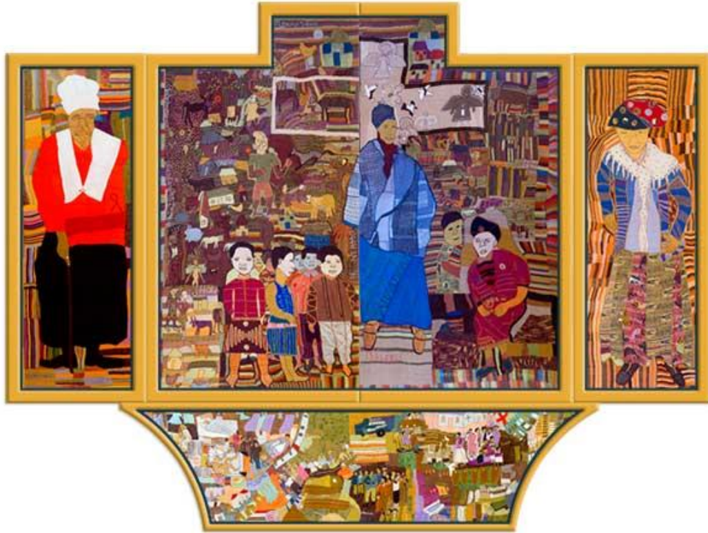
Fig. 5.5.4 Keiskamma Altarpiece (2005, The Closed Altarpiece.) 45