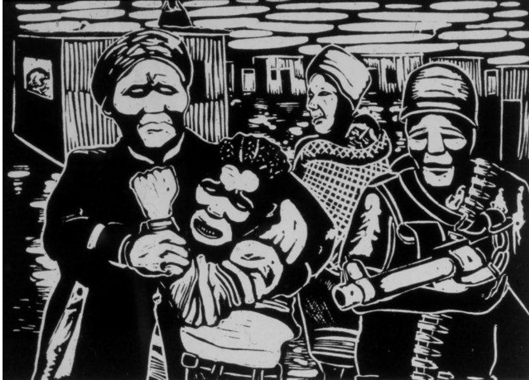
Fig 3.4.1 No Life (1987) 1