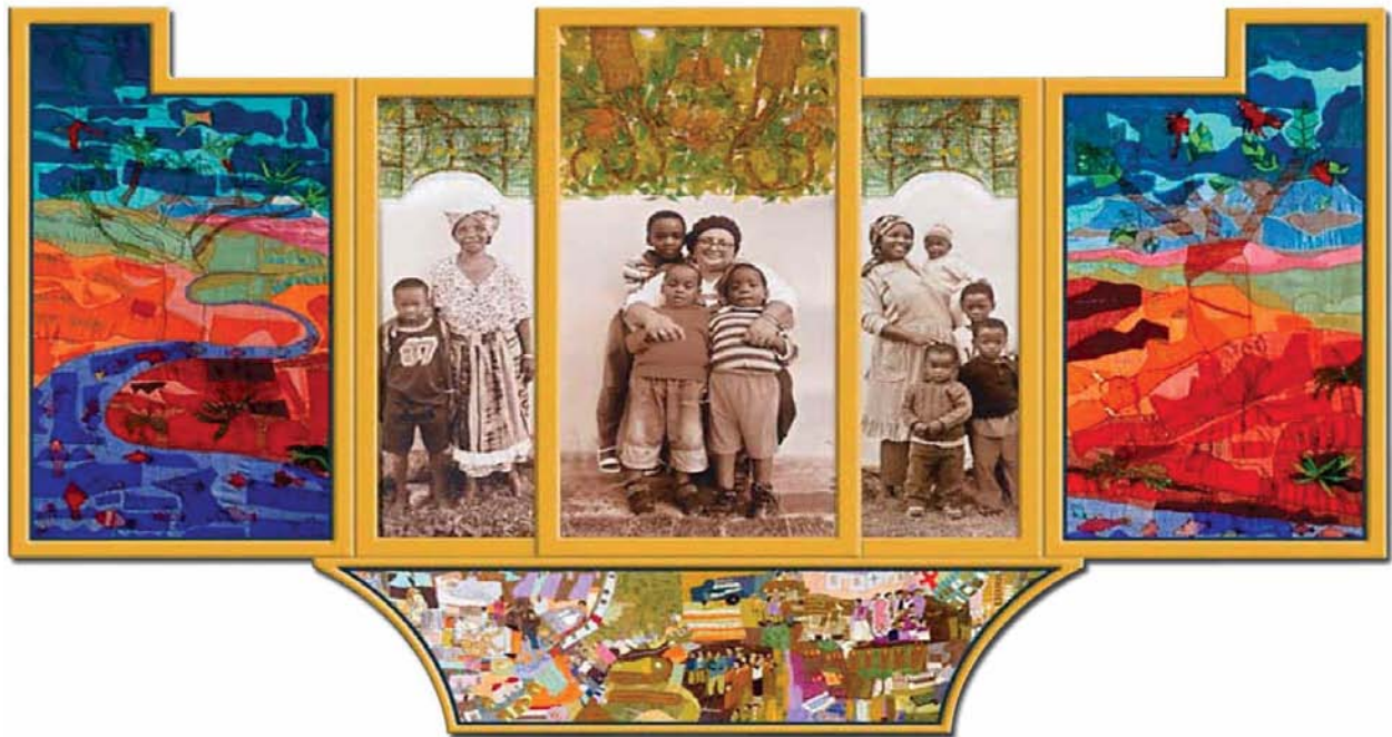
Fig. 5.5.6 Keiskamma Altarpiece (2005, Detail of the second opening of the altarpiece.) 47