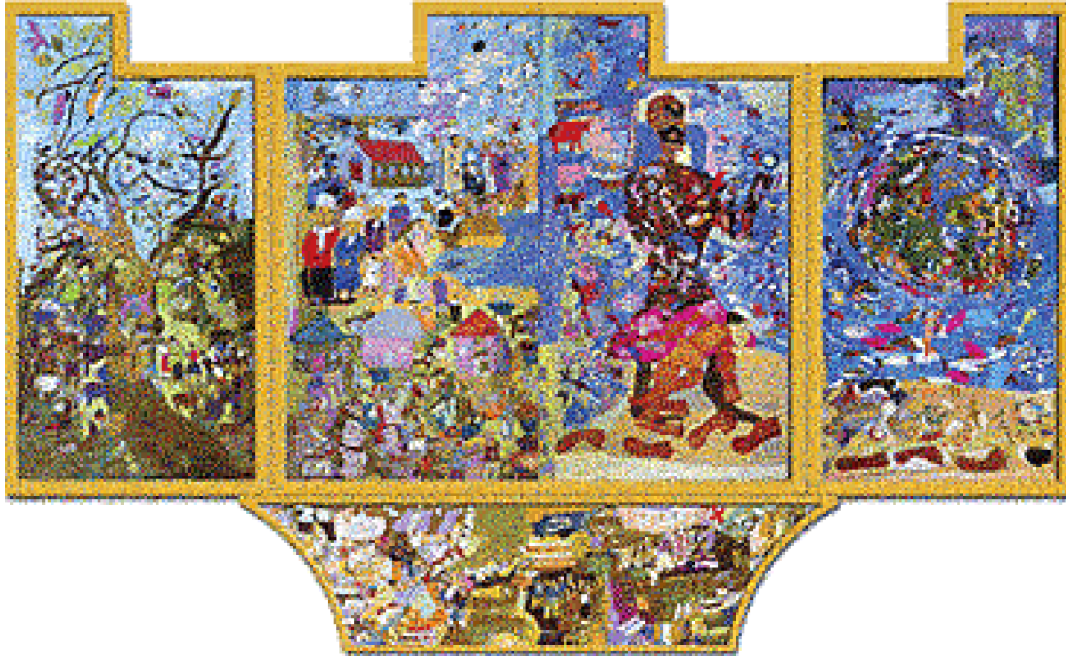
Fig. 5.5.5 Keiskamma Altarpiece (2005, Detail of the first opening of the altarpiece.) 46