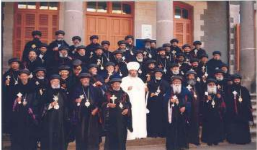
Figure 2 : EOTC Bishops (all male), who are decision makers at Holy Synod.

The position of women within the EOTC and whatever role women or men are allowed or not allowed to play depends on the prerogative of men (male bishops) who are the only decision-makers in the Holy Synod.