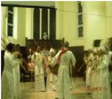
Figure 1: Women and men as part of the youth group perform the traditional religious dance called “woreb” at Durban St. Mary’s EOTC parish day, 15 May, 2011 in the presence of the diocesan bishop Abuna Yacob.

As noted above, the EOTC has done much in terms of providing educational opportunities, but these have been delivered for a large number of men and for very few women. According to Dejene et al, “Ethiopia has a long history of traditional education,