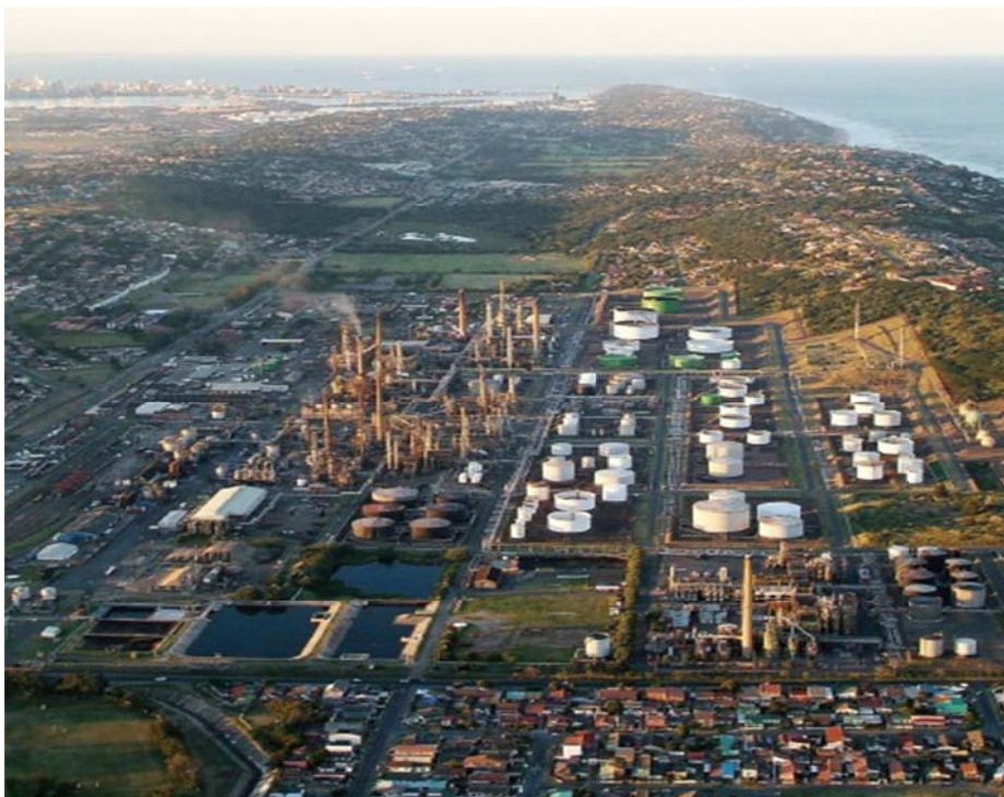
Figure 2. Engen Oil Refinery in Wentworth 2011.