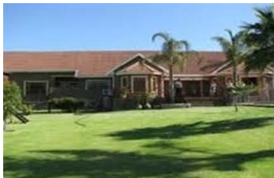
Figure 9: Photograph showing a house for sale in the Glenwood suburb.