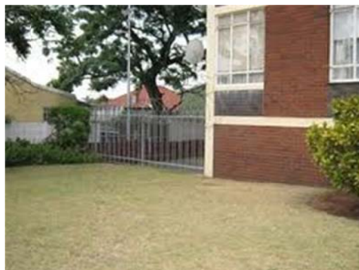
Figure 8: Photograph showing the outside of a block of flats in Glenwood.