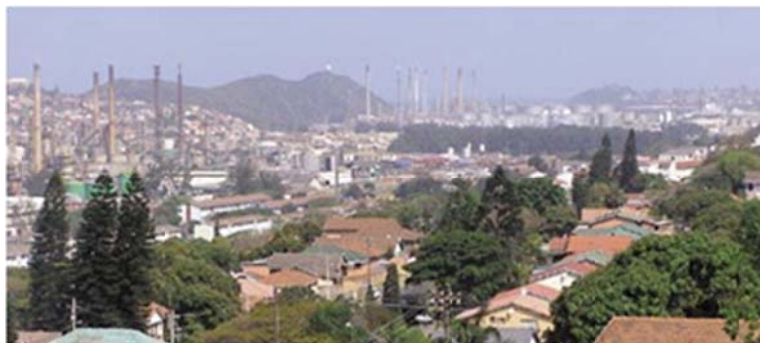
Figure 6: View of South Durban from Wentworth, showing from left Engen refinery, in the centre Sapref refinery and to the right Mondi.