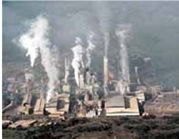
Figure 1. Engen Oil Refinery in Wentworth in the 1960s. Source: Google Maps. Retrieved July 2011