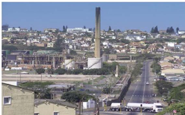
Figure 5: View of southern portion of Engen refinery from residential area of Austerville, with suburb of Merewent in background and on the right.