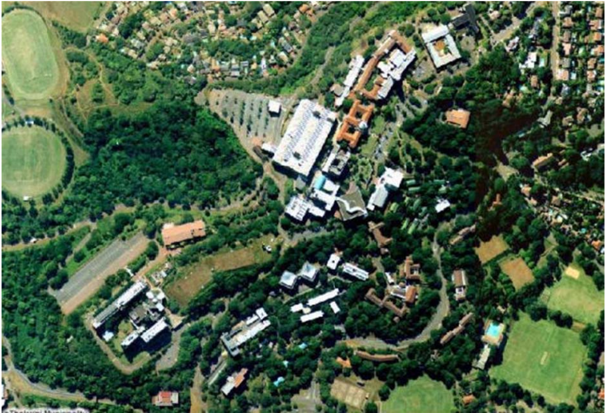
Figure 3. An aerial view of part of Glenwood, highlighting the greenery and open spaces.

The Glenwood community was once home only to white people. Well resourced schools, beautiful parks, churches and many trees planted in large yards and on the pavements were all invested in this area of Durban specifically for middle- to upper-class white people. Since the beginning of democracy people of all races have now moved into this community; it does, however, still appeal to the middle to upper classes. Today the members of this community, who are now of all race groups, continue to reap the rewards of what was once invested in Glenwood (Figure 3).