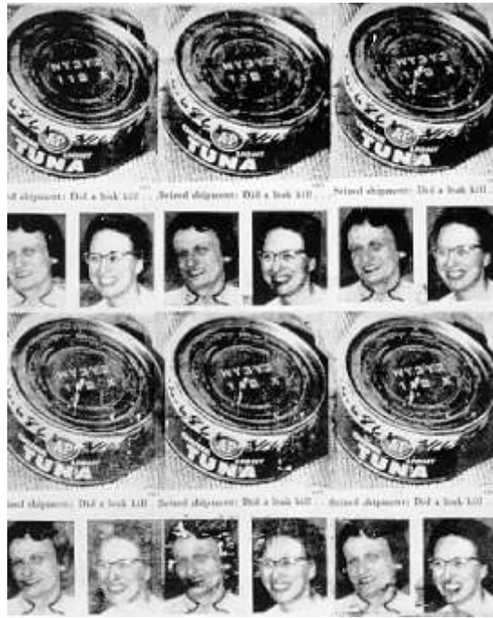
Figure 23. Andy Warhol. Tunafish Disaster (detail) (1963).