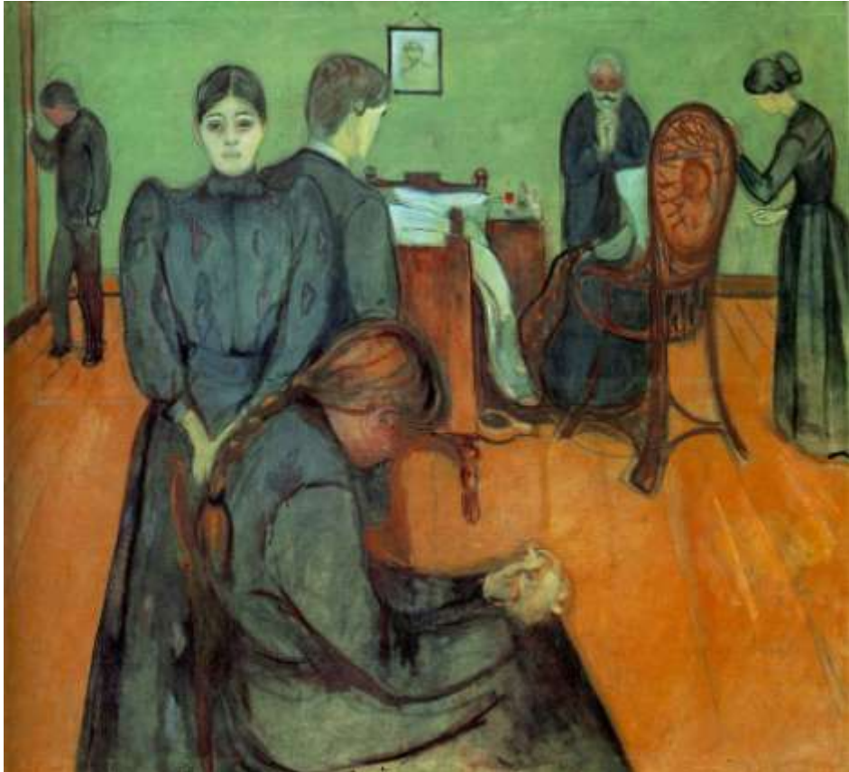
Figure 16. Edvard Munch. Death in the Sickroom (1893).