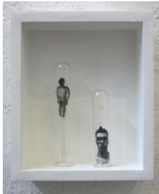
Figure 20. David Buchler. I must forget. I must let go (detail) (2004).