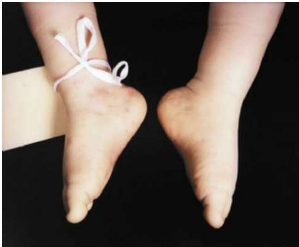
Figure 36. Andres Serrano. The Morgue (Fatal Meningitis) (1992).