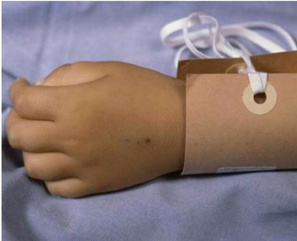
Figure 37. Andres Serrano. The Morgue (Death Due to Drowning) (1992).