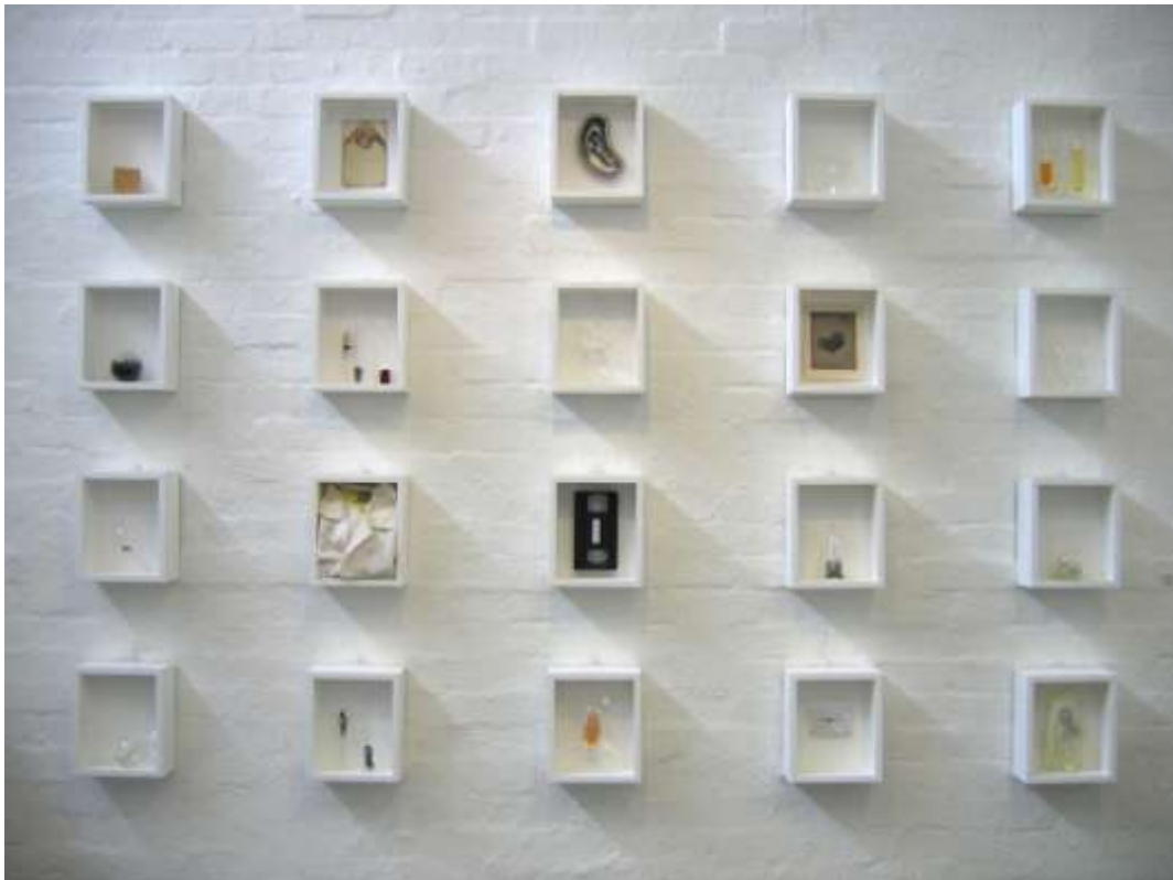
Figure 20. David Buchler. I must forget. I must let go (2004).