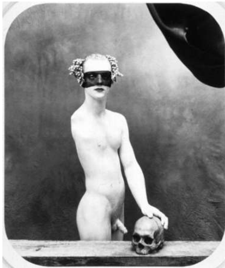
Figure 44. Joel-Peter Witkin. Portrait as Vanité, New Mexico (1995).