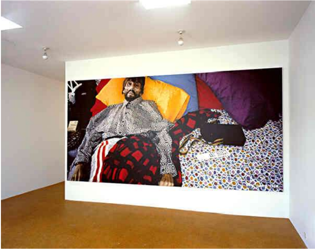
Figure 31. AA Bronson. Felix, June 5, 1994 (1994 -99).