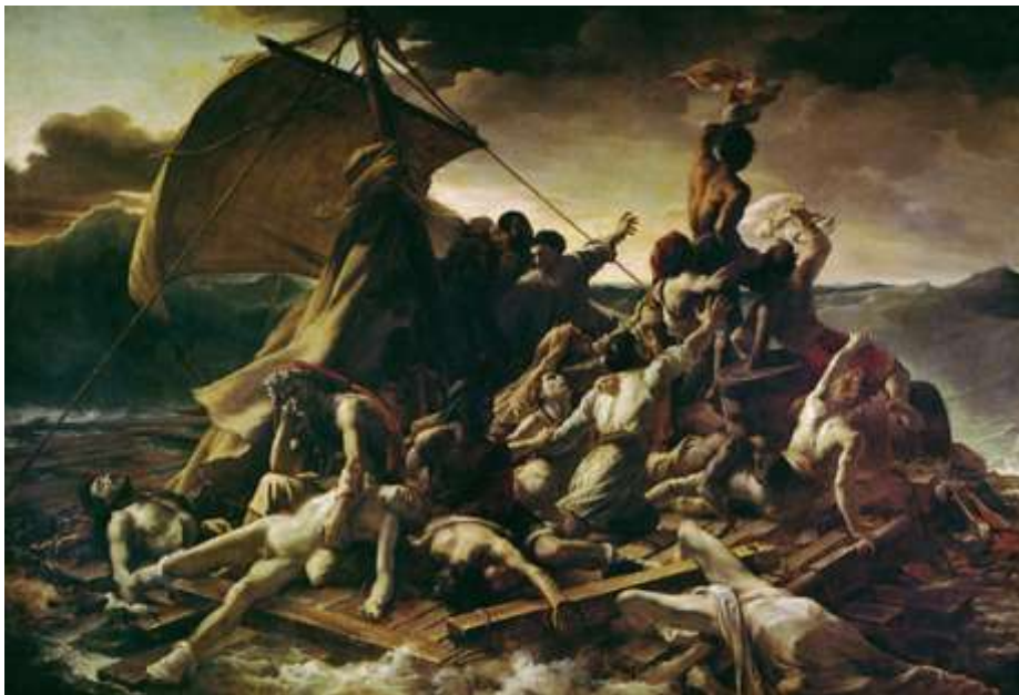
Figure 12. Théodore Géricault. The Raft of the Medusa (1819).