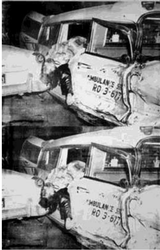
Figure 25. Andy Warhol. Ambulance Disaster (1963 – 4).