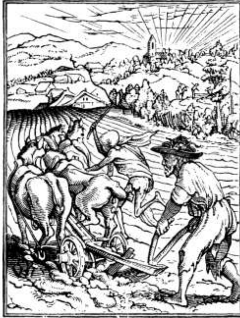
Figure 3. Hans Holbein. The Ploughman (Dance of Death) (c.1523 – 25 published 1538).