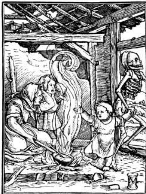
Figure 2. Hans Holbein. The Child (Dance of Death) (c.1523 – 25 published 1538).