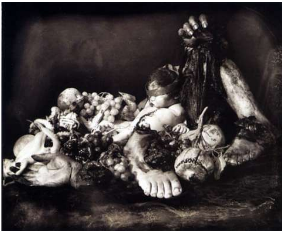
Figure 42. Joel-Peter Witkin. Feast of fools (1990).