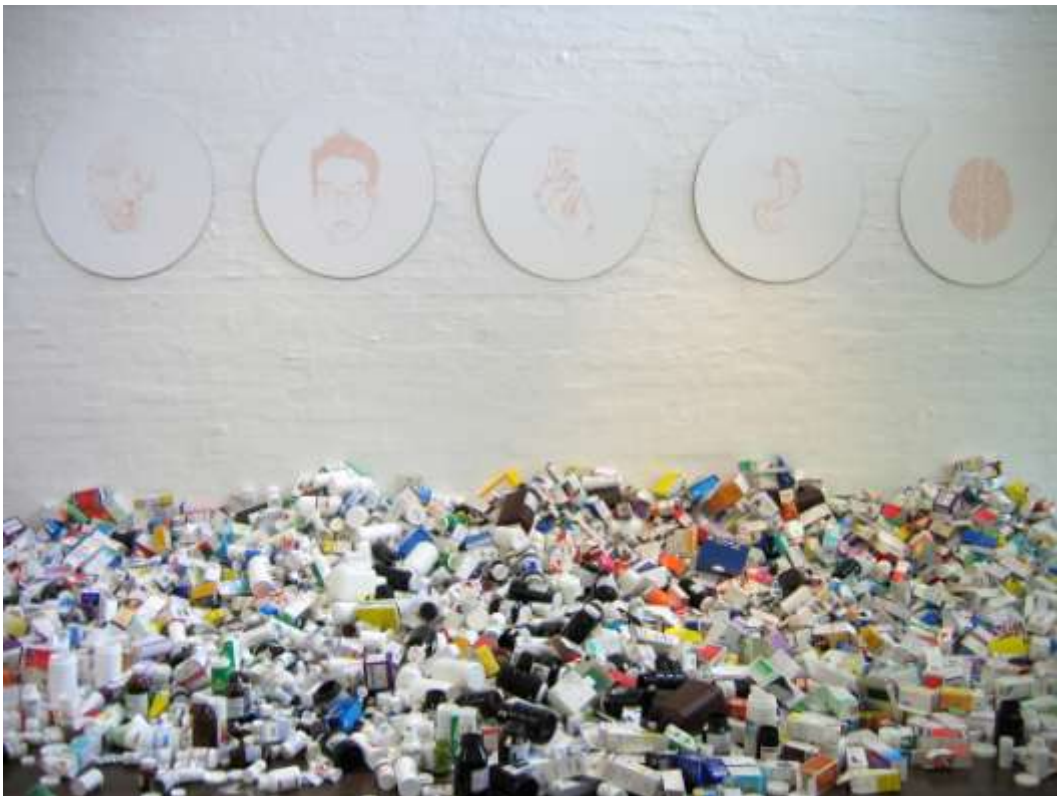
Figure 18. David Buchler. You're going to be just fine (2004).