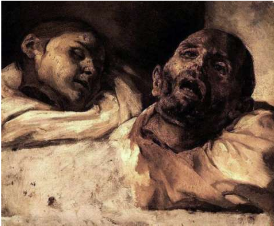
Figure 13. Théodore Géricault. Study of Two Severed Heads (1819).