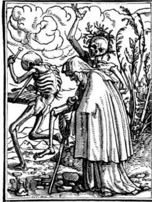
Figure 5. Hans Holbein. The old woman (Dance of Death) (c.1523 – 25 published 1538).