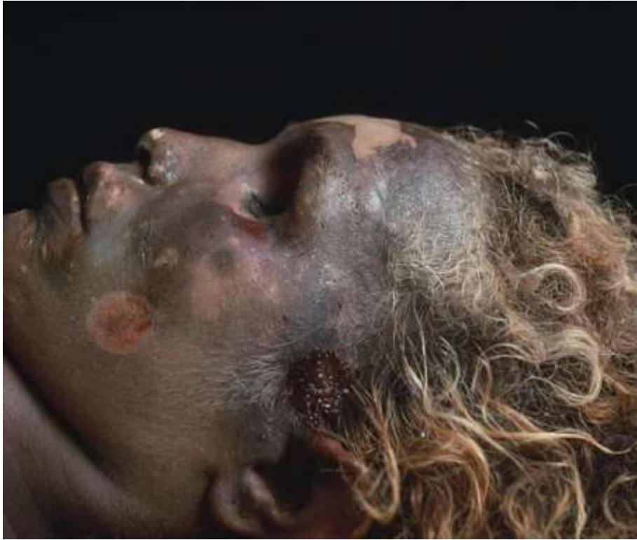
Figure 11. Andres Serrano. The Morgue (Jane Doe Killed by Police) (1992).