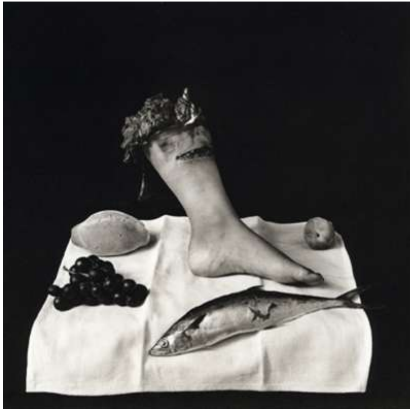
Figure 41. Joel-Peter Witkin. Still Life, Mexico (1992).