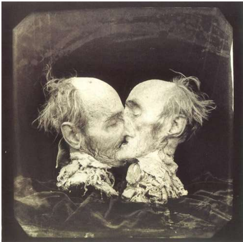
Figure 14. Joel-Peter Witkin. The Kiss (Le Baiser), New Mexico (1982).