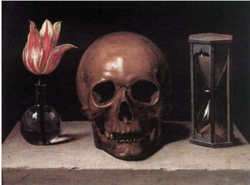
Figure 45. Philippe de Champaign. Vanitas (c.1671).