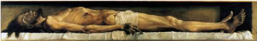
Figure 10. Hans Holbein. The Corpse of Christ in the Tomb (1521).