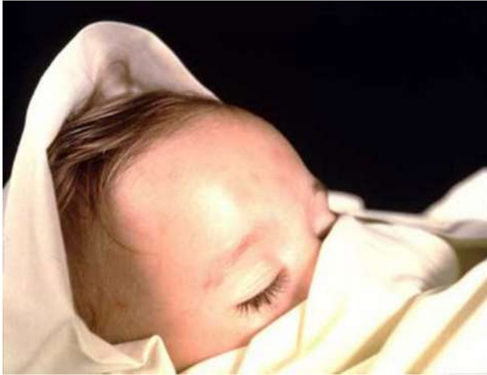
Figure 35. Andres Serrano. The Morgue (Fatal Meningitis II) (1992).