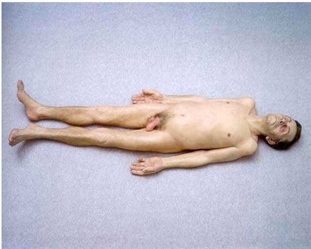
Figure 30. Ron Mueck. Dead Dad (1996 – 7).