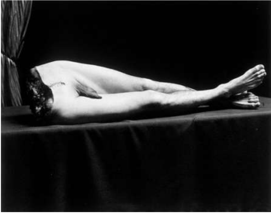
Figure 43. Joel-Peter Witkin. Corpus Medius (2000).