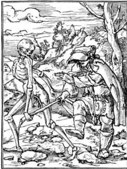
Figure 4. Hans Holbein. The Blind Man (Dance of Death) (c.1523 – 25 published 1538).