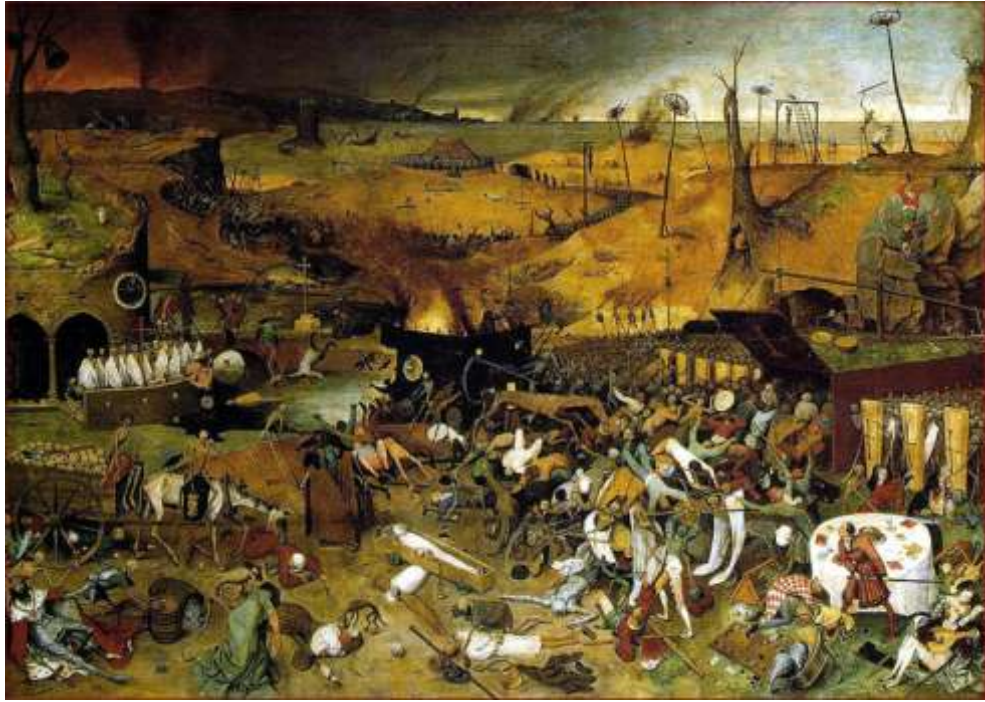
Figure 7. Pieter Bruegel. The Triumph of Death (1562).