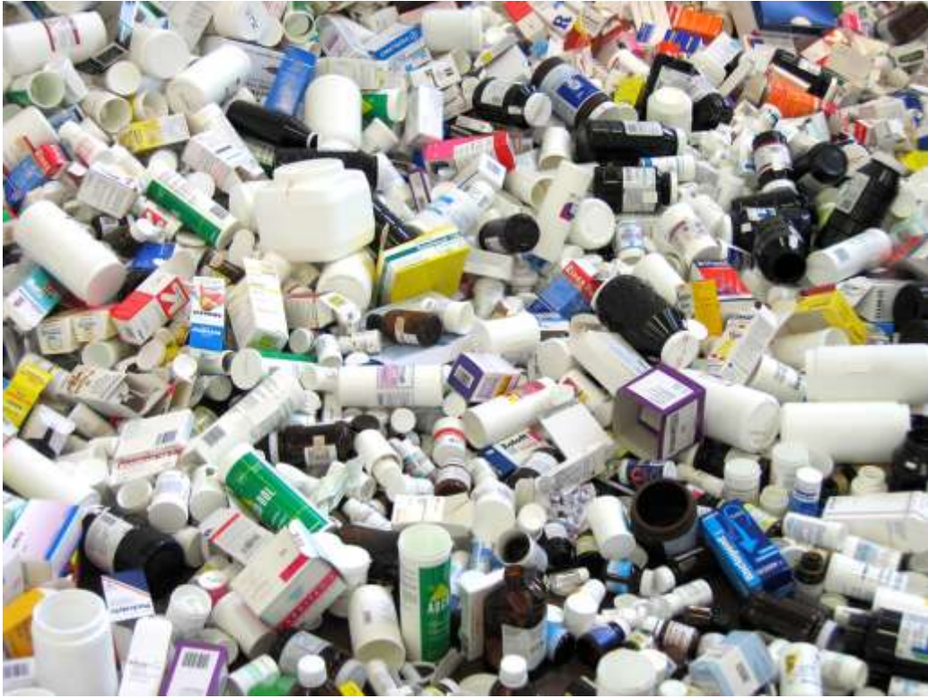
Figure 18. David Buchler. You're going to be just fine (detail) (2004).