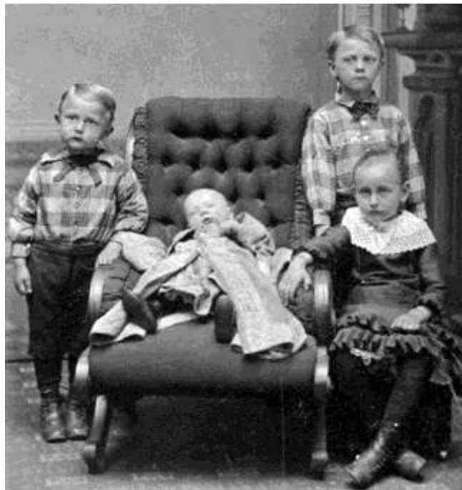
Figure 28. Unknown photographer. Untitled: Death Scene (1854).