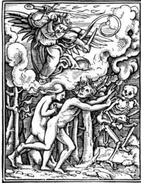
Figure 1. Hans Holbein. Expulsion of Adam and Eve (Dance of Death) (c.1523 – 25 published 1538).