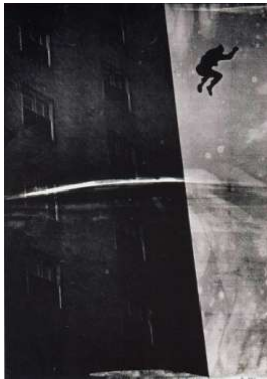
Figure 24. Andy Warhol. Suicide (1964).