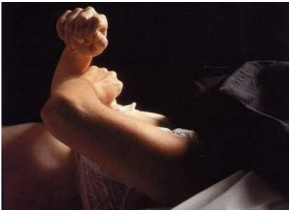
Figure 38. Andres Serrano. The Morgue (Rat Poison Suicide) (1992).