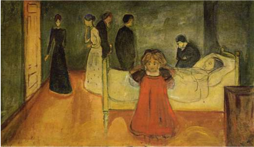
Figure 17. Edvard Munch. Dead Mother and Child (1897 – 9).