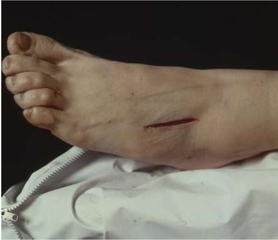
Figure 9. Andres Serrano. The Morgue (Rat Poison Suicide II) (1992).