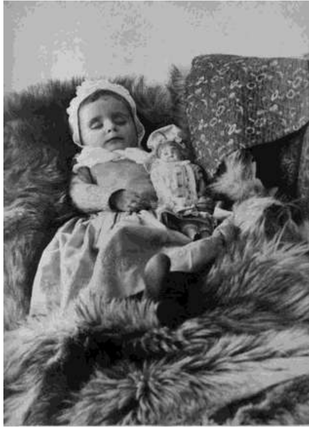
Figure 27. Unknown photographer. Dead Child (1850).