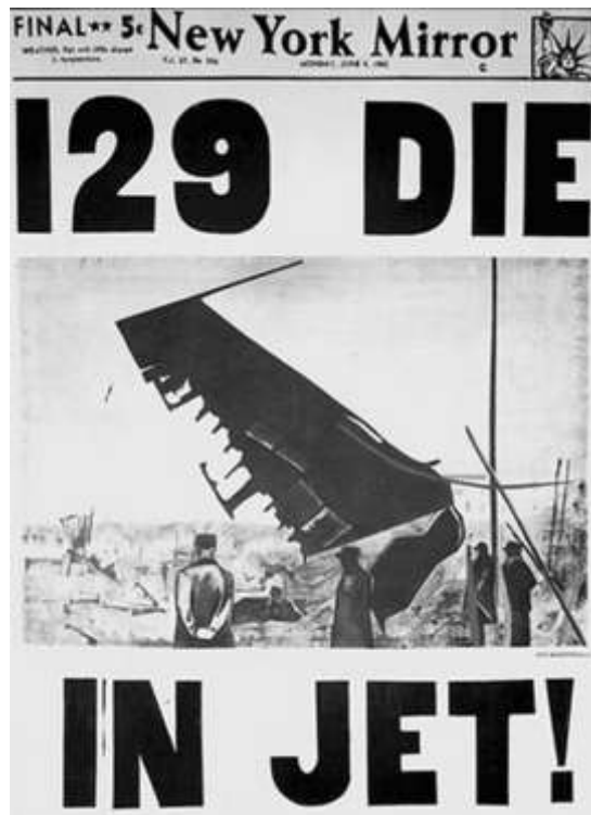
Figure 21. Andy Warhol. 129 DIE IN JET (1962).