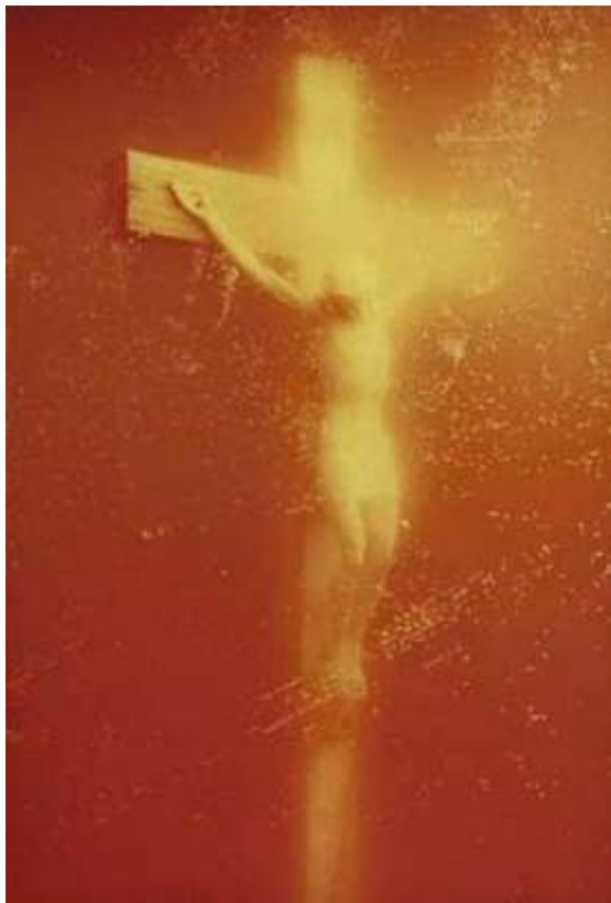
Figure 40. Andres Serrano. Piss Christ (1987).