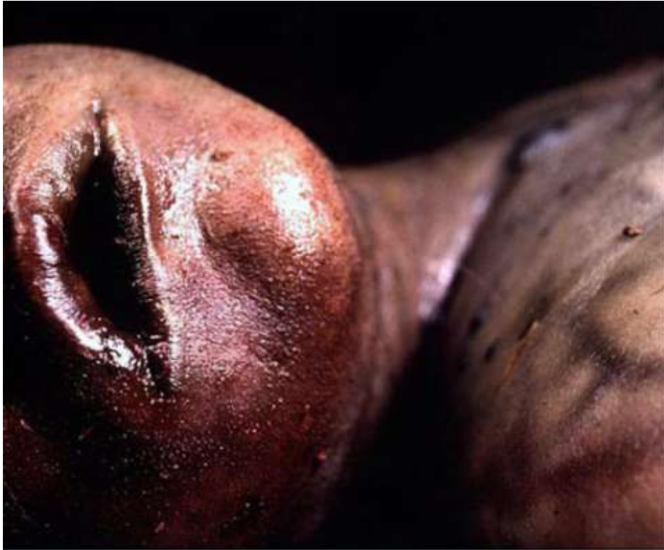
Figure 39. Andres Serrano. The Morgue (Death Due to Drowning II) (1992).