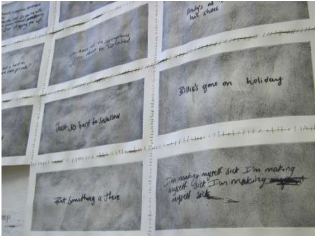
Figure 19. David Buchler. I remember . . . (detail) (2004).