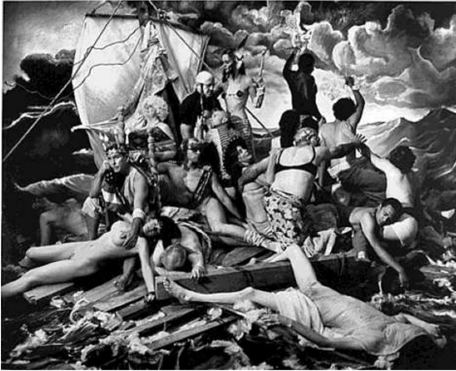
Figure 15. Joel-Peter Witkin. The Raft of George Bush (2006).