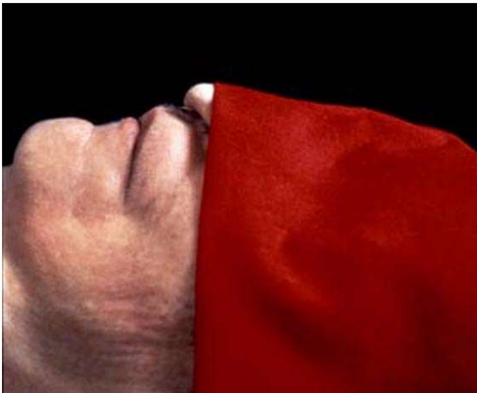
Figure 34. Andres Serrano. The Morgue (Infectious Pneumonia) (1992).