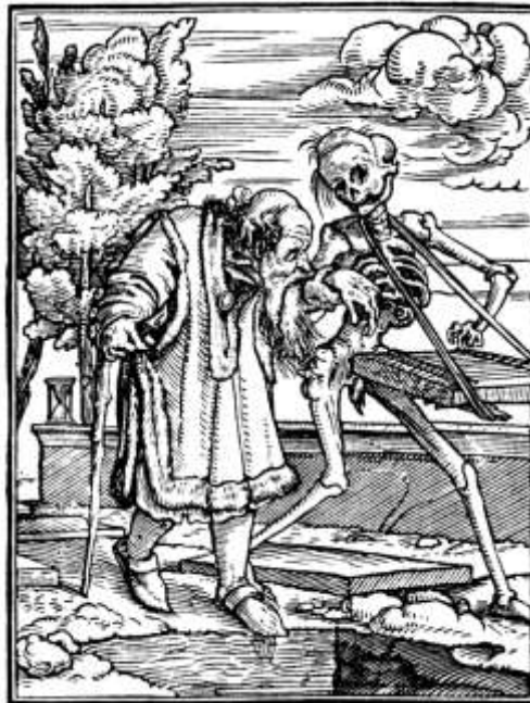
Figure 6. Hans Holbein. The old man (Dance of Death) (c.1523 – 25 published 1538).