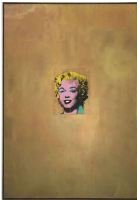
Figure 22. Andy Warhol. Gold Marilyn (1962).