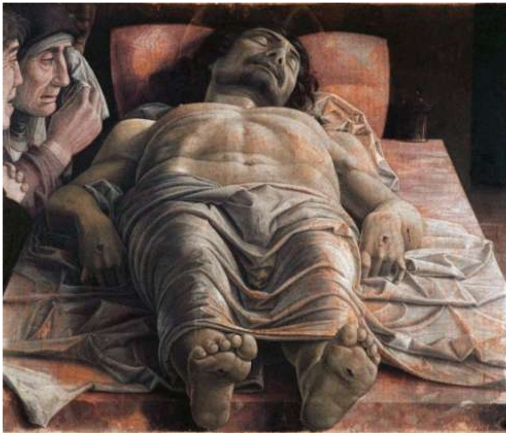
Figure 8. Andrea Mantegna. Dead Christ (1480).