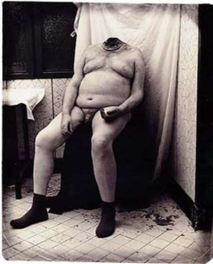
Figure 46. Joel-Peter Witkin. Man Without a Head (1993).