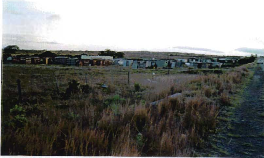
Fig. 4.5.1b Wooden informal structures sometimes destroyed by fire (Wesley)