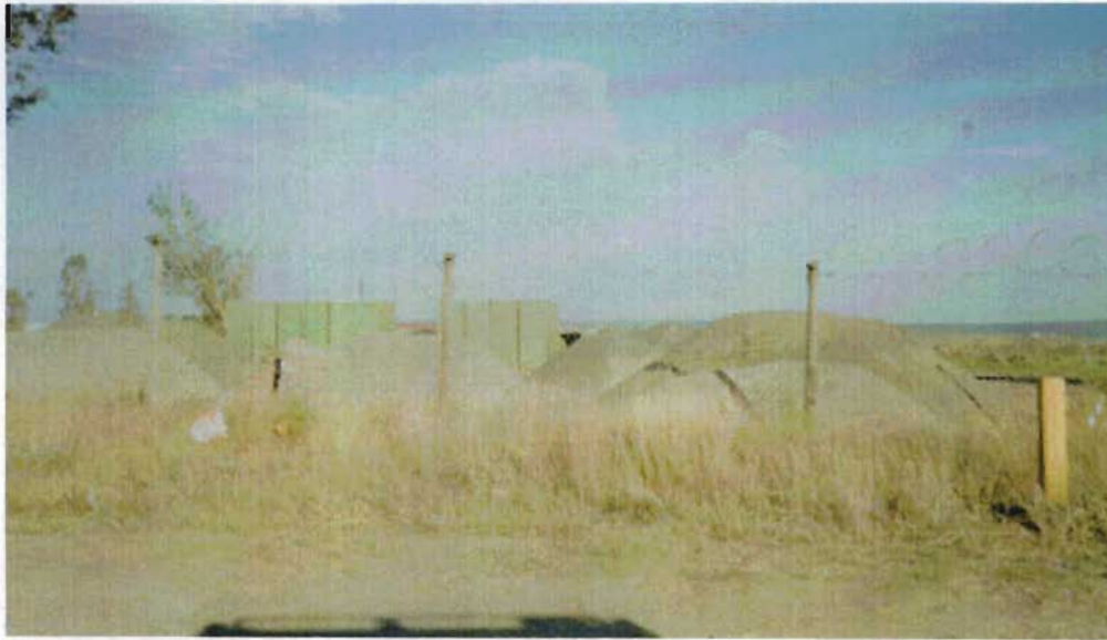
Fig. 4.4.3f Community engaged in blockmaking