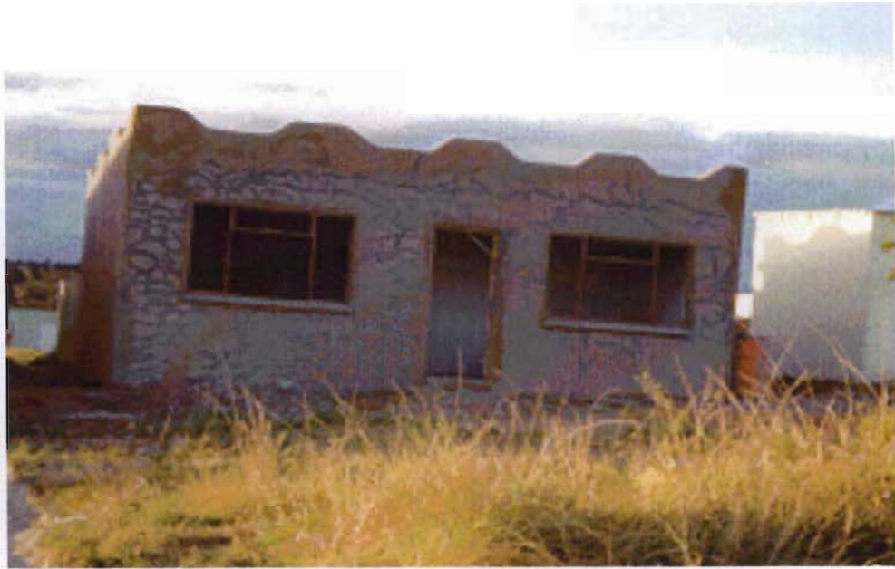
Fig. 4.4.3b Demonstration unit