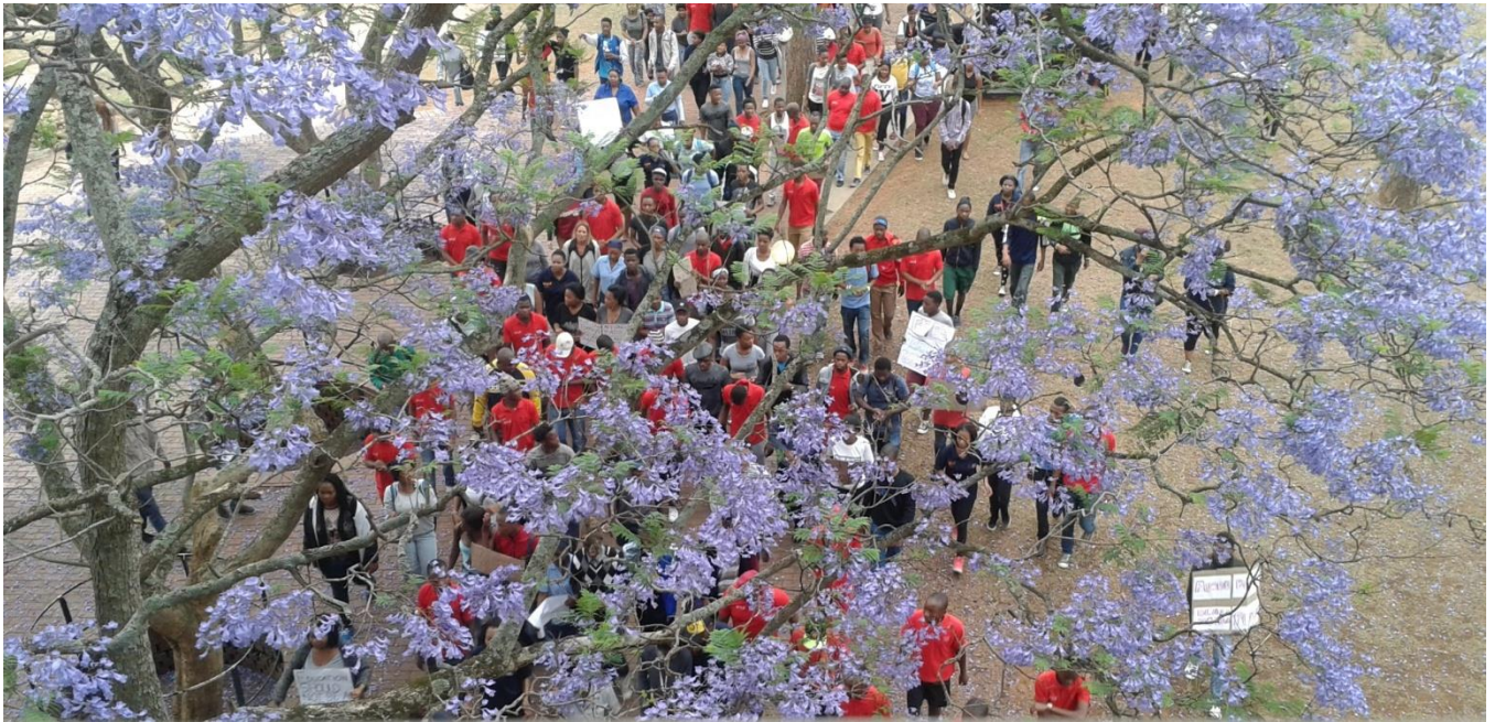
Figure 2.1. Pietermaritzburg UKZN students protest for free higher education. October 22, 2015.