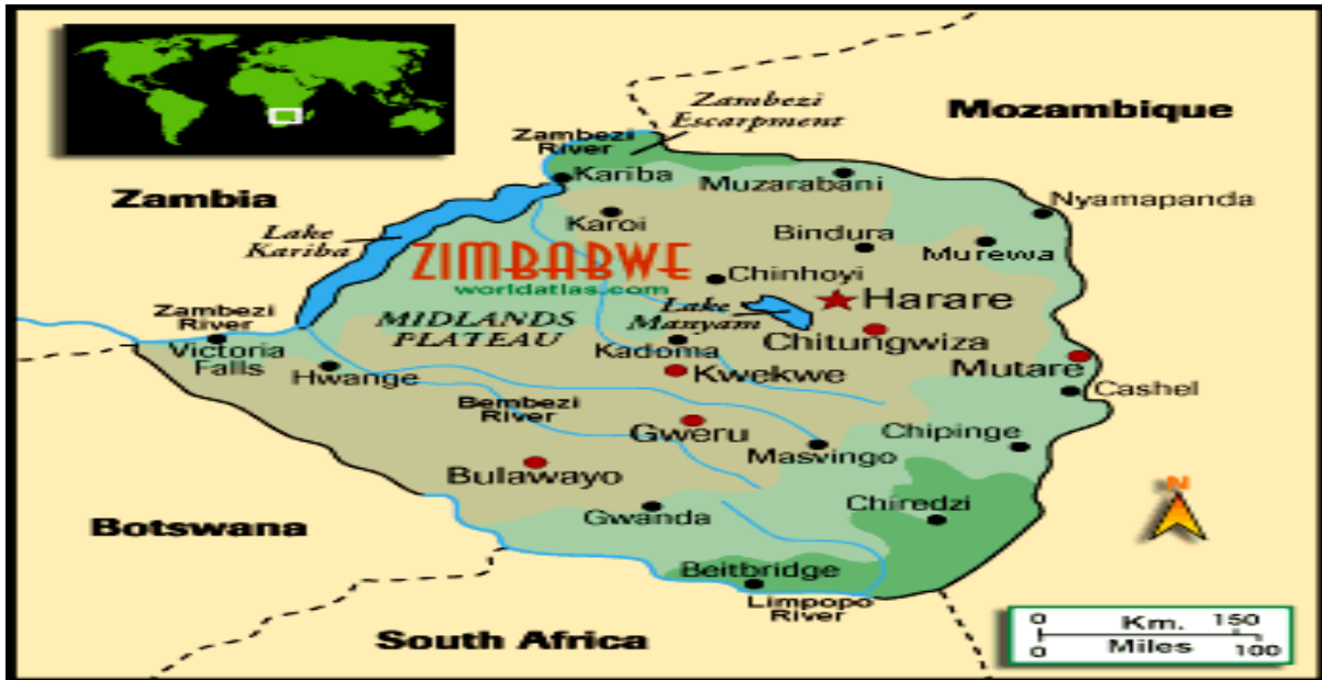
Fig. 3.1 Zimbabwe Information Centre Maps. www.worldatlas.com